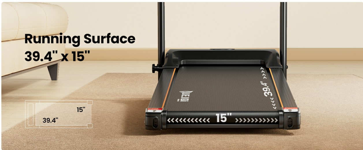
Image 8.3: Visual representation of the treadmill's compact folding design and dimensions for storage and portability.