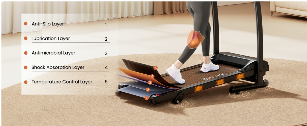
Image 8.2: Cross-section view illustrating the multi-layer construction of the running belt for comfort and durability.