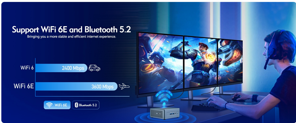
Image: Illustration of the GEEKOM Mini IT12's powerful Wi-Fi 6E and Bluetooth 5.2 capabilities, ideal for wireless peripherals and fast internet.