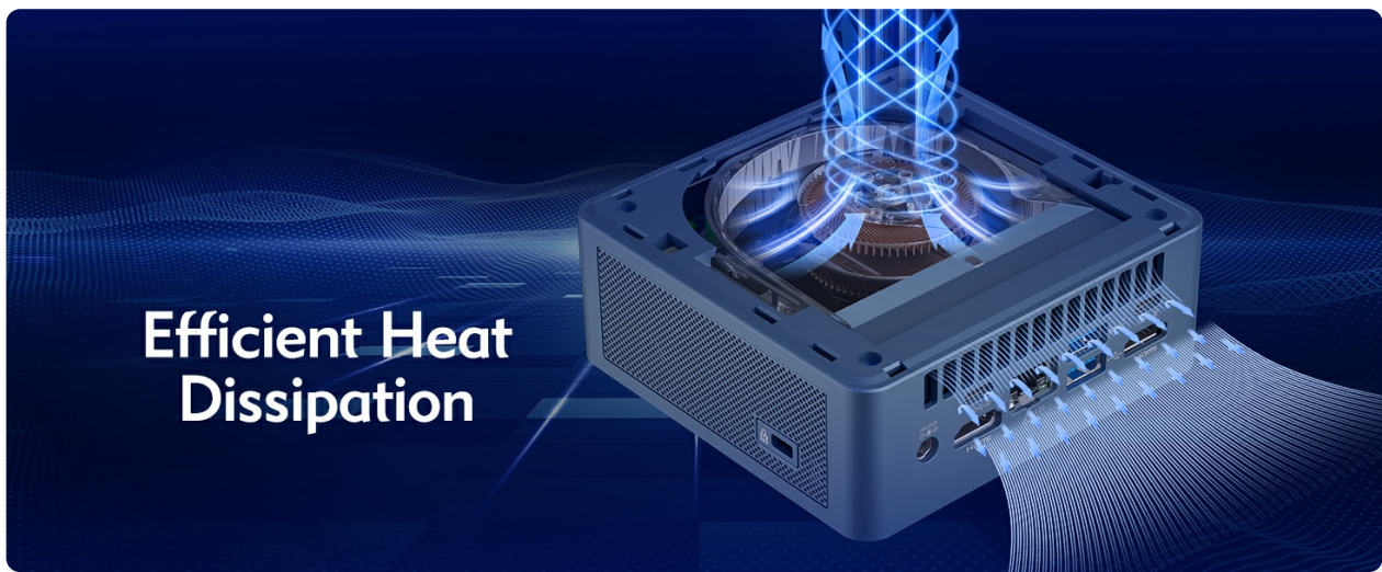
Image: An overview of the GEEKOM Mini IT12 highlighting its core specifications and features.