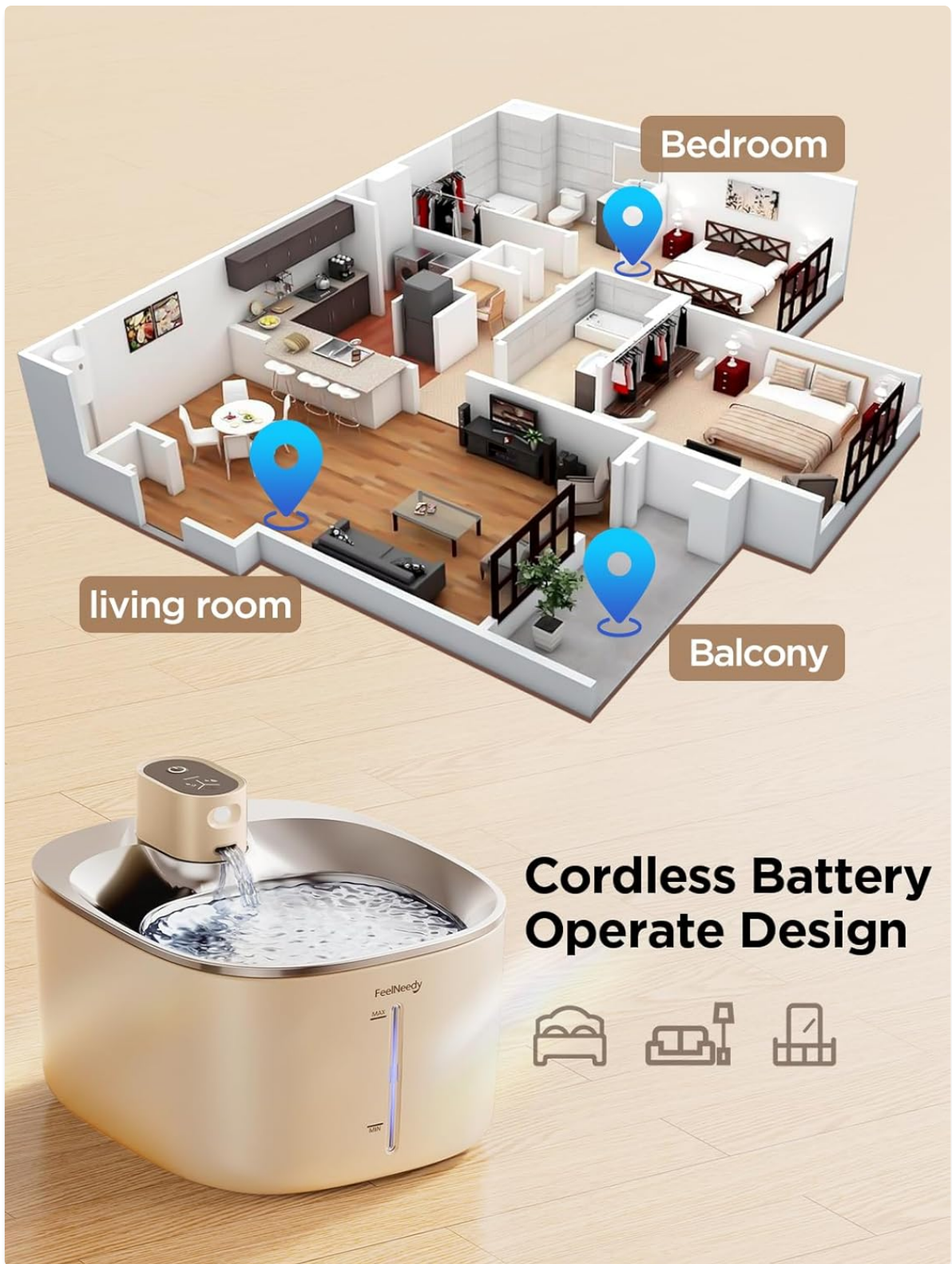
Image 5.1: Illustration demonstrating the flexibility of placing the cordless pet water fountain in different rooms like the living room, bedroom, or balcony.