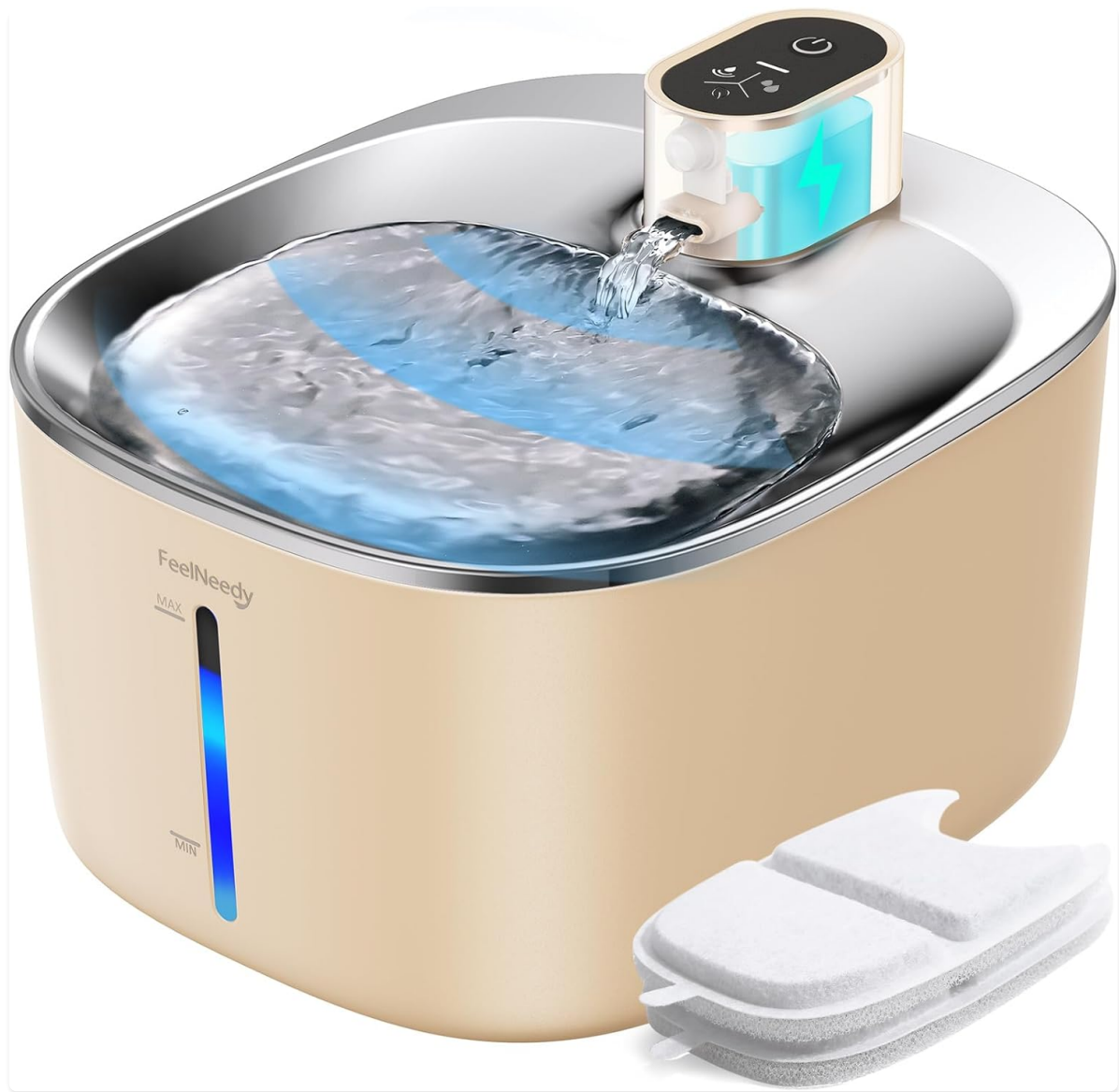
Image 1.1: The FEELNEEDY YPD-C004 Wireless Pet Water Fountain, showcasing its beige color, stainless steel top, and water flow. A filter is visible in the foreground.