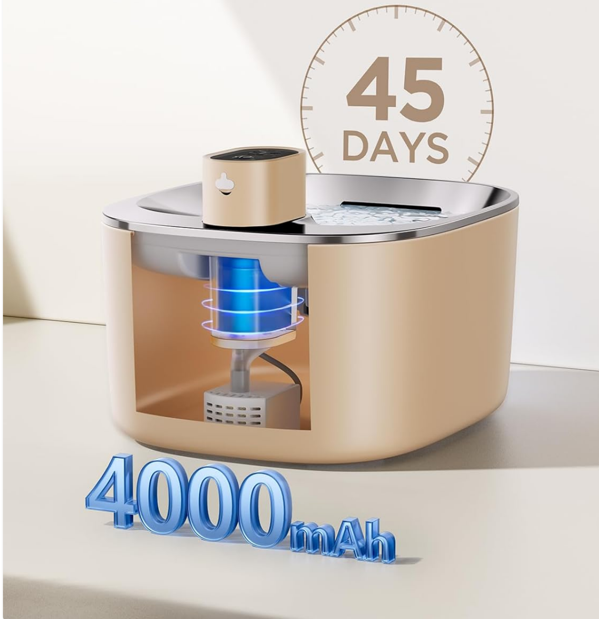
Image 6.2: Graphic illustrating the 4000mAh battery capacity and an estimated 45 days of operation.

With 4000mAh battery, leaving home confidently with non-stop filtered water