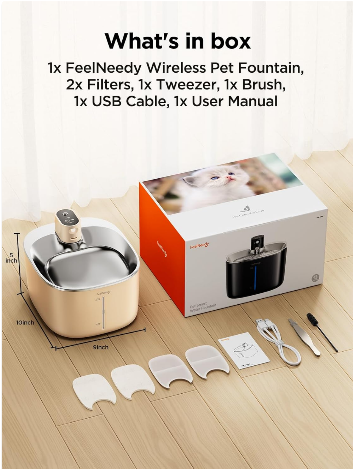
Image 3.1: Contents of the FEELNEEDY Pet Water Fountain box, including the fountain, filters, cleaning tools, USB cable, and user manual.

1x FeelNeedy Wireless Pet Fountain, 2x Filters, 1x Tweezer, 1x Brush, 1x USB Cable, 1x User Manual