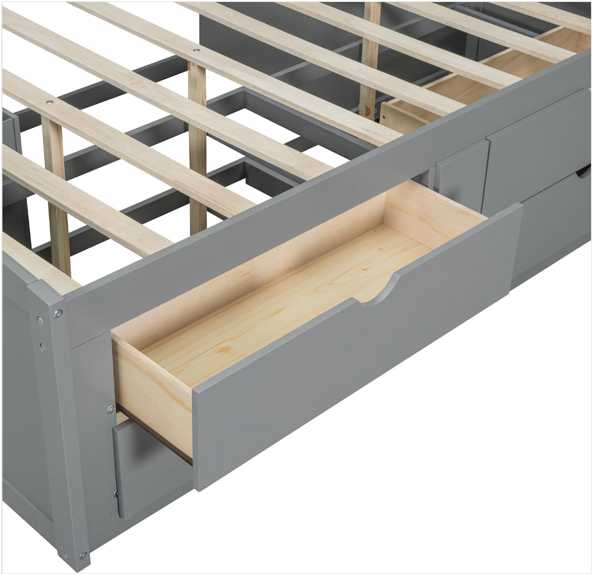
Image: Close-up of an open storage drawer.