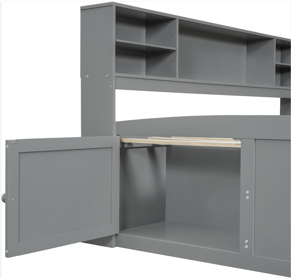
Image: Side cabinet with door open.