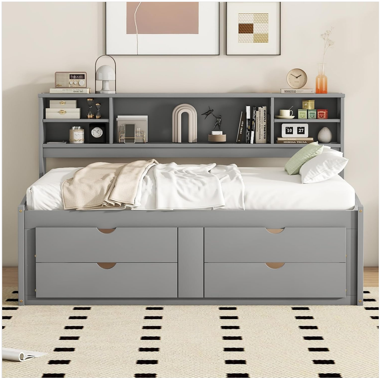
Image: Fully assembled daybed with mattress and items on the bookcase.