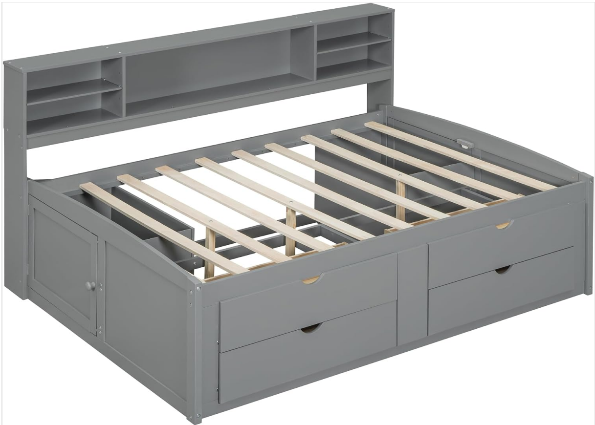
Image: Basic frame structure with slats and closed drawers during assembly.