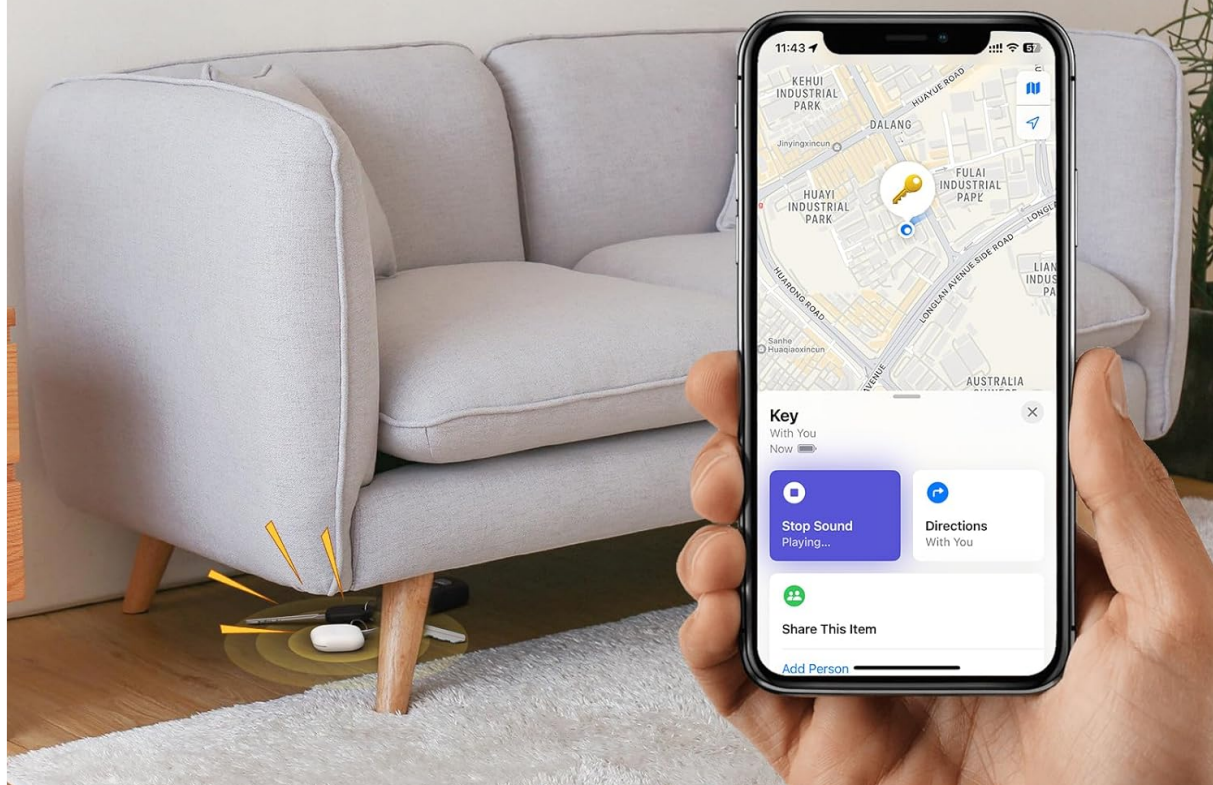
Image: Using the Find My app to locate the item finder nearby by playing a sound.

Click the 'Play Sound', you can find the location of the anti-lost device according to the ringtone.