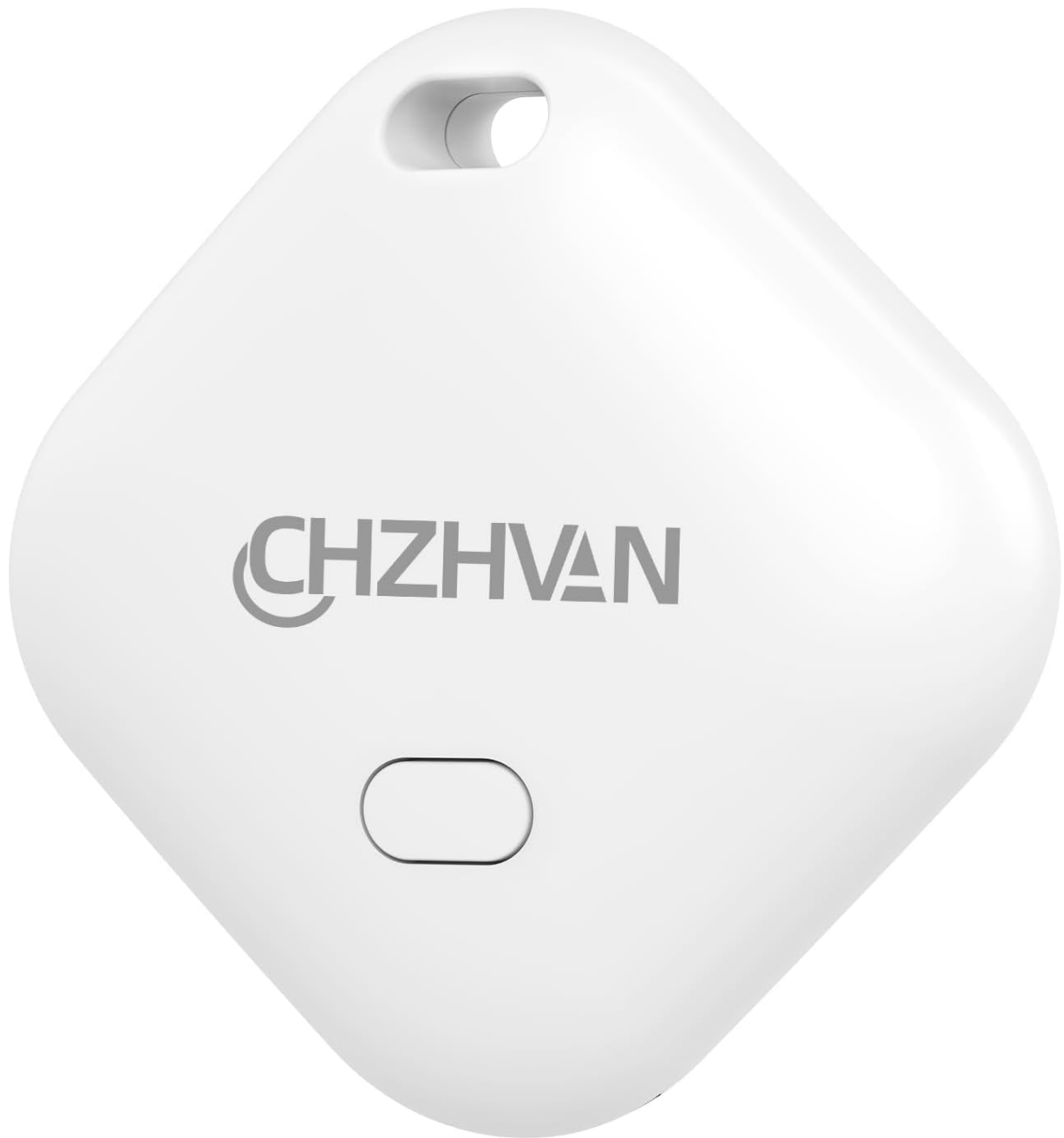
Image: The CHZHVAN Key Finder, a compact white tracking device.