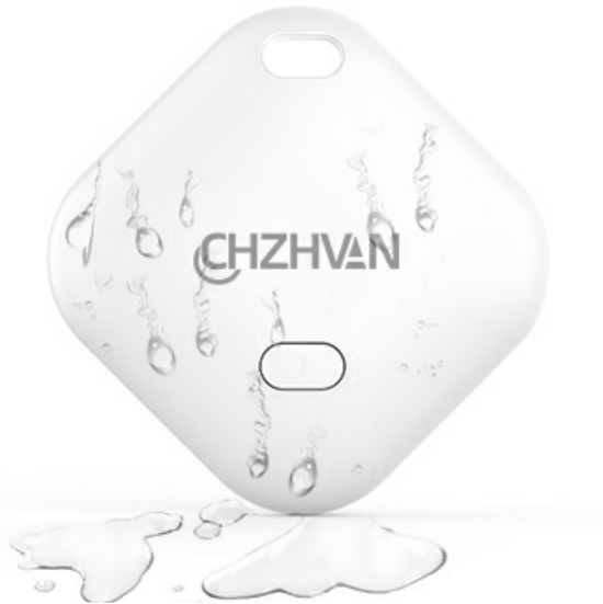
Image: Visual guide for pairing the CHZHVAN Key Finder with the Apple Find My app.