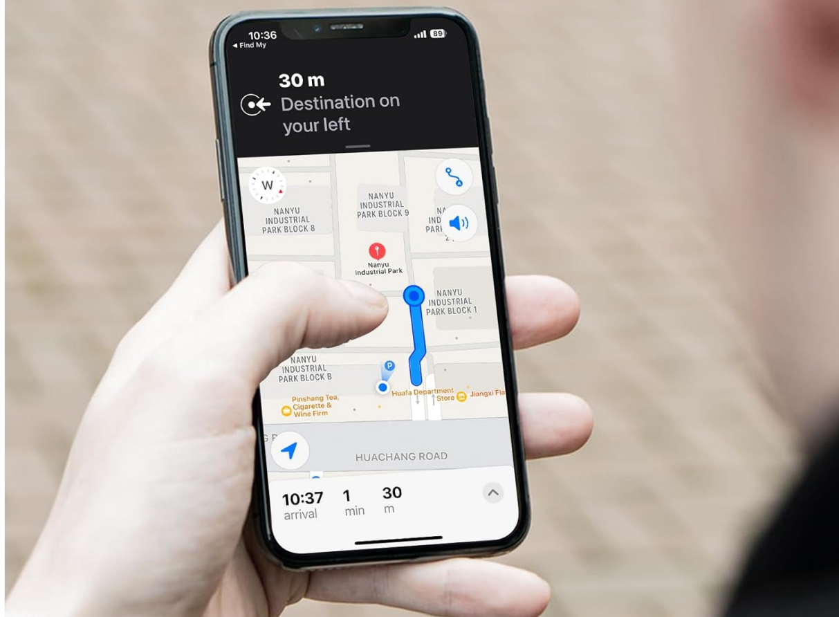
Image: The Find My app displaying the last known location of the item finder on a map.

When outside of Bluetooth range, view your most recent location on the map to find your 'Item Finder'.