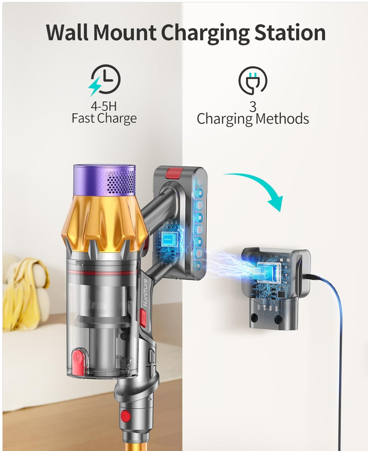
Figure 2: Wall mount charging station for the HONITURE X7.