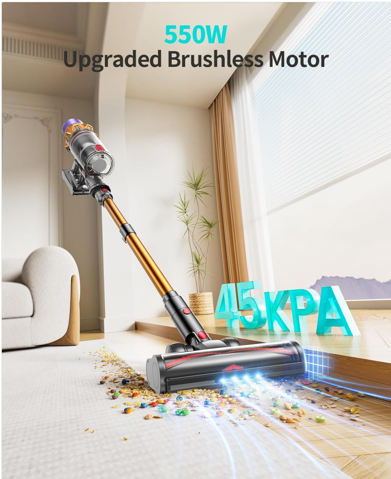
Figure 3: Assembled HONITURE X7 in stick vacuum configuration.