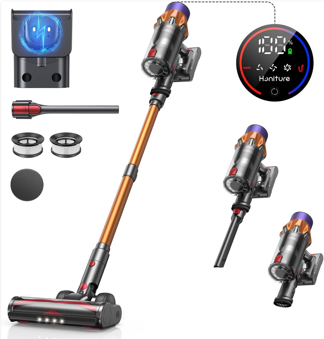
Figure 1: Overview of HONITURE X7 Cordless Vacuum Cleaner and its included accessories.