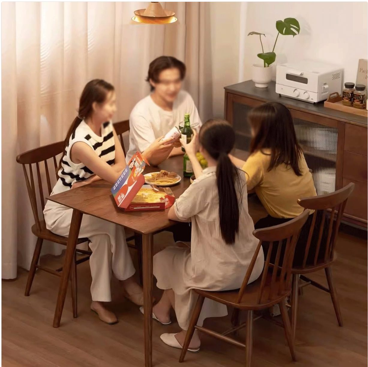
Figure 3: The dining table in use, accommodating multiple individuals.