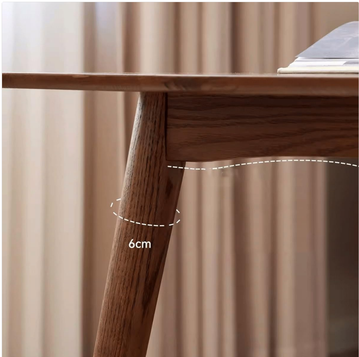
Figure 1: Detail of table leg attachment. Ensure secure fastening.