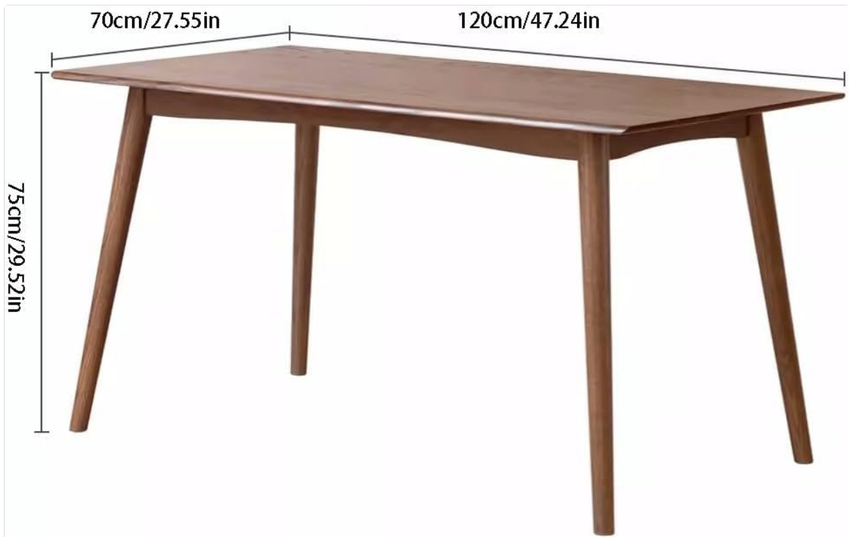
Figure 2: Overall dimensions of the dining table (Length: 120cm, Width: 70cm, Height: 75cm).