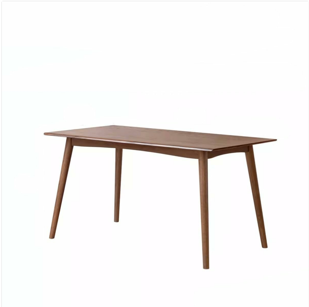
Figure 5: Under-table clearance measurement of 66cm.