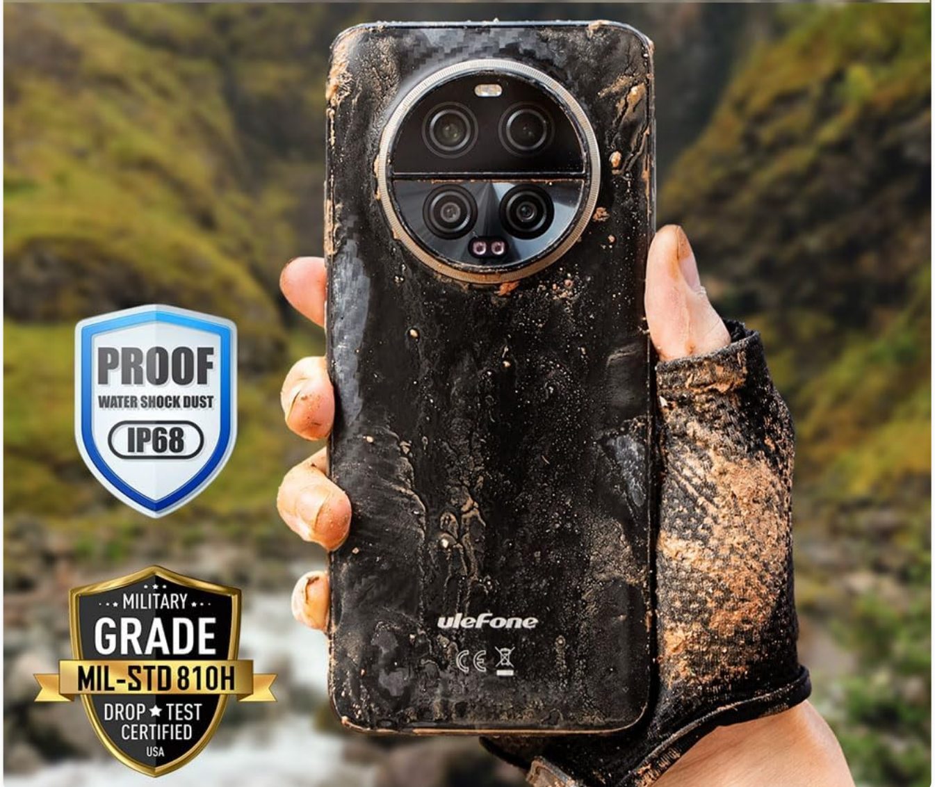
Figure 3: The rear view of the Ulefone Armor 23 Ultra, highlighting its IP68/IP69K and MIL-STD-810H certifications for water, shock, and dust resistance.