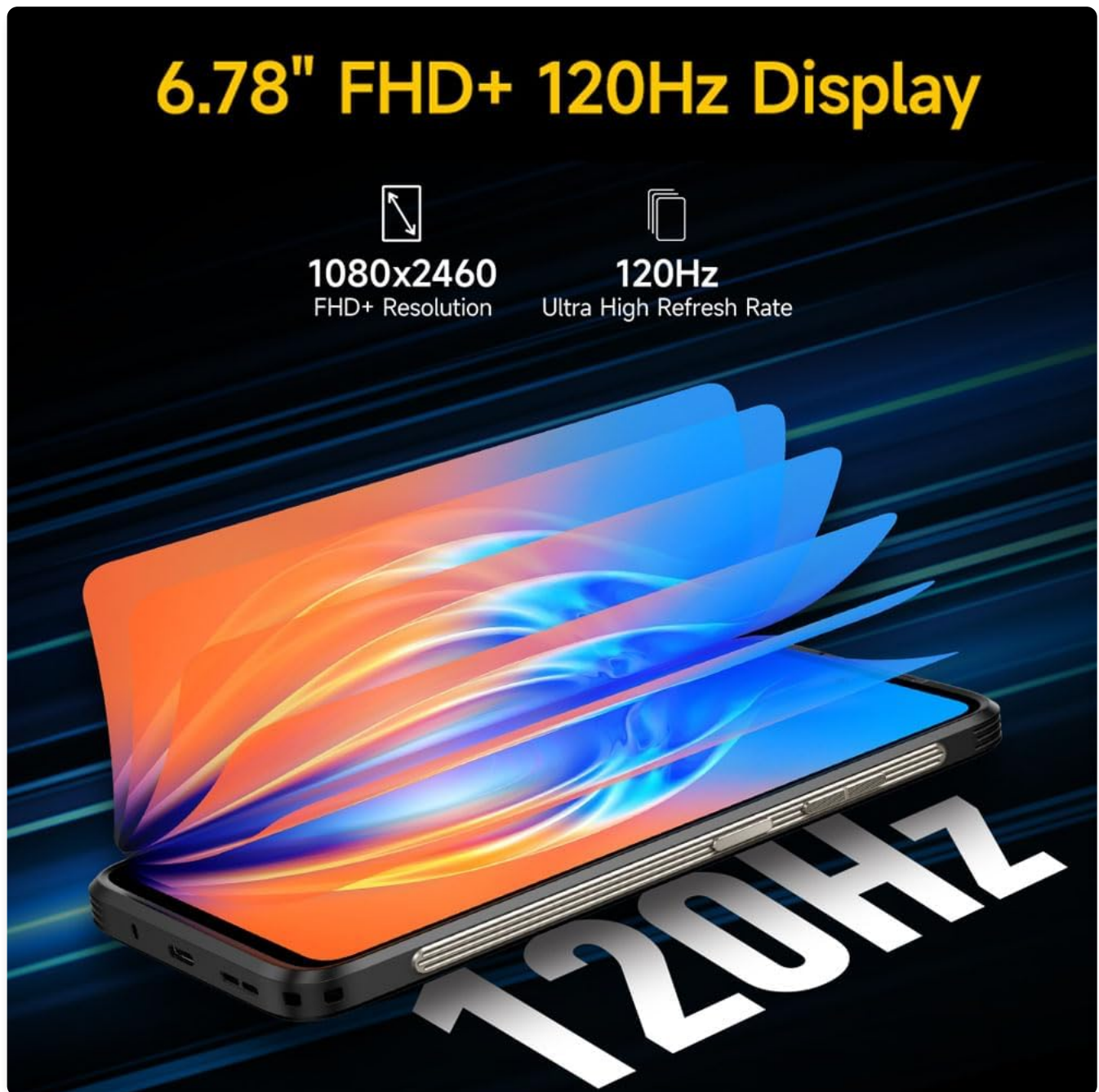
Figure 4: The vibrant 6.78-inch FHD+ display of the Ulefone Armor 23 Ultra, emphasizing its 120Hz ultra-high refresh rate for smooth visuals.

The Armor 23 Ultra boasts a 6.78-inch FHD+ display with a 120Hz refresh rate, providing a smooth and immersive visual experience for all content.