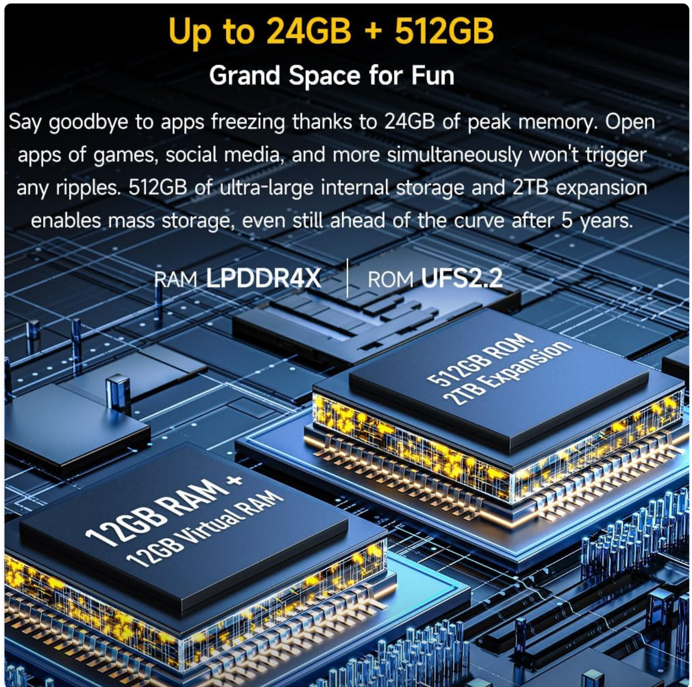
Figure 5: Visual representation of the Ulefone Armor 23 Ultra's memory configuration, showing 12GB RAM + 12GB Virtual RAM and 512GB ROM with 2TB expansion capability.

Powered by the Octa-Core MediaTek Dimensity 8020 5G chipset and accompanied by the Arm Mali-G77 GPU, the device offers robust performance. With 12GB physical RAM and an additional 12GB virtual memory (totaling 24GB), multitasking and demanding applications run smoothly. The 512GB internal storage, expandable up to 2TB, provides ample space for all your files.