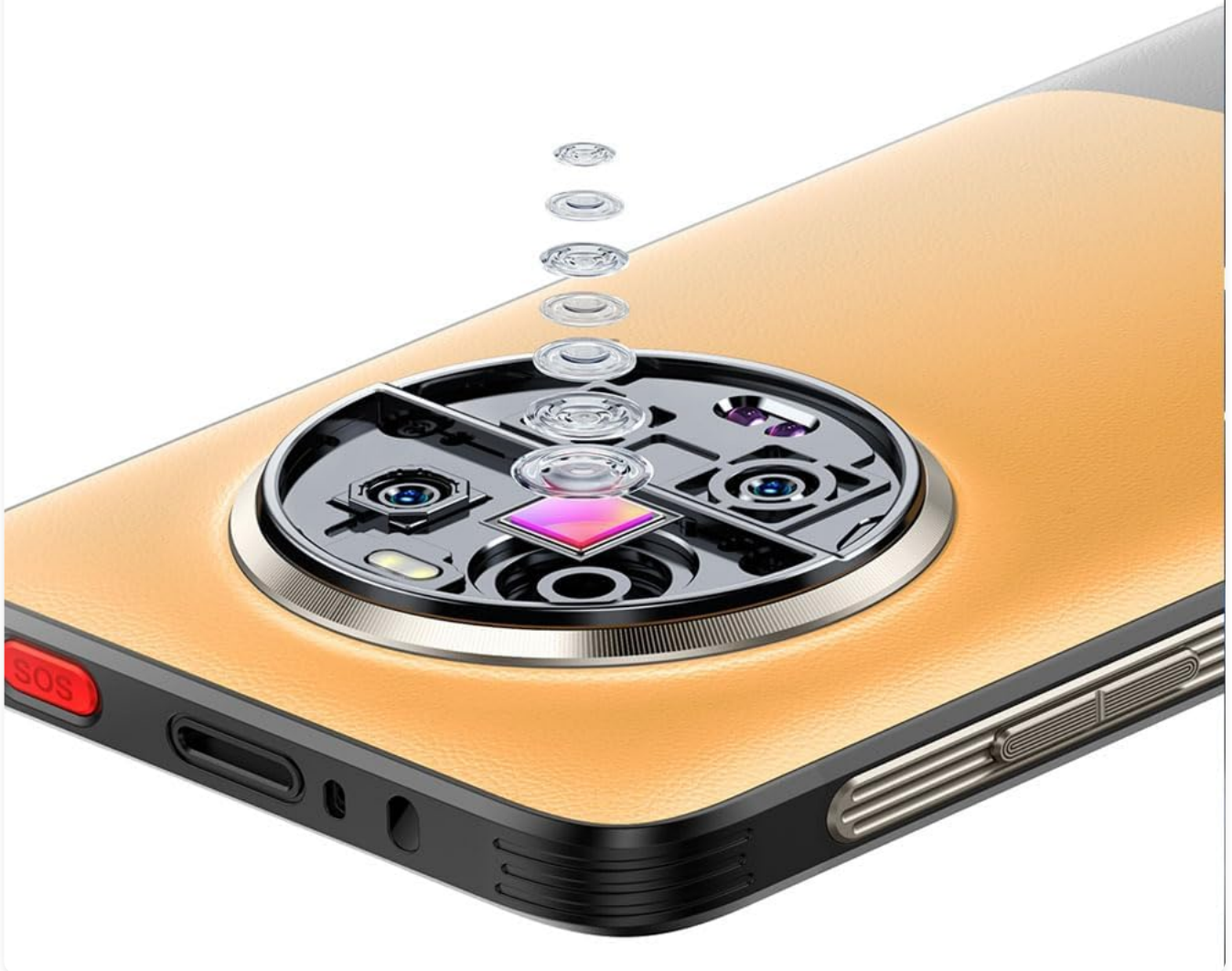
Figure 9: Close-up of the Ulefone Armor 23 Ultra's 50MP wide-angle camera with its 1/1.31" ultra-large lens, designed for capturing detailed and vibrant images.