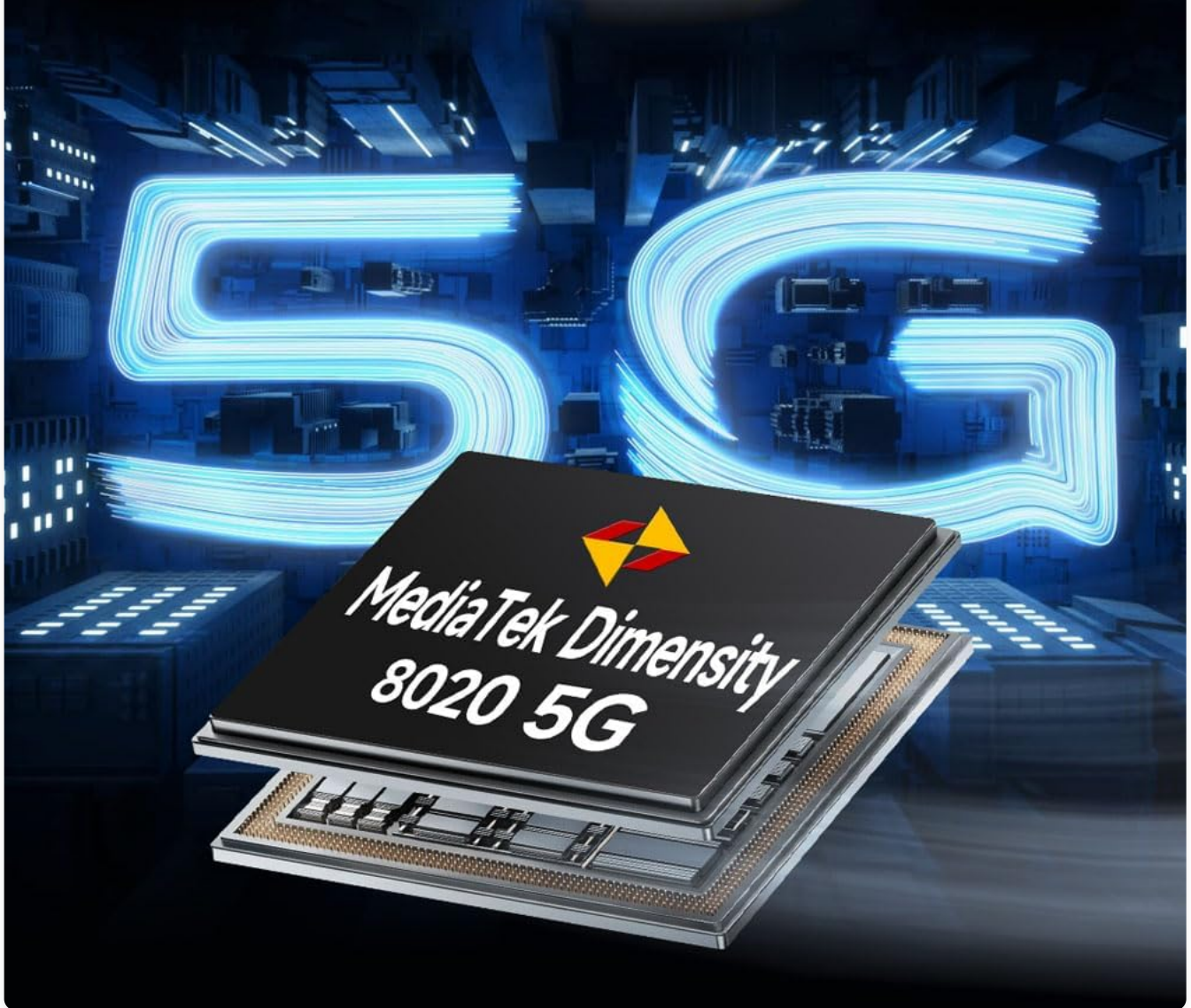
Figure 6: A close-up of the MediaTek Dimensity 8020 5G chipset, highlighting its role as a performance pioneer in the Ulefone Armor 23 Ultra.