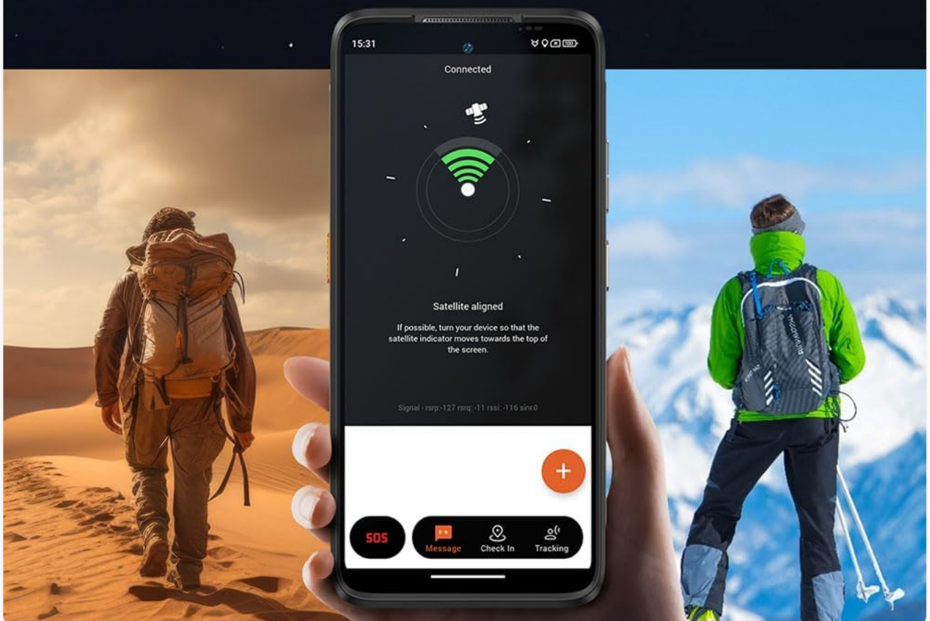
Figure 10: The Bullitt Satellite Messenger App interface on the Ulefone Armor 23 Ultra, demonstrating its two-way satellite messaging capabilities for staying connected off-grid.

In a cellular and WiFi dead zone? The Armor 23 Ultra has integrated two-way satellite messaging which you can rely on no matter how far off grid your adventure takes you.*