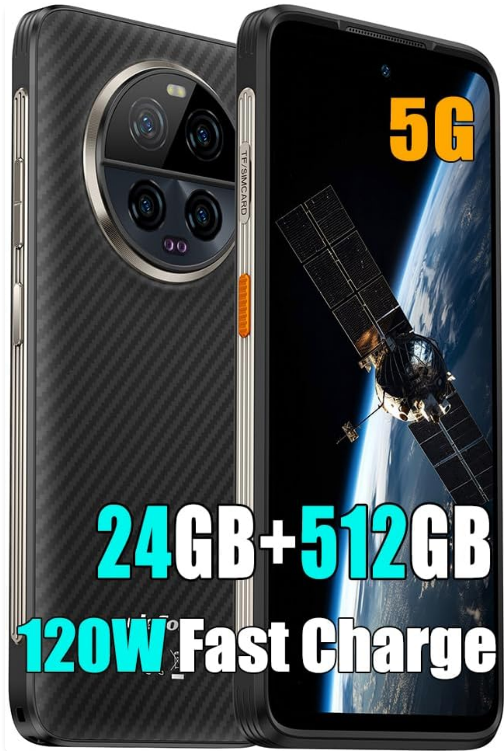
Figure 1: Ulefone Armor 23 Ultra 5G Rugged Smartphone, showcasing its robust design and key features like 5G connectivity, 24GB RAM, 512GB storage, and 120W fast charging.