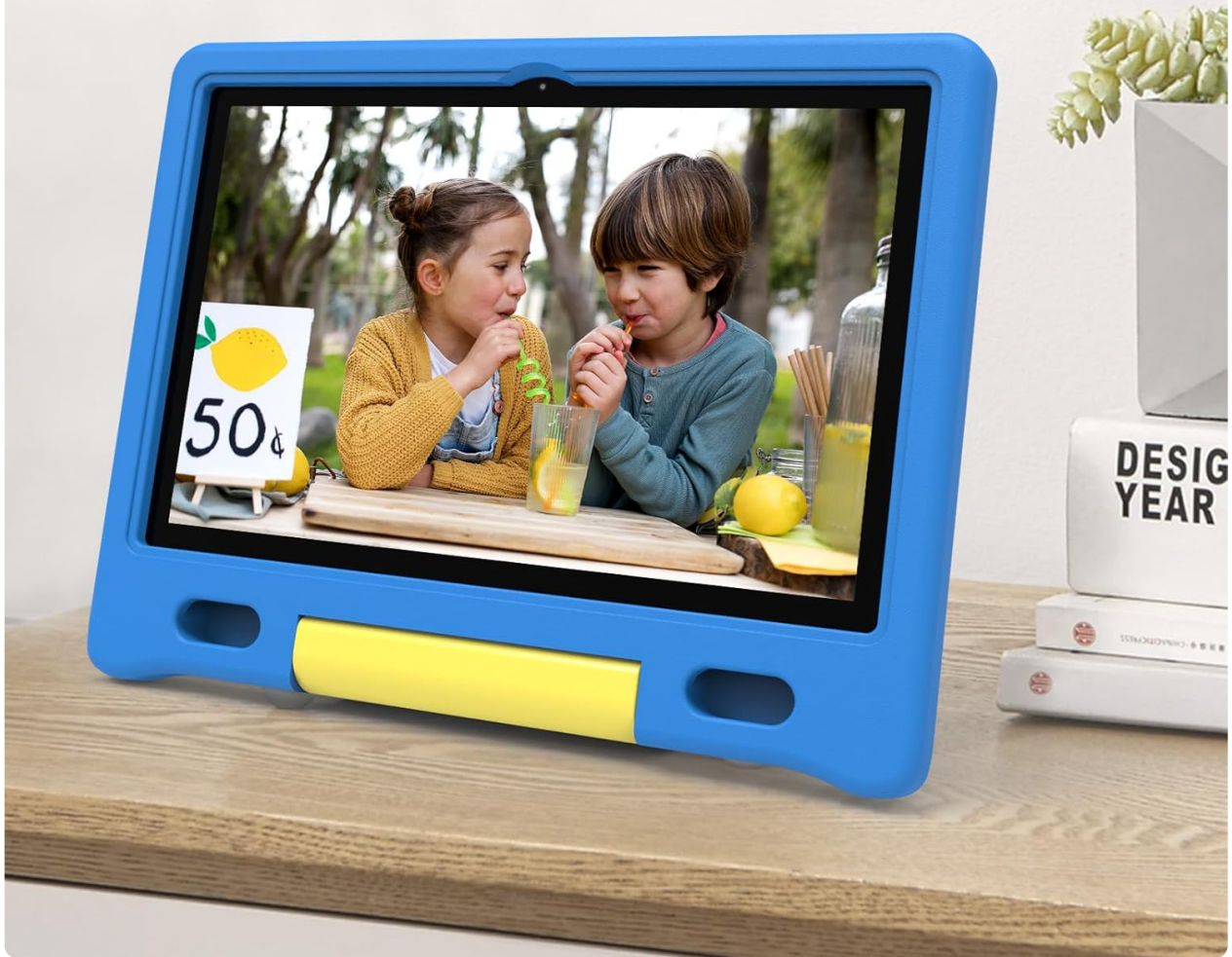
The ApoSign Kids Tablet K109A displaying its 1280x800 IPS touchscreen, shown with two children interacting with the device.