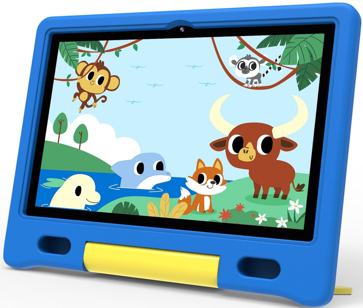
Front view of the ApoloSign Kids Tablet K109A in blue, featuring a vibrant display and a durable, child-friendly case with a yellow kickstand.