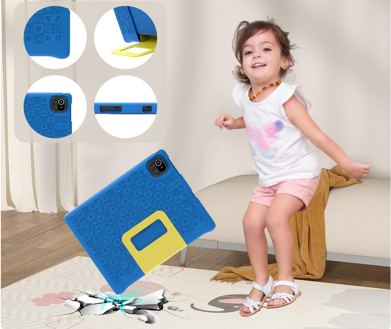
The ApoloSign Kids Tablet K109A in its durable, shockproof blue case, with an image of a child jumping, symbolizing the case's drop protection.