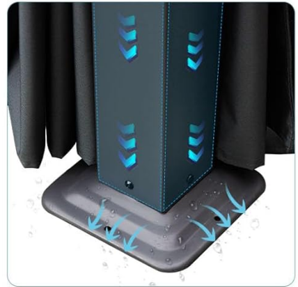
● Drain Out