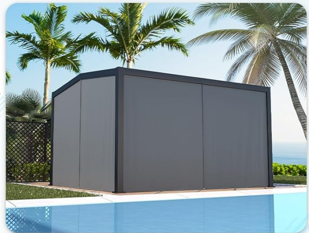
Image 5.2: The curtains and netting offer customizable privacy and protection.