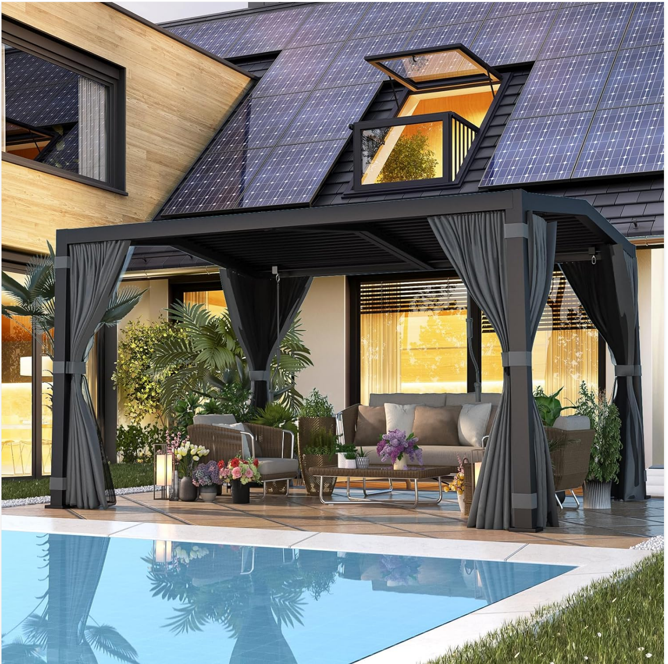
Image 1.1: EROMMY 11' x 13' Louvered Pergola in an outdoor setting.