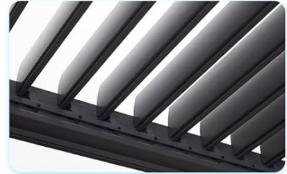
Aluminum Alloy Roof Panel