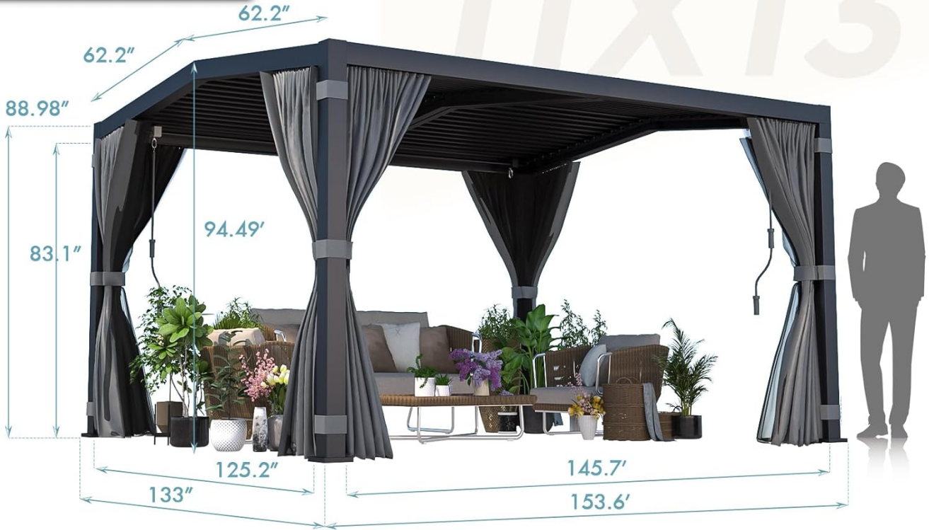
Image 8.1: Dimensional overview of the EROMMY 11' x 13' Louvered Pergola.