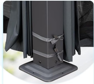
Durable Anchor Frame