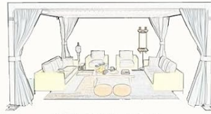
With Outdoor Sofa

Suitable for parties of at least 6 people