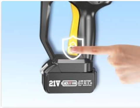
Image: A finger engaging the safety lock mechanism near the trigger of the pressure washer, preventing accidental starts.