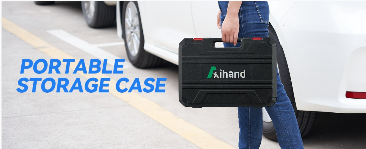
Image: The Aihand pressure washer and its components stored neatly within its dedicated portable storage case, emphasizing ease of transport and organization.