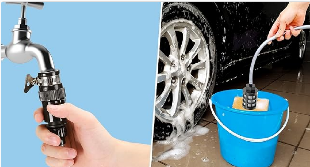
Image: Demonstrates two primary water supply methods: direct connection to a faucet using an adapter and drawing

The Aihand pressure washer supports multiple water supply methods: