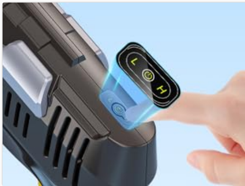
Image: A finger pressing the control buttons on the pressure washer, labeled 'L' for Low (Eco) and 'H' for High (Auto) pressure modes.

Use the +/- button on the unit to switch between Eco and Auto modes.