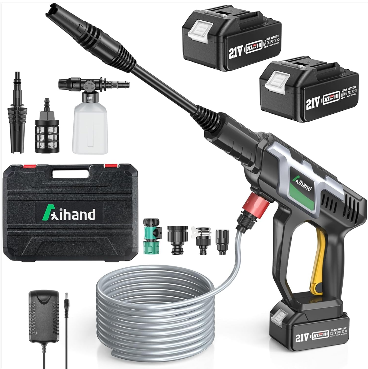
Image: Overview of the Aihand Cordless Pressure Washer, including the main unit, two batteries, charger, hose, foam cannon, and various adapters, all neatly packed in a portable storage case.