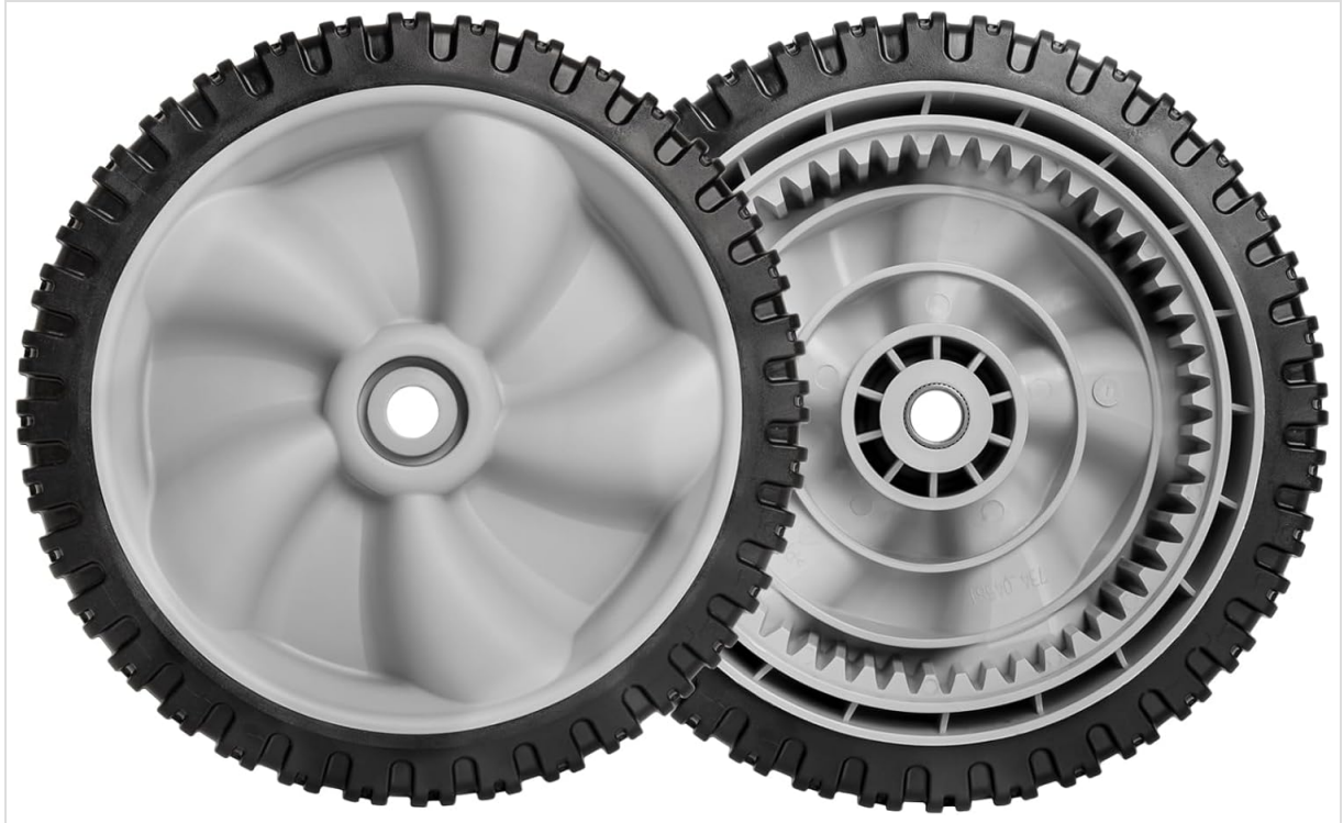
Figure 1: Front and back view of the Bularie 734-04581 Front Drive Wheels.