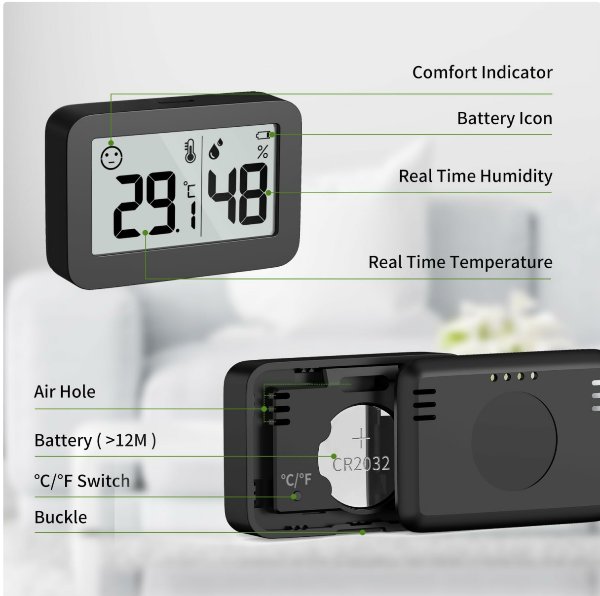
Image: Detailed diagram showing the components of the hygrometer, including the comfort indicator, battery icon, real-time humidity, real-time temperature, air hole, battery compartment, and °C/°F switch button.