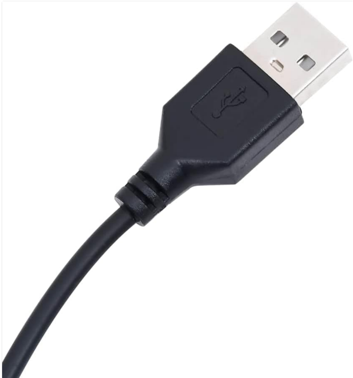
Figure 5: The USB connector used to power the LED lighting system.