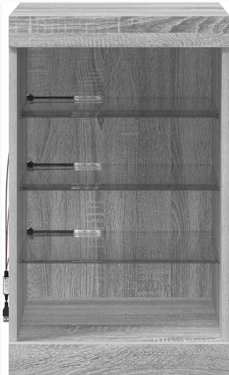
Figure 2: Close-up of the sideboard's interior, highlighting the placement of the glass shelves and the integrated LED light strip along the back edge, with wiring visible.