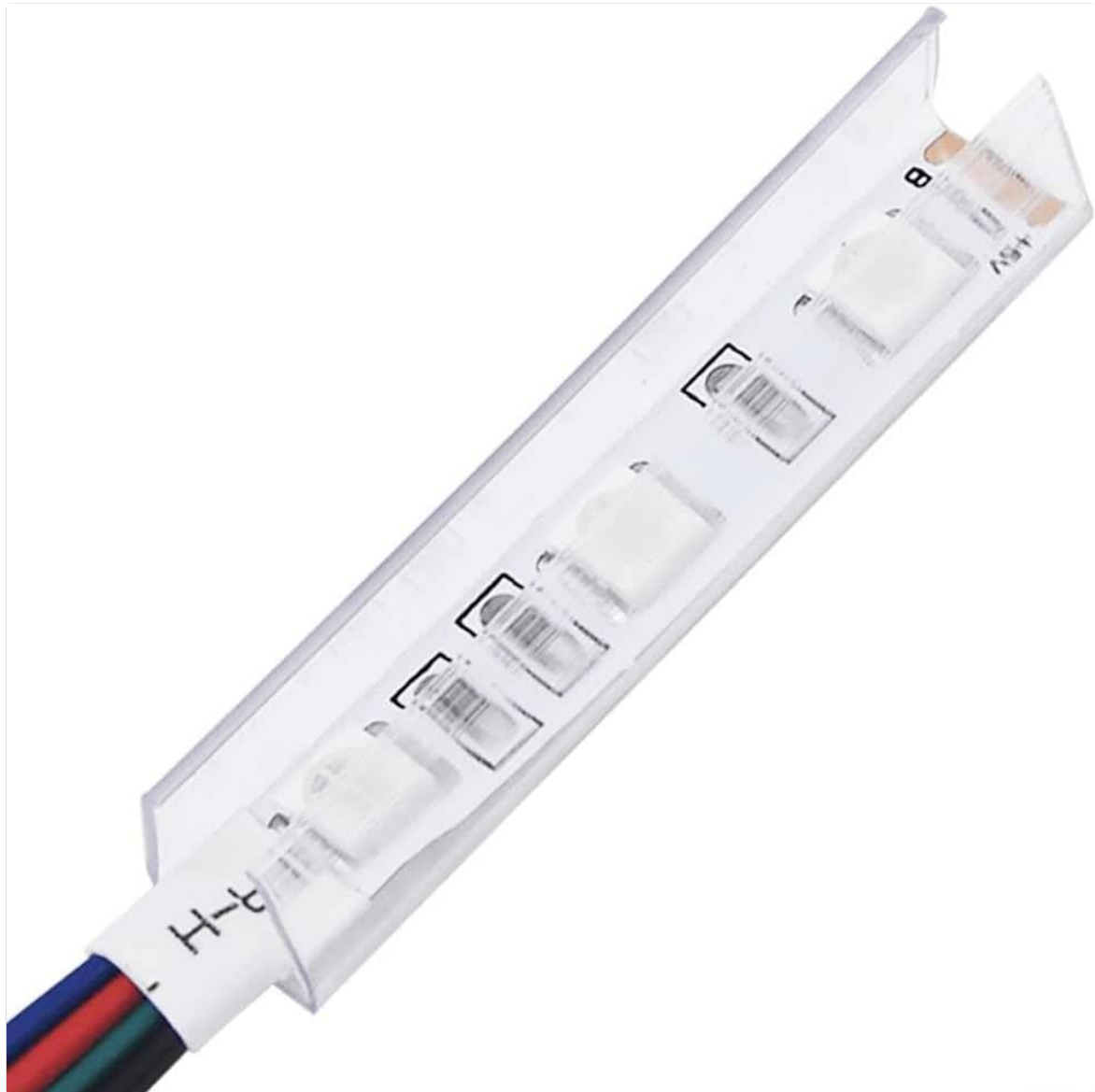
Figure 3: The flexible LED light strip, designed for installation within the sideboard.