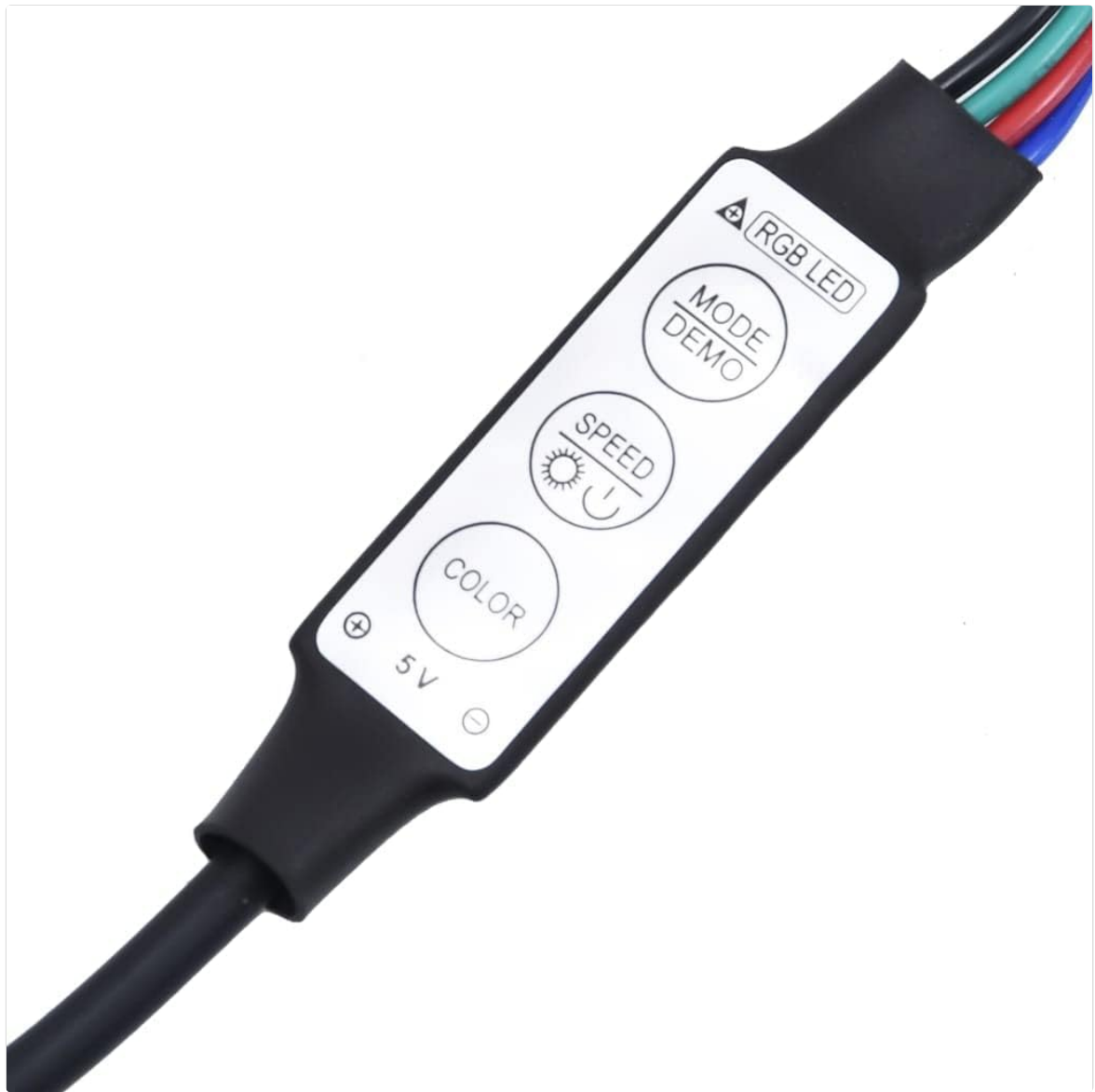
Figure 4: The inline RGB LED controller, featuring buttons to adjust lighting mode, speed, and color settings.