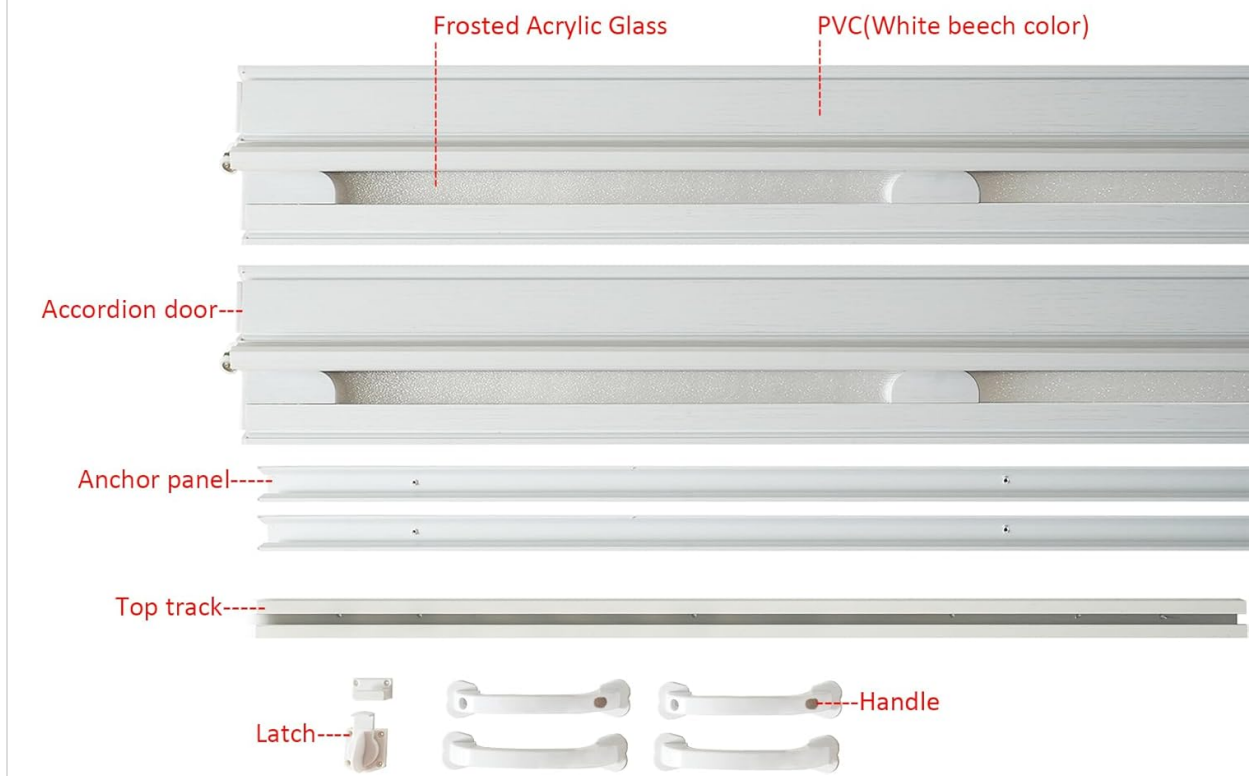
Figure 2.2: Included Components. This image illustrates all the components included in the full product set: PVC door panels with frosted acrylic, the anchor panel, top track, handles, and latch. Each part is clearly labeled for identification.