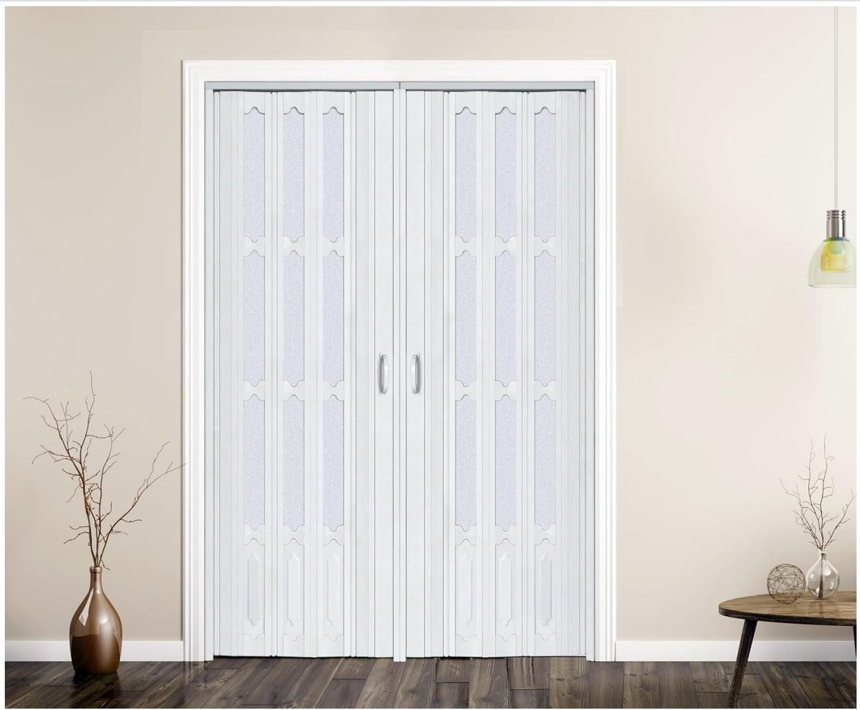
Figure 2.1: DIYHD Bi Folding Accordion Closet Door installed. This image shows the DIYHD bi-folding accordion door fully installed, presenting its white finish and frosted acrylic panels. The door is closed, demonstrating its function as a room divider or closet door.