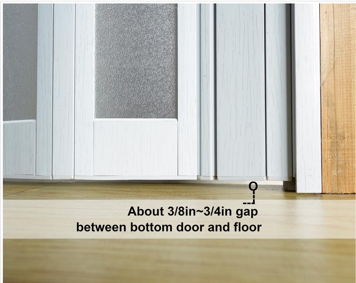
Figure 4.1: Floor Gap. This image clarifies the expected gap between the bottom of the installed door and the floor, which should be approximately 3/8 inch to 3/4 inch. This detail is important for proper door function and clearance.