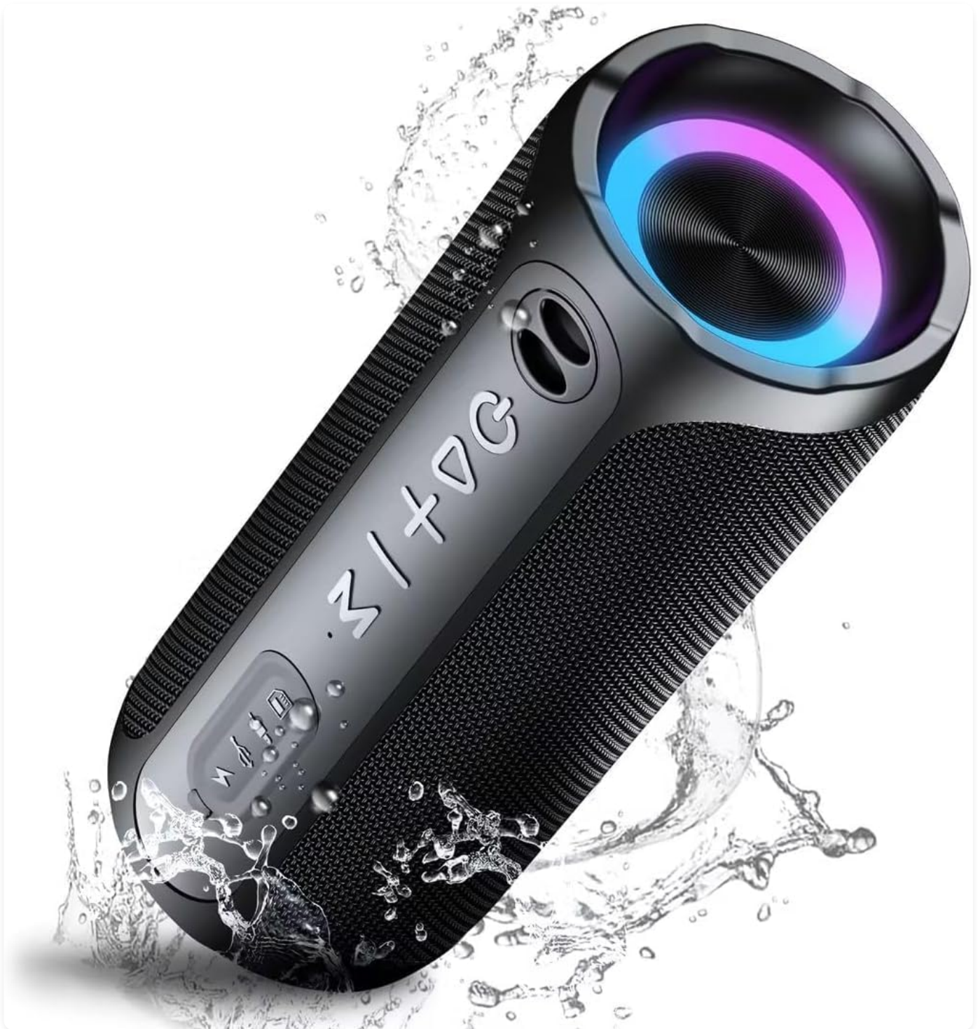
Image: The IKG Portable Bluetooth Speaker M9, showcasing its sleek black design and water splash resistance.