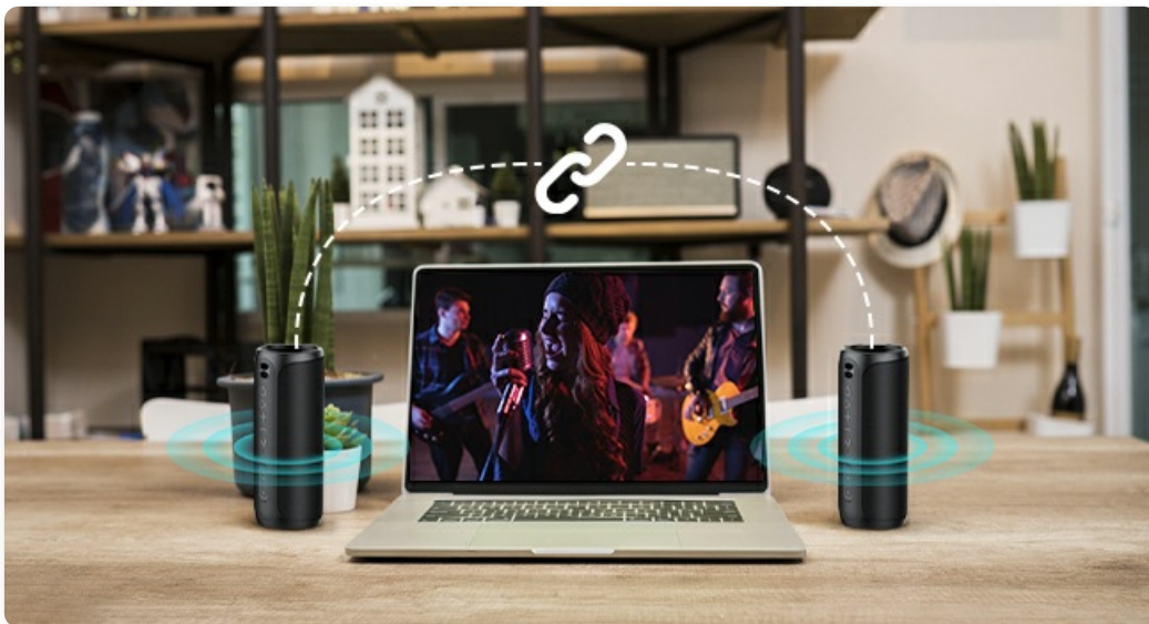
Image: Two IKG M9 speakers wirelessly connected to a laptop, illustrating the True Wireless Stereo (TWS) pairing setup.