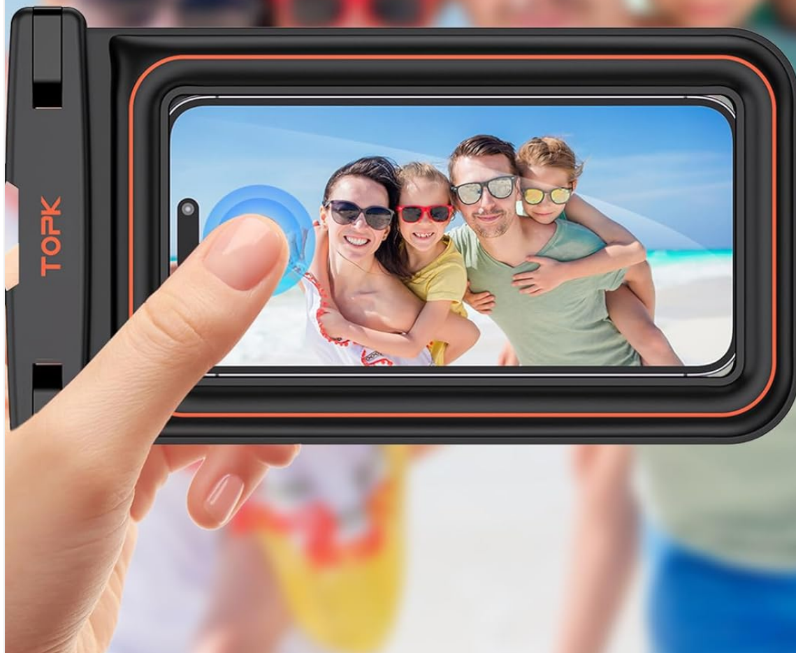
Image: Demonstrating touchscreen functionality through the pouch.