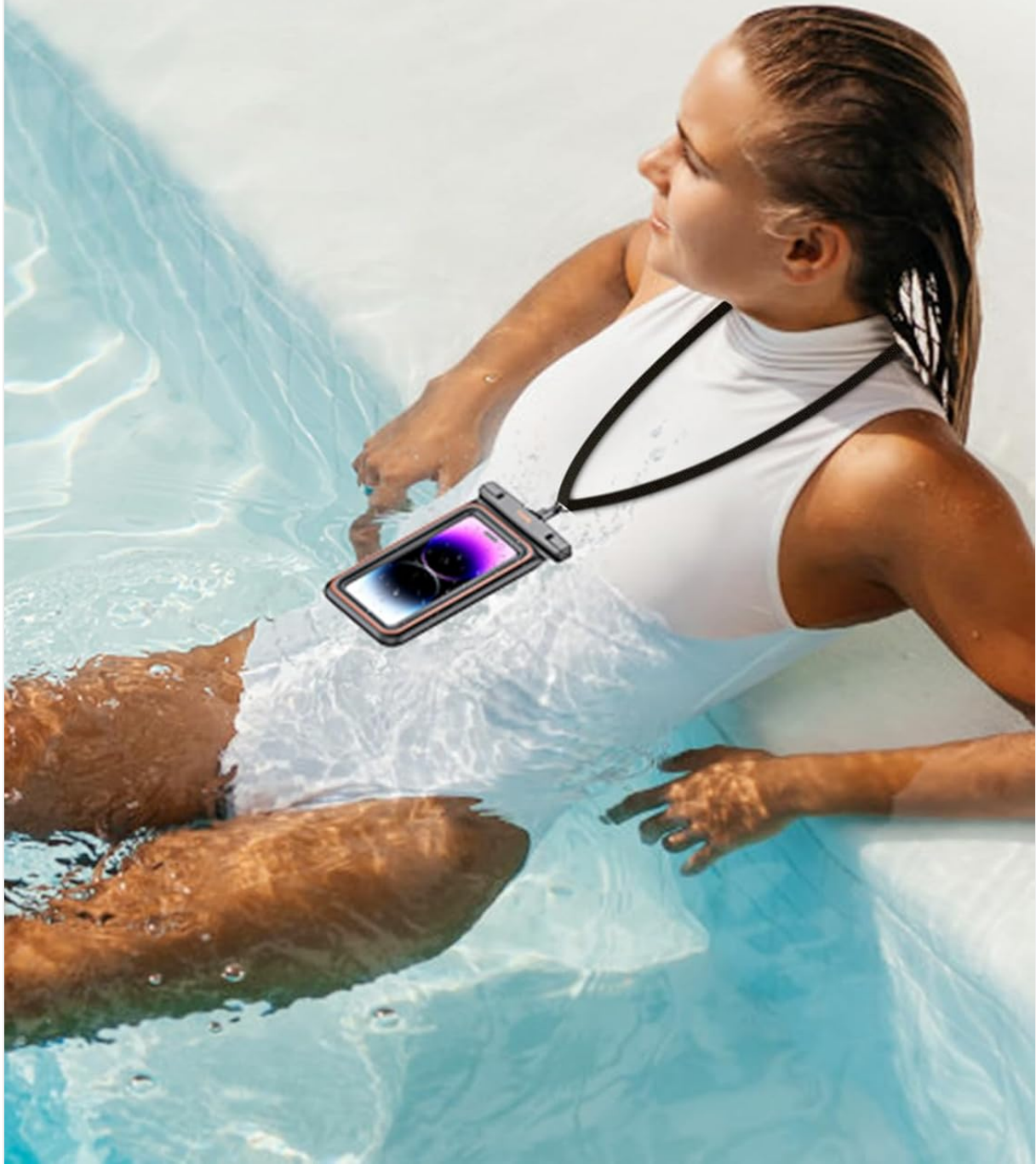
Image: The pouch floating on water, secured by a lanyard.