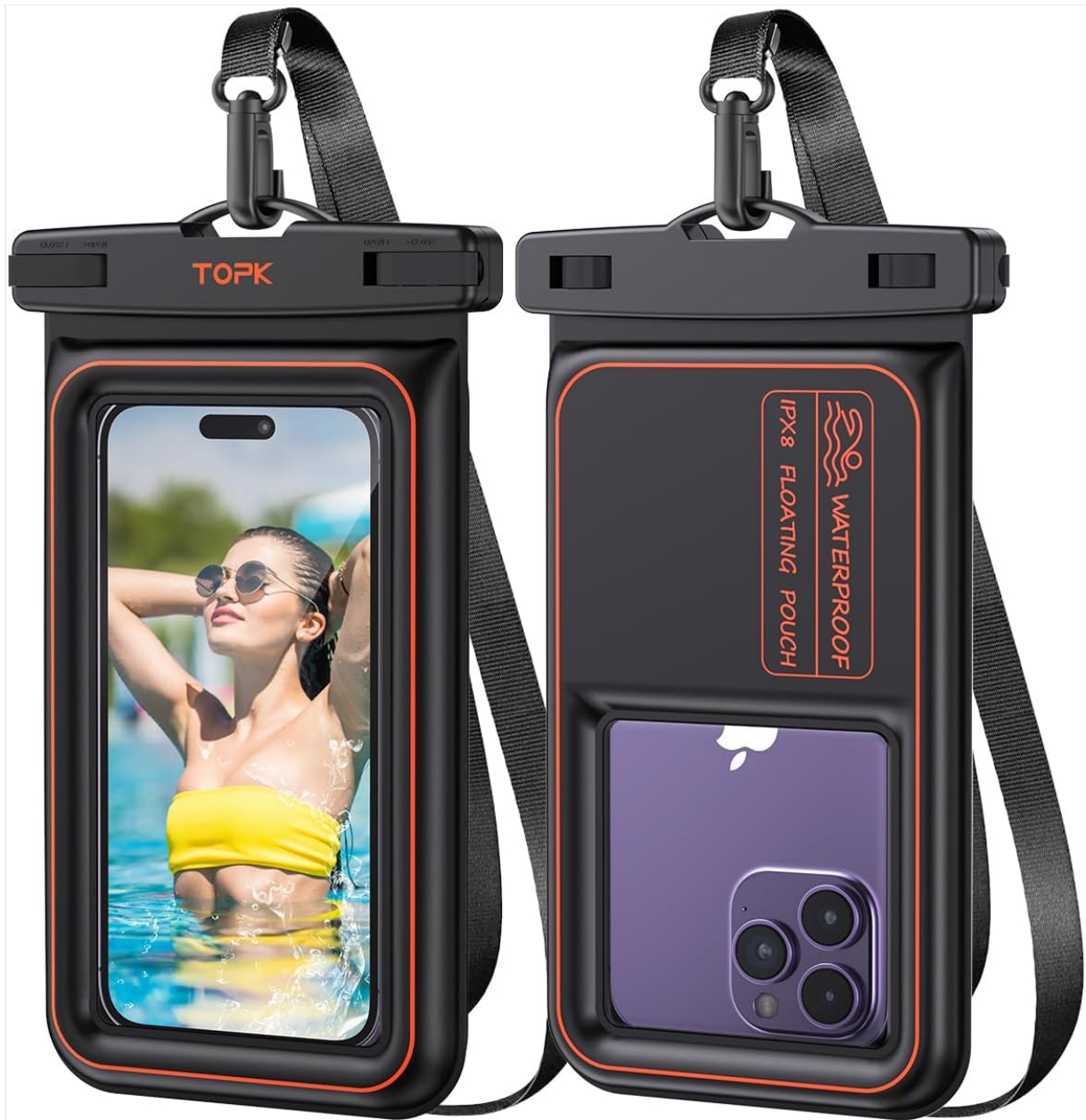
Image: The TOPK IPX8 Floating Waterproof Phone Pouch, showcasing its design and waterproof capability.