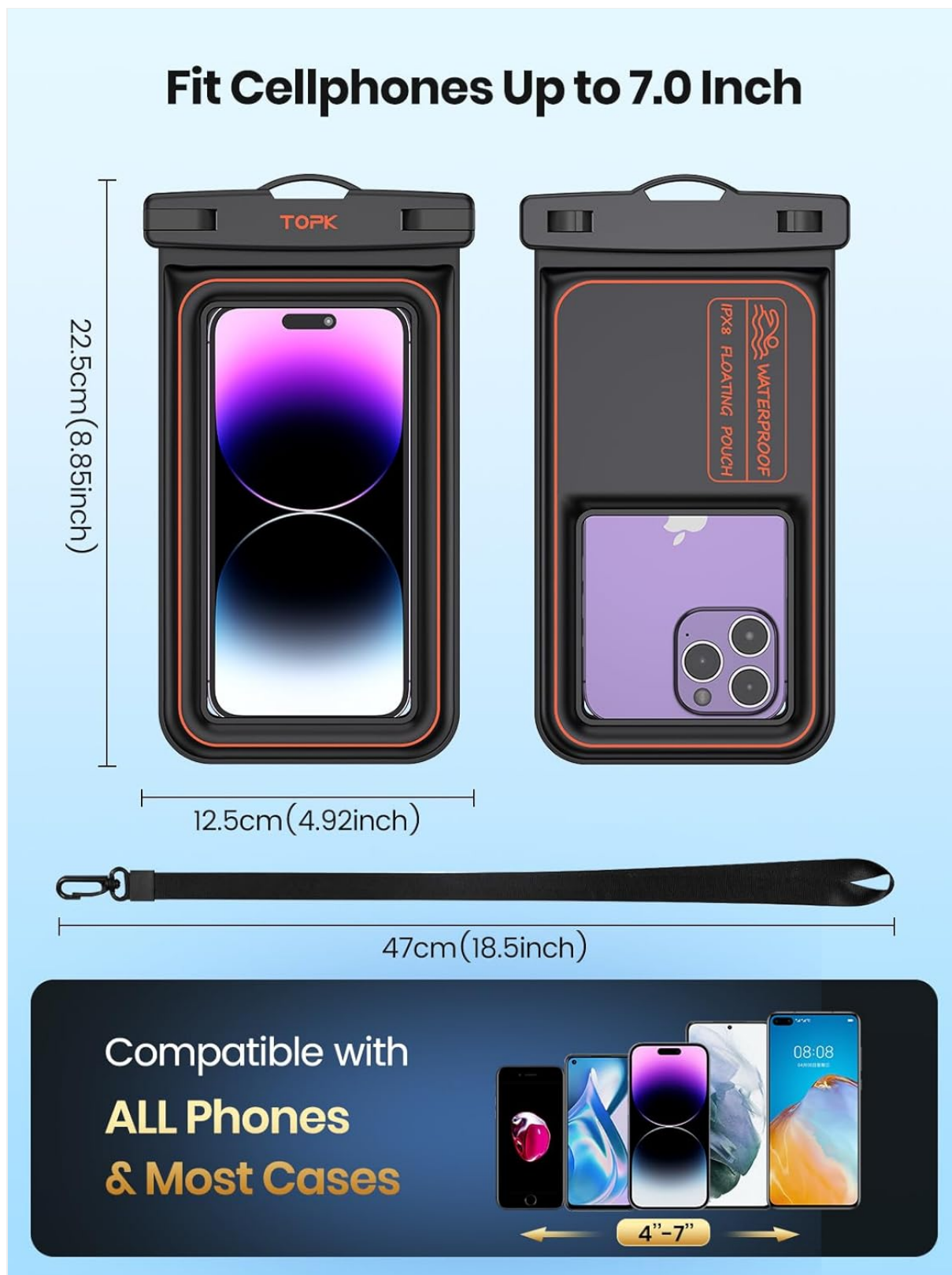
Image: Dimensions and phone compatibility of the pouch.

4. Firmly press the sealing clips inwards until they click into place, ensuring a complete seal.