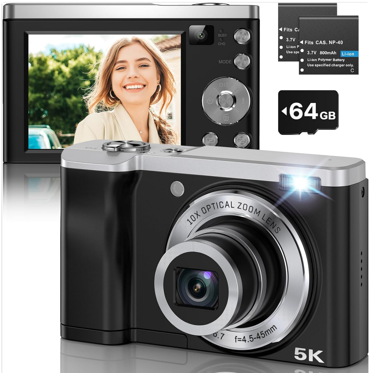
Figure 1: Contents of the Ahlirmoy 56MP 5K Digital Camera package, including the camera, two batteries, a 64GB Micro SD card, USB cable, protective case, and user manual.