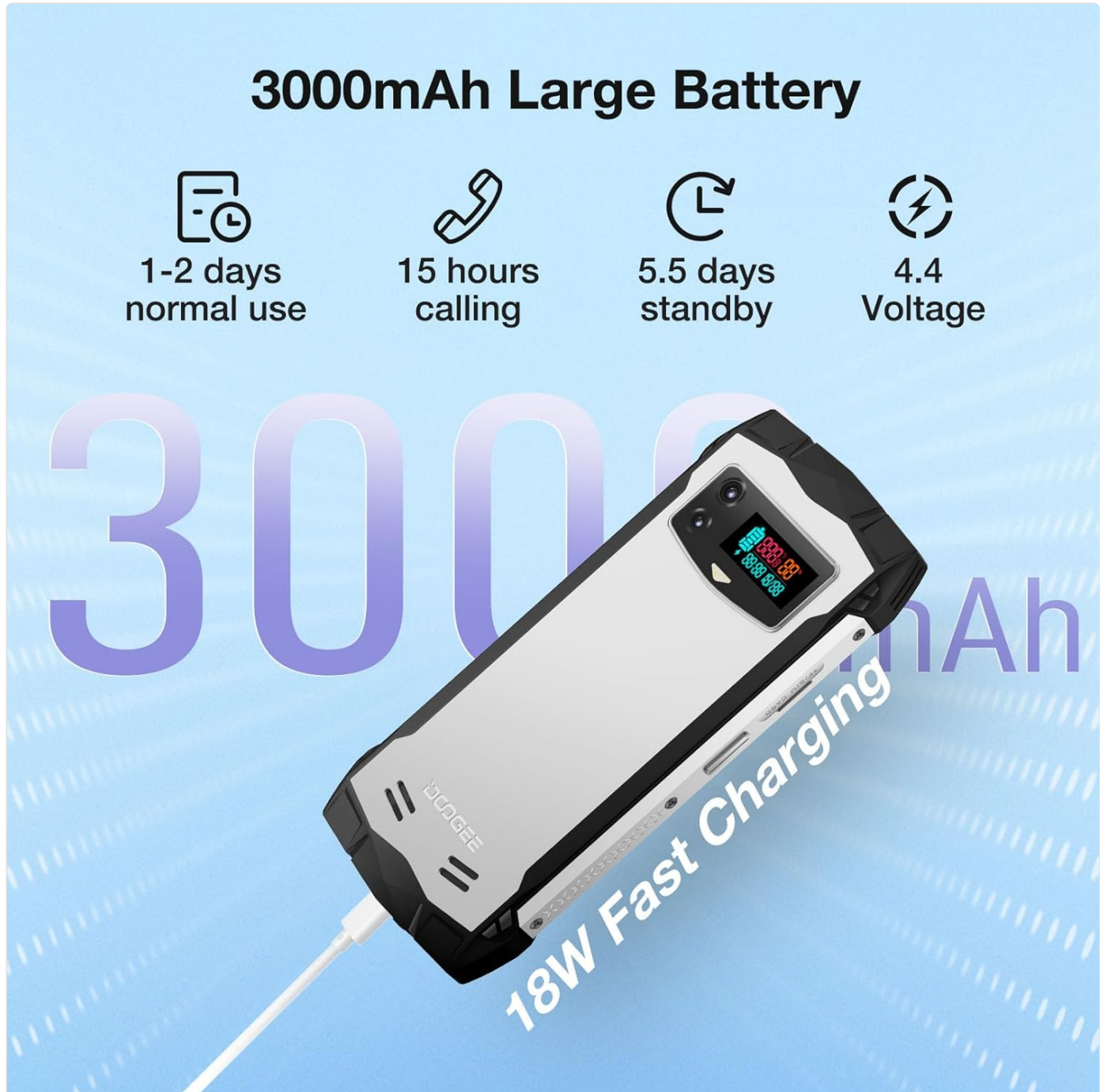
Image: The DOOGEE Smini connected to its charger, illustrating the 18W fast charging capability and the 3000mAh battery. Icons indicate 1-2 days normal use, 15 hours calling, and 5.5 days standby.

Before first use, fully charge the device battery.