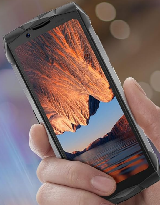
Image: Front and back view of the DOOGEE Smini, illustrating its compact size, innovative rear display, and main camera module. Key features like Android 13, 15GB RAM + 256GB ROM, NFC, and 4.5" QHD+ IPS Display are highlighted.