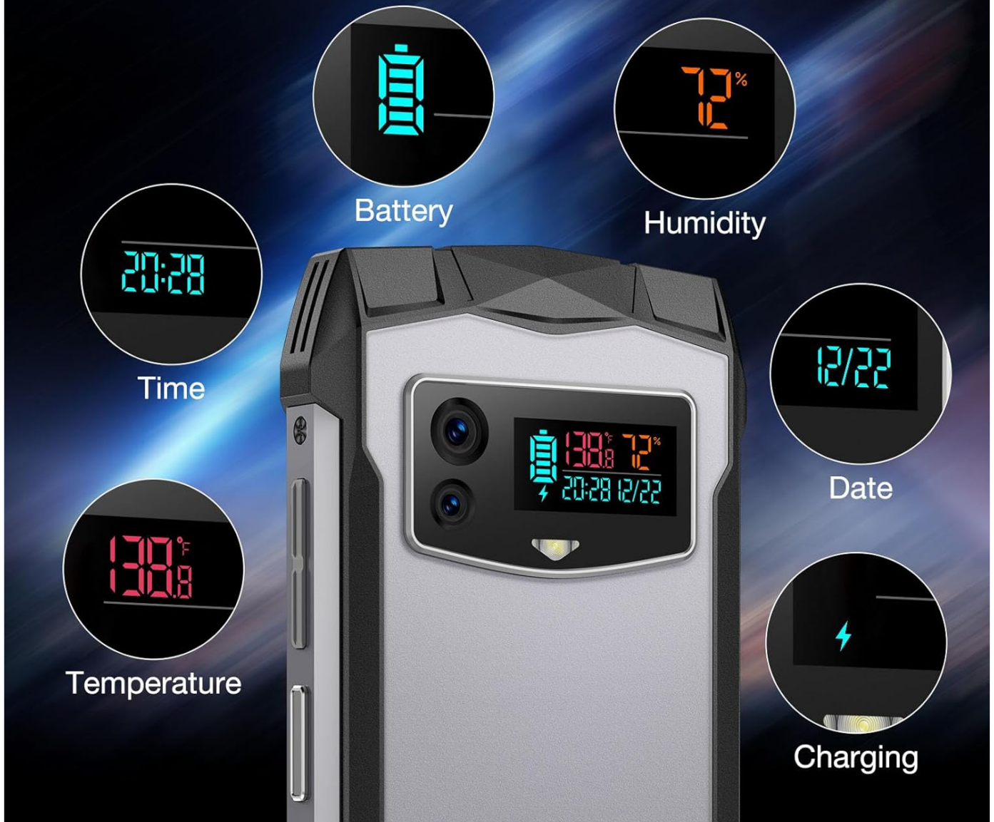
Image: A close-up of the DOOGEE Smini's innovative rear display, showcasing its ability to show battery level, humidity, current time, date, temperature, and charging status. The display can be customized.