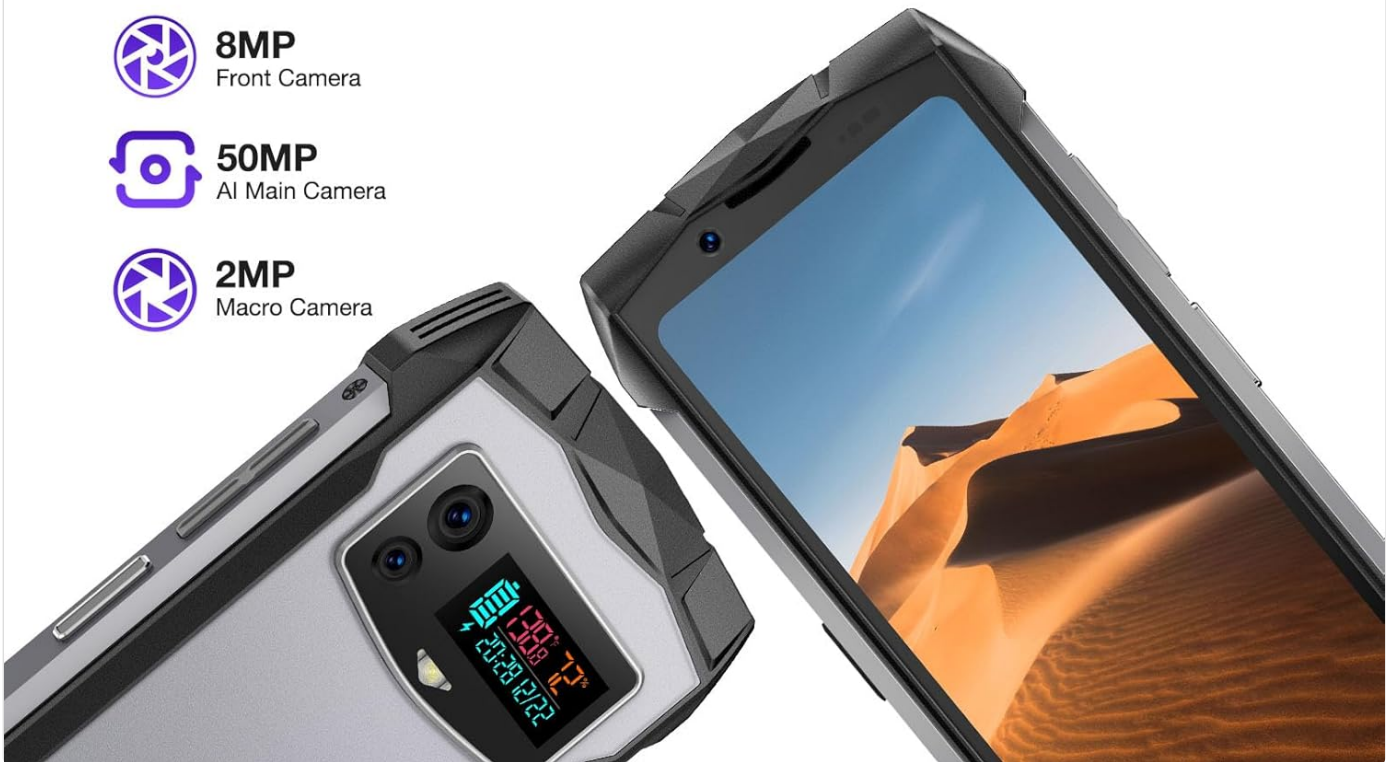
Image: The DOOGEE Smini's camera capabilities, highlighting the 50MP AI Main Camera, 8MP Front Camera, and 2MP Macro Camera. Example photos show diverse scenarios like underwater photography, mountain climbing, and hiking.