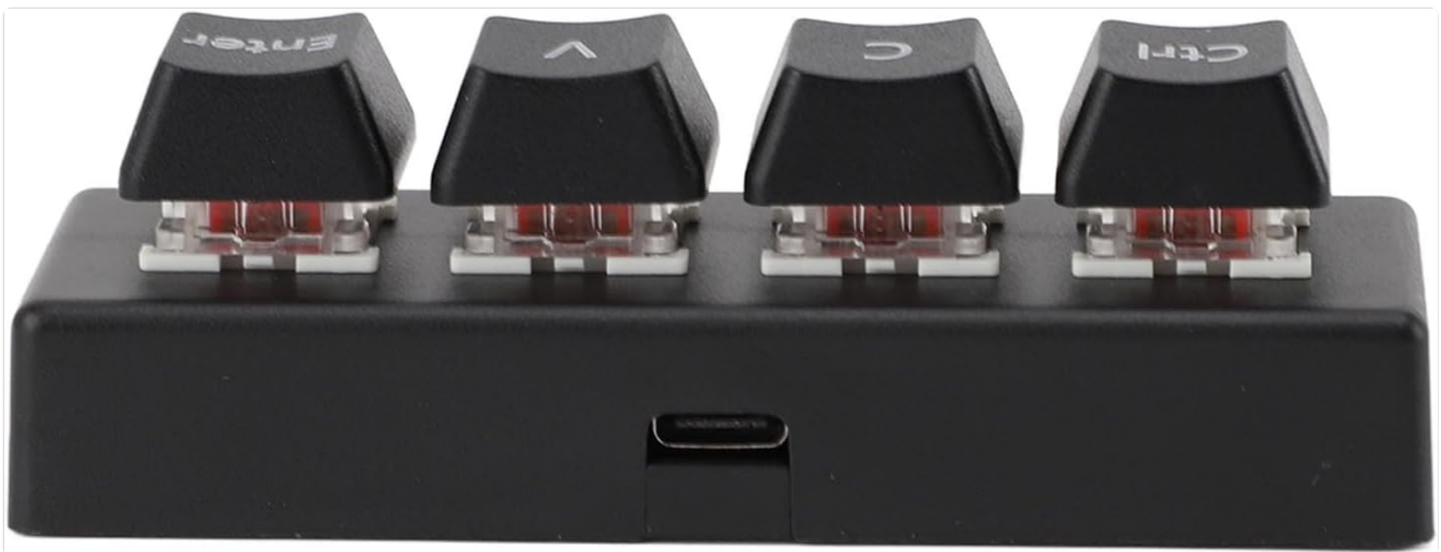
Image 4.1: Rear view of the keypad, highlighting the USB-C connection port for easy setup.