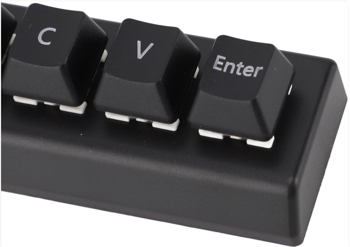
Image 5.2: A close-up of the keypad's keys, revealing the red mechanical switches underneath, which provide tactile feedback and durability.