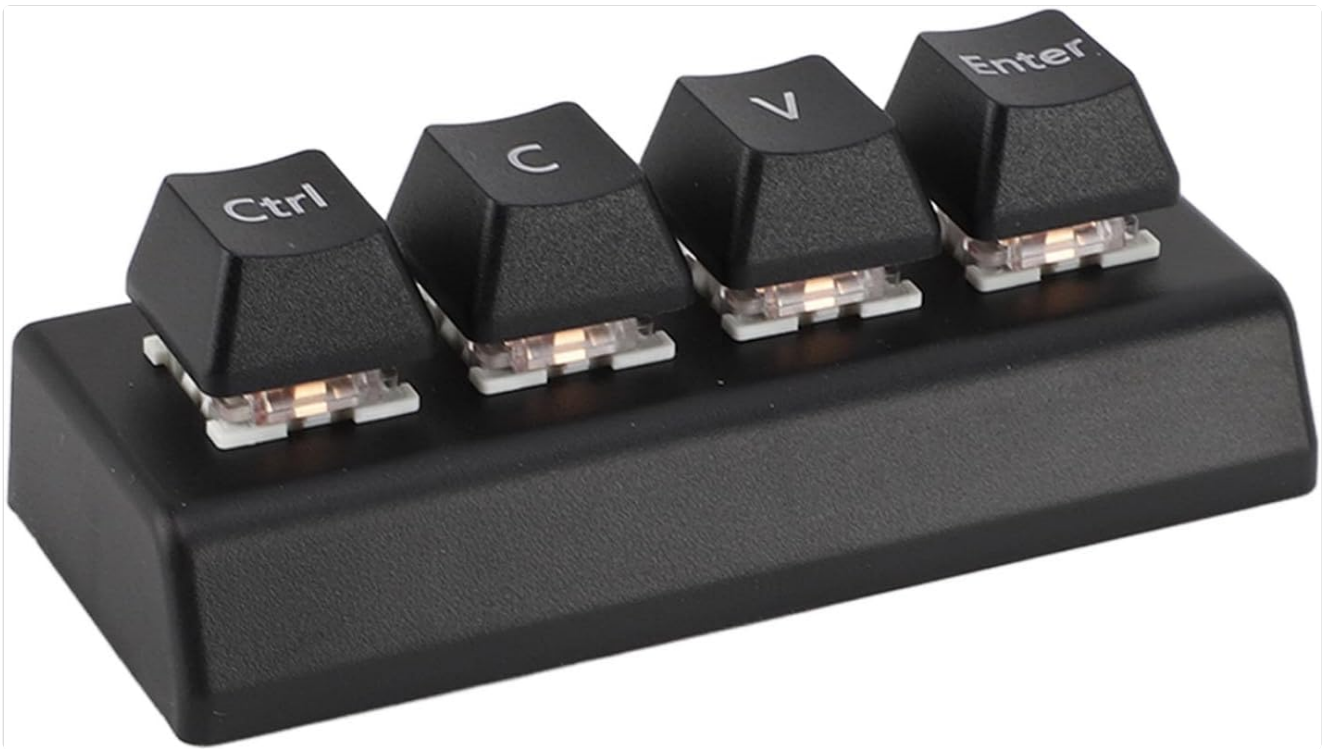
Image 1.1: The VBESTLIFE Mini 4 Keys Macro Keypad, showcasing its compact design and the four labeled keys: Ctrl, C, V, and Enter.