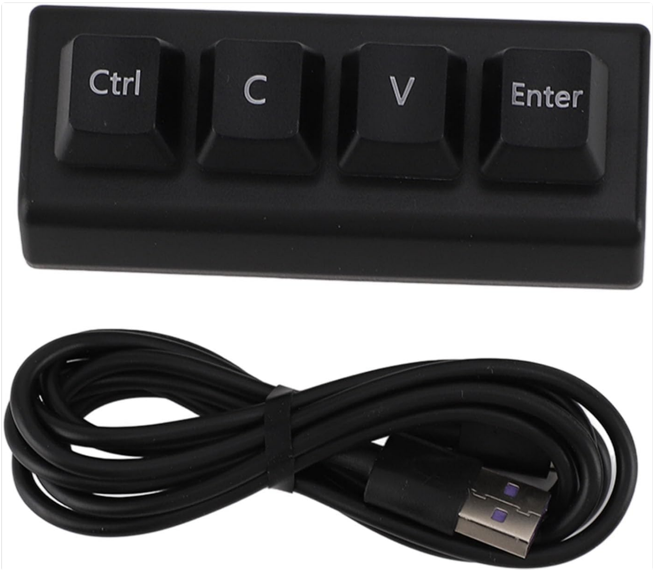
Image 2.1: The keypad and its accompanying USB cable, as found in the product package.