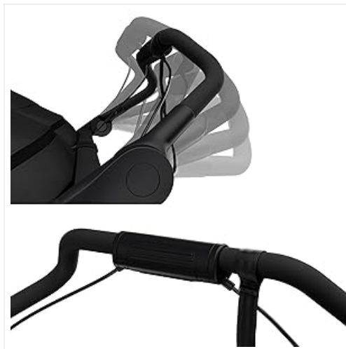
Figure 4.1: Adjusting the ergonomic handlebar for user comfort.