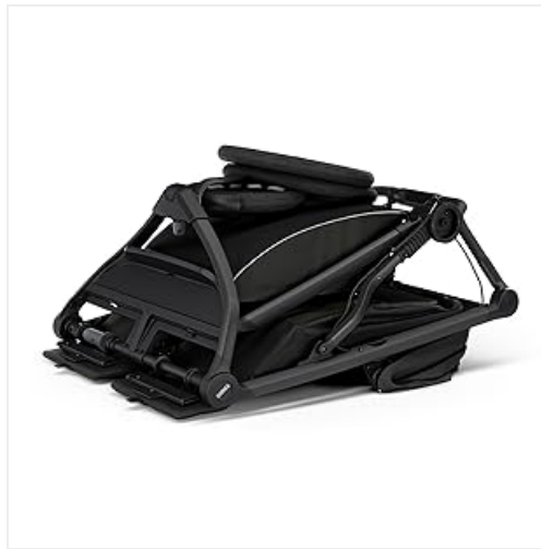
Figure 5.1: The stroller in its compact, folded position.