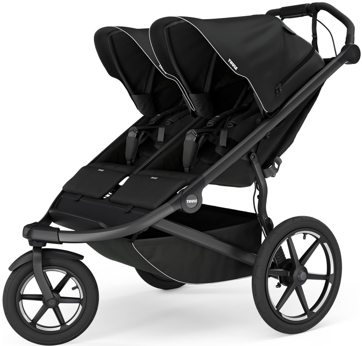
Figure 3.1: Front view of the Thule Urban Glide 3 Double Stroller.