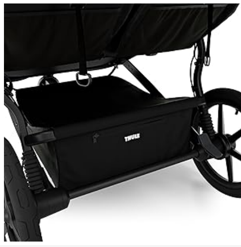
Figure 3.2: Close-up view of the large, water-resistant storage basket with zippered lid.