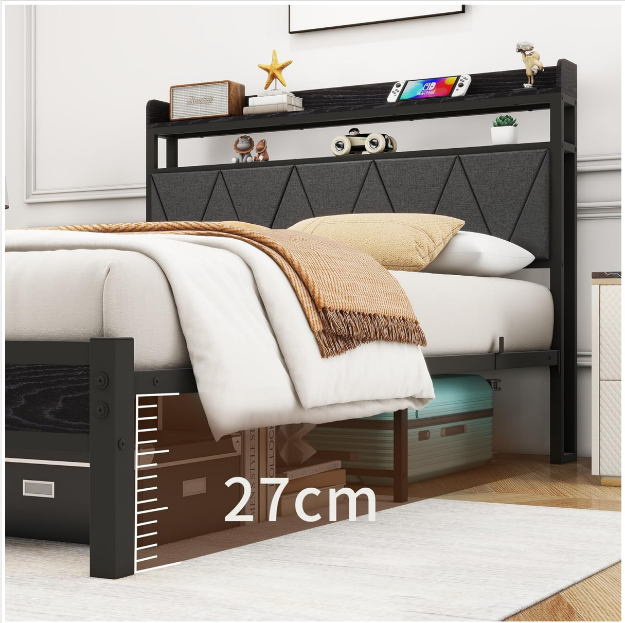
Image: Illustration showing the 27cm under-bed clearance, suitable for storage or robot vacuum access.