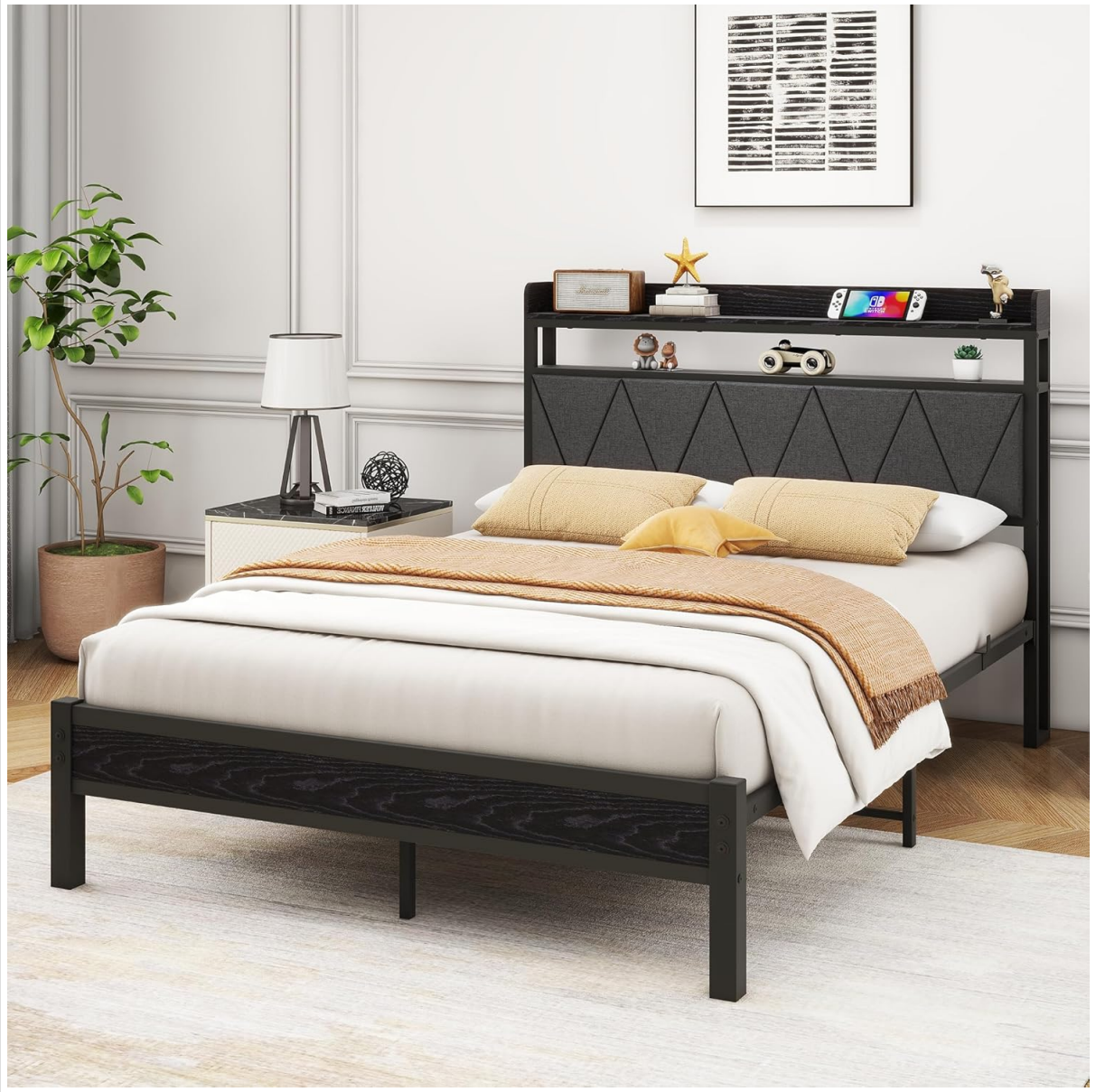
Image: Detailed view of the headboard's two-tier storage shelves, displaying various small items and the upholstered backrest.