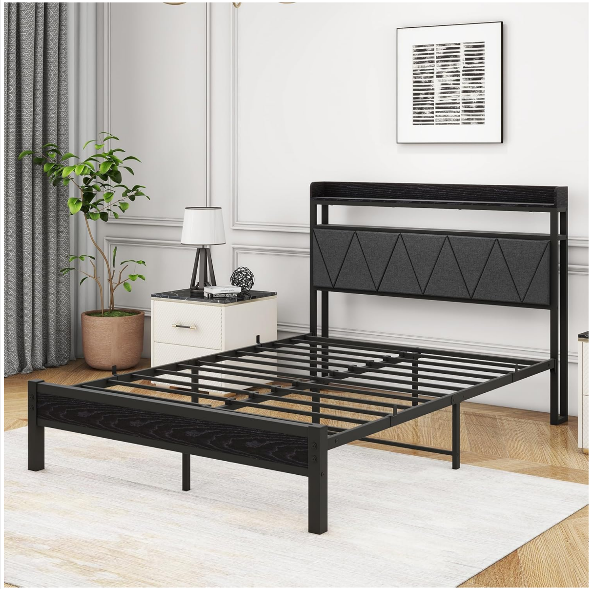
Image: A diagram illustrating the integrated design of the bed frame components, highlighting how they connect for easy assembly.