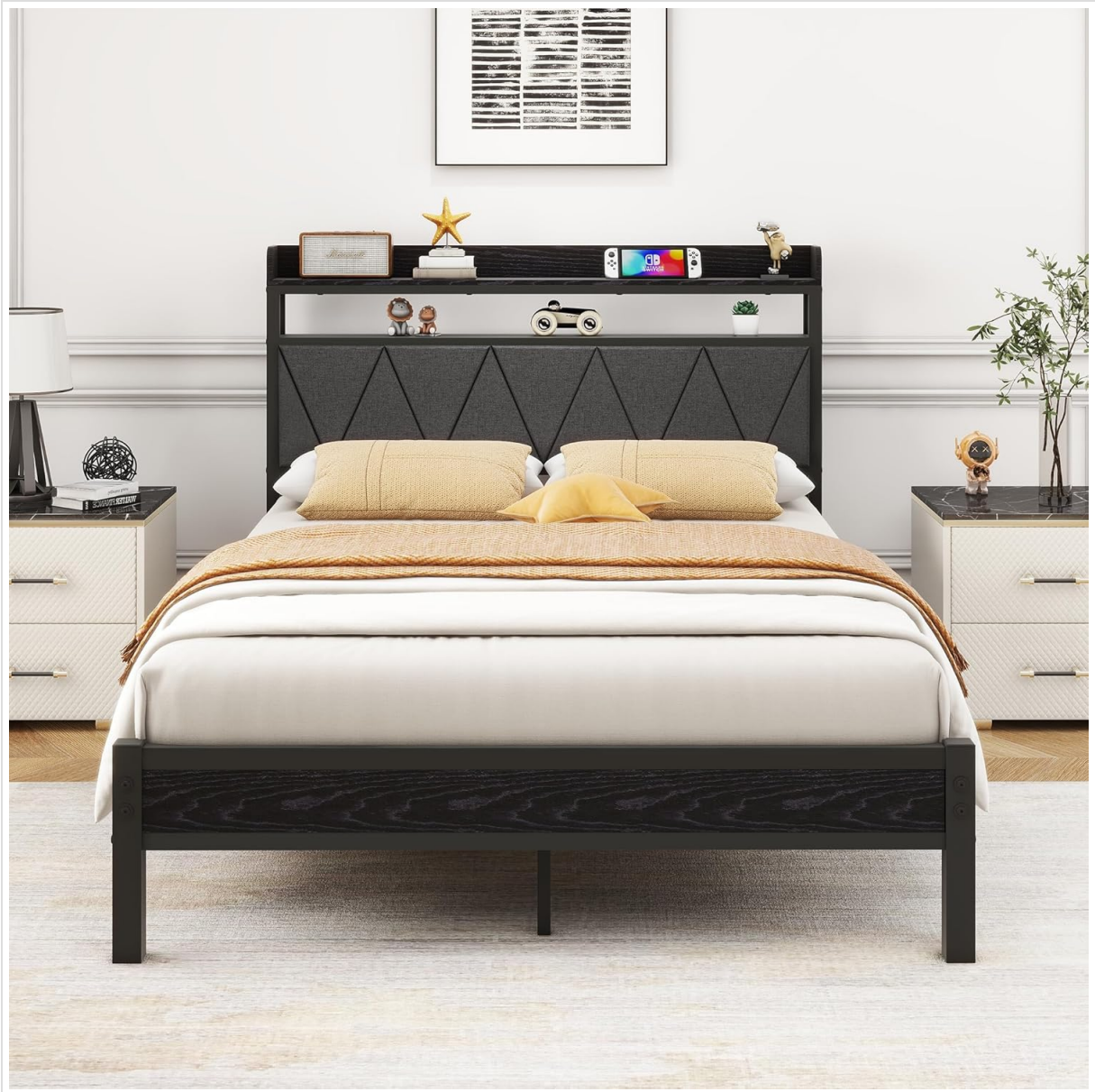
Image: Front view of the assembled VERFARM Full Size Bed Frame, showcasing the upholstered headboard with storage shelves and a mattress.