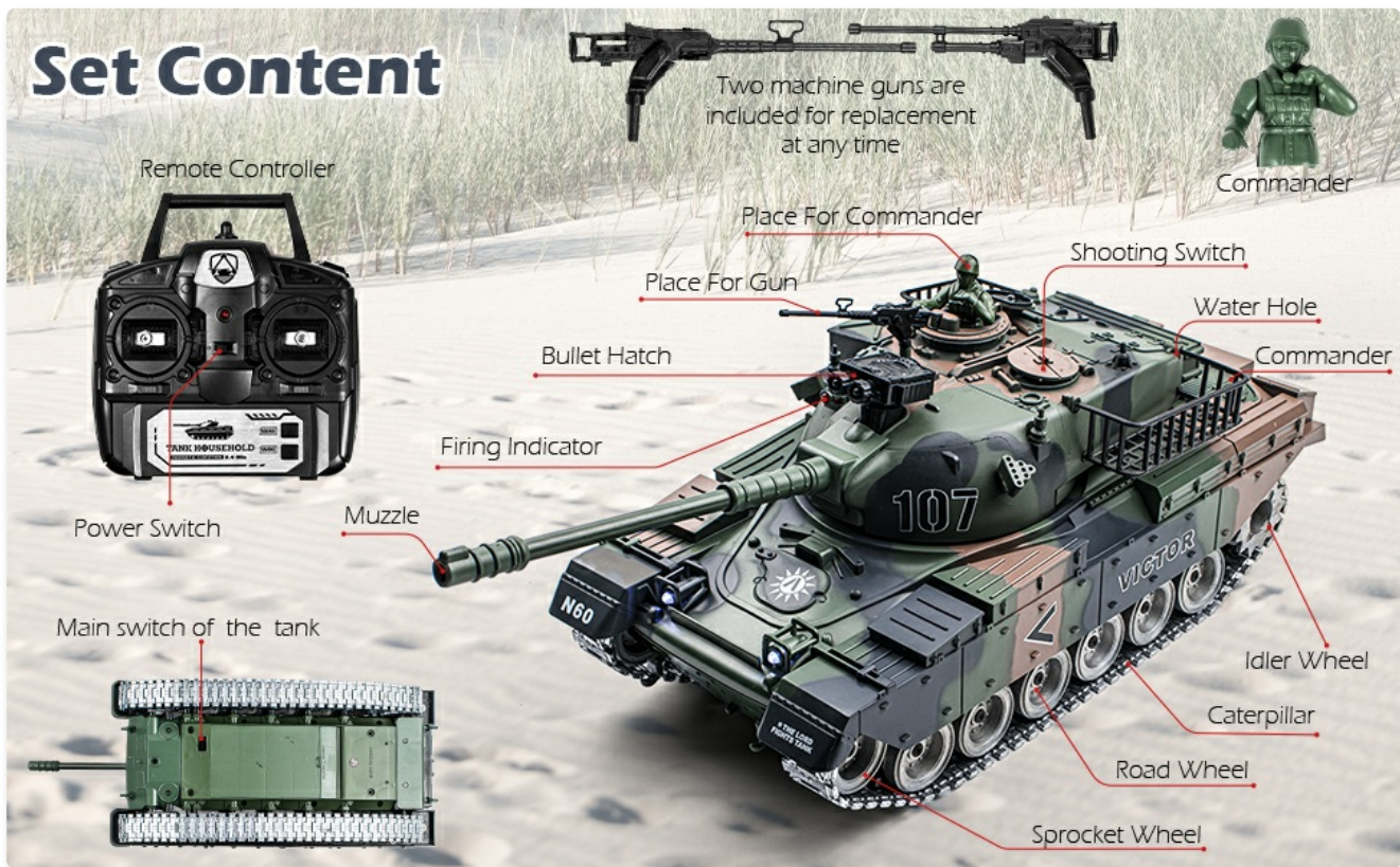
Image: Instructions for loading airsoft BBs into the tank's bullet hatch.