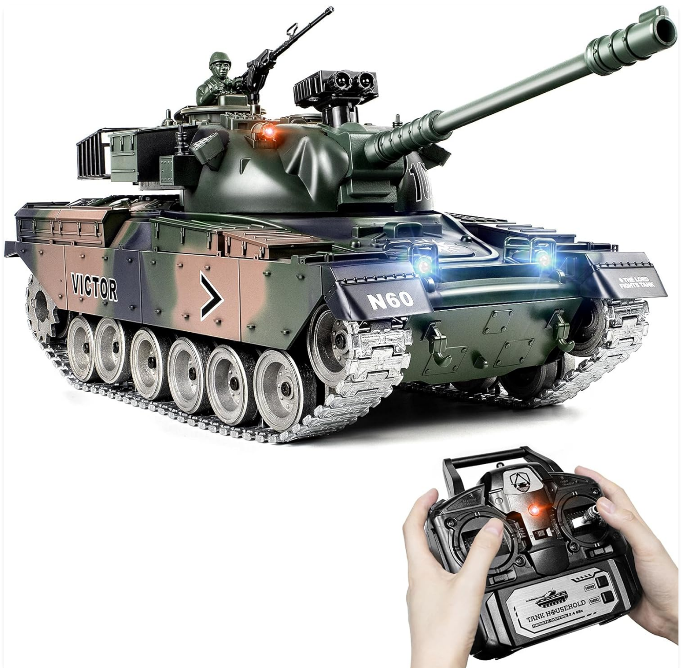
Image: The Supdex 1:18 Alloy Metal US M60 RC Tank and its remote control.