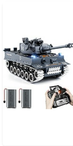
Image: Detailed diagram of the tank and remote control components.

Familiarize yourself with the main components of your RC tank and remote control.