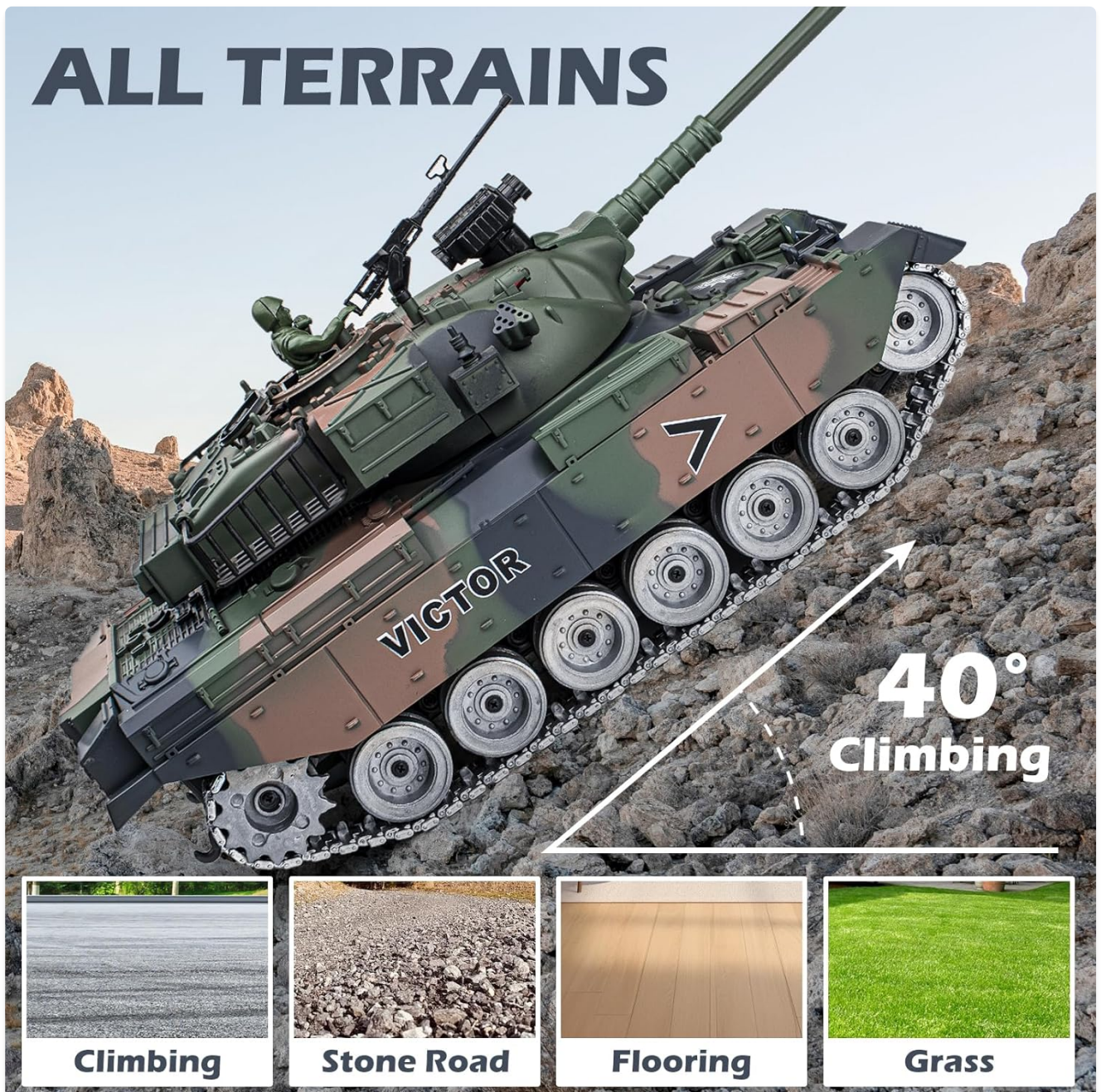
Image: The RC tank demonstrating its ability to traverse various terrains and climb inclines.

The Supdex M60 RC Tank is equipped with independent suspension and metal tracks, allowing it to conquer various terrains, including: