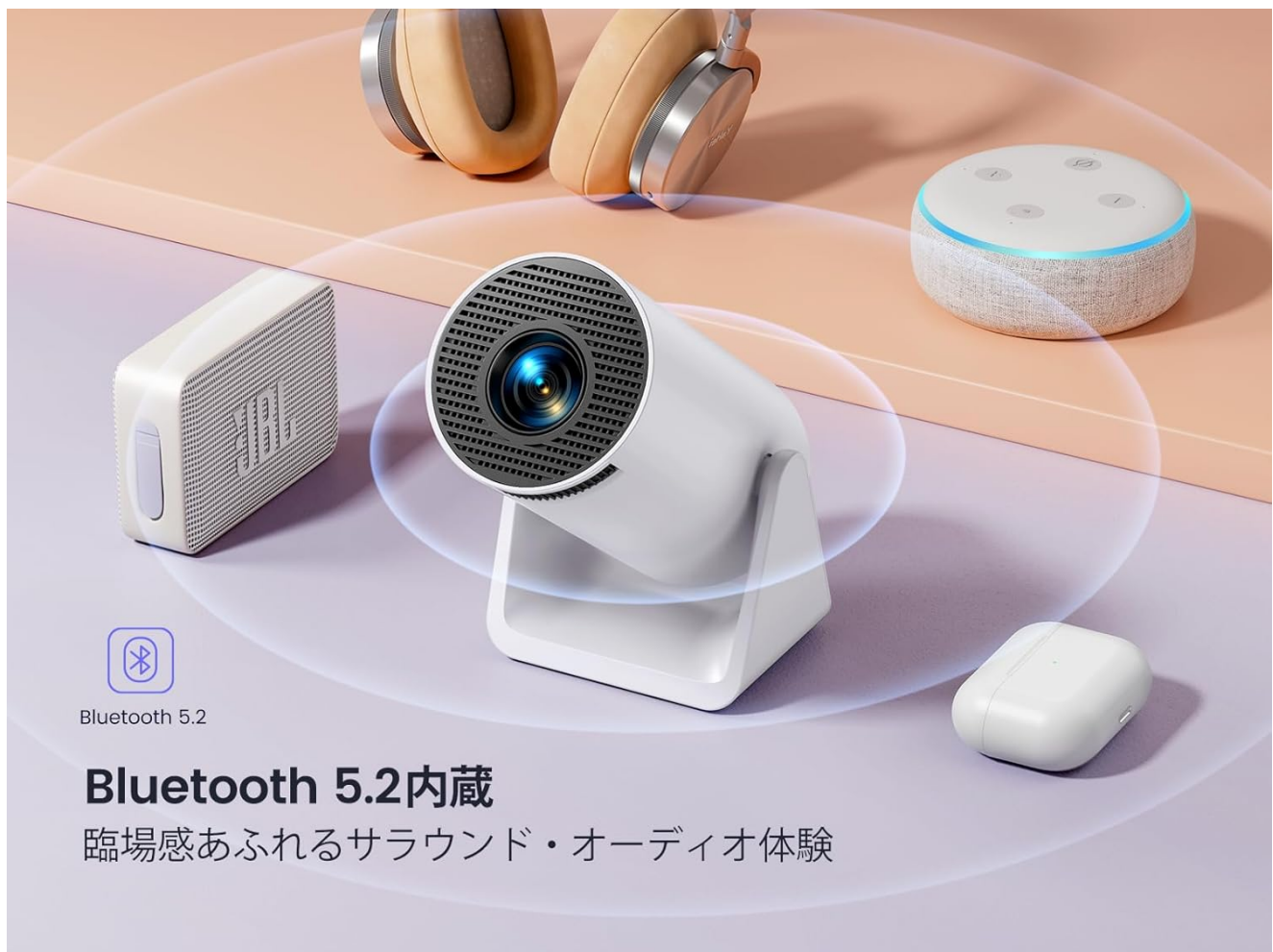
Image: The WiMiUS S27 Pro Projector connected wirelessly to headphones and a smart speaker via Bluetooth 5.2, illustrating its audio connectivity options.