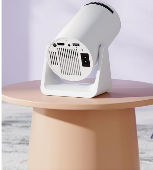
Image: Rear view of the WiMiUS S27 Pro Projector, highlighting the HDMI, USB, and Audio ports for connecting various devices.