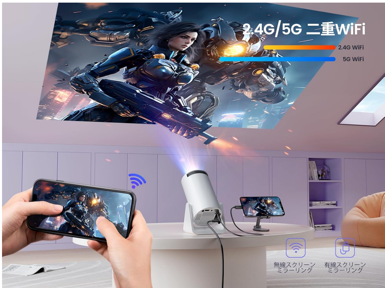
Image: A smartphone wirelessly mirroring its screen content to the WiMiUS S27 Pro Projector, demonstrating the seamless screen mirroring function.