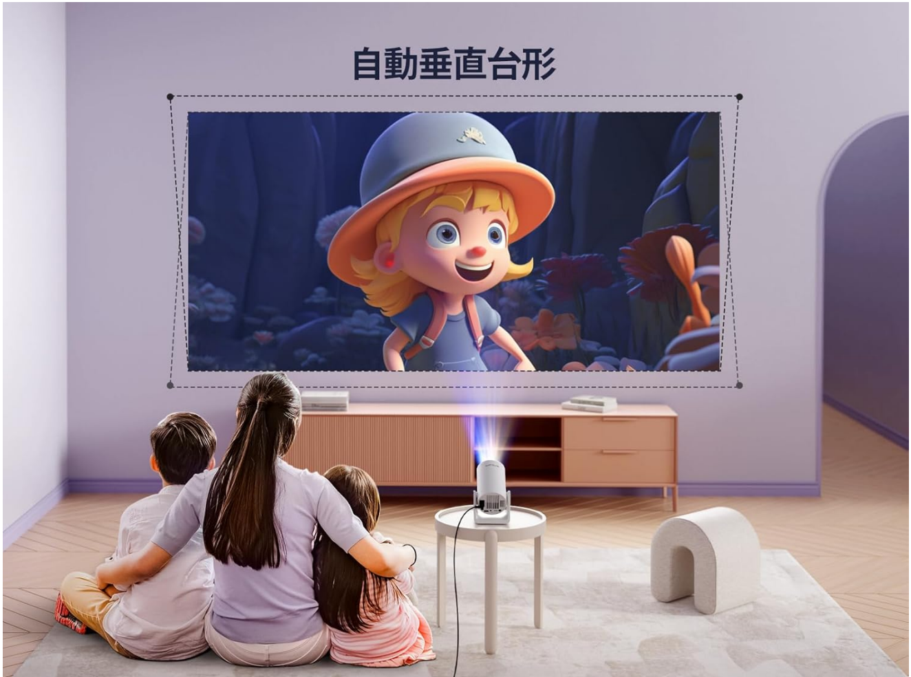
Image: The projector displaying an image on a wall, demonstrating its automatic vertical keystone correction feature for a perfectly rectangular picture.

The S27 Pro's 270° rotatable stand allows for flexible placement, including ceiling projection. Position the projector between 0.8 meters and 5 meters from the projection surface to achieve a screen size of 40 to 200 inches.