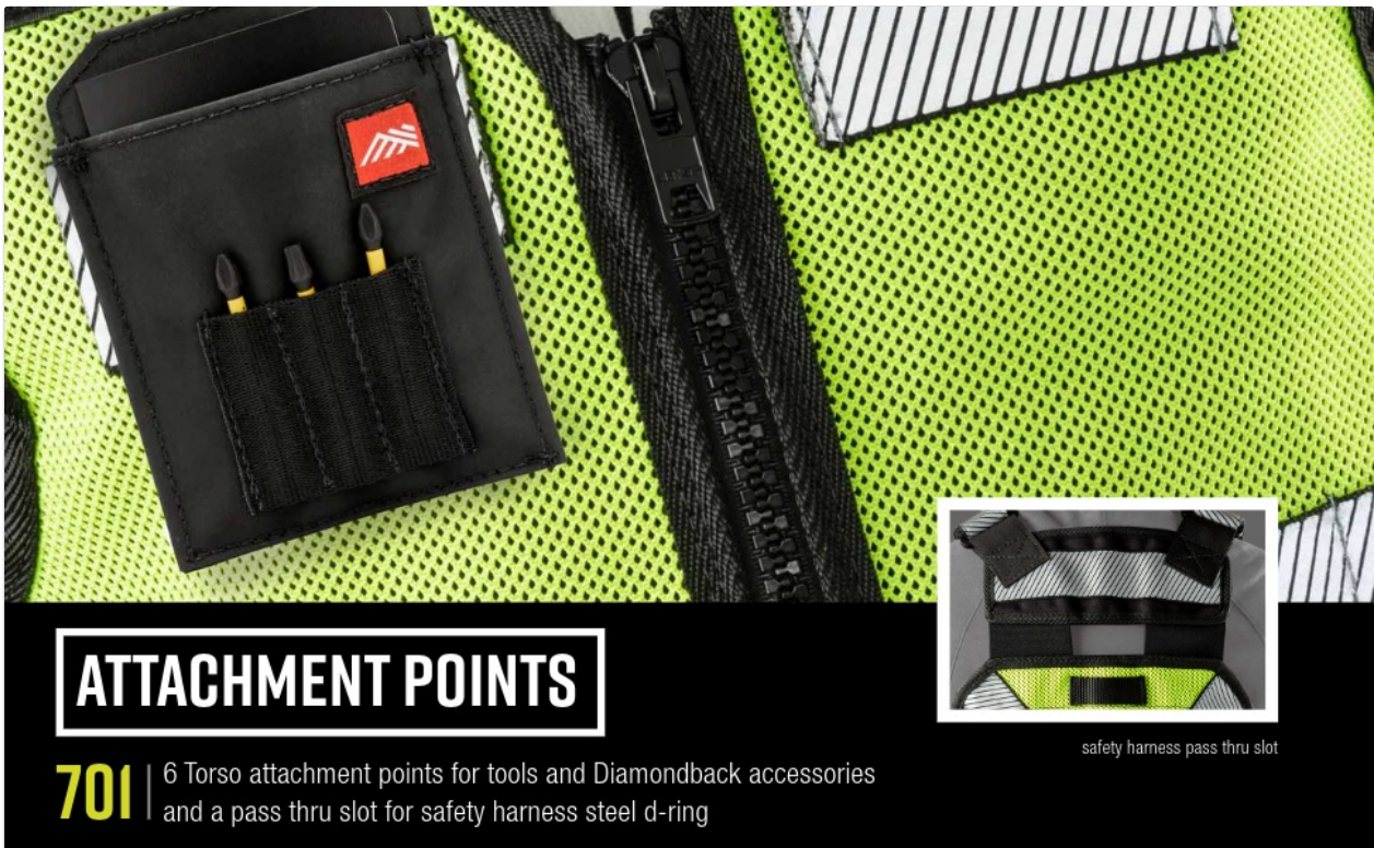
Image 3.1: Illustration of the 6 torso attachment points for tools and Diamondback accessories.