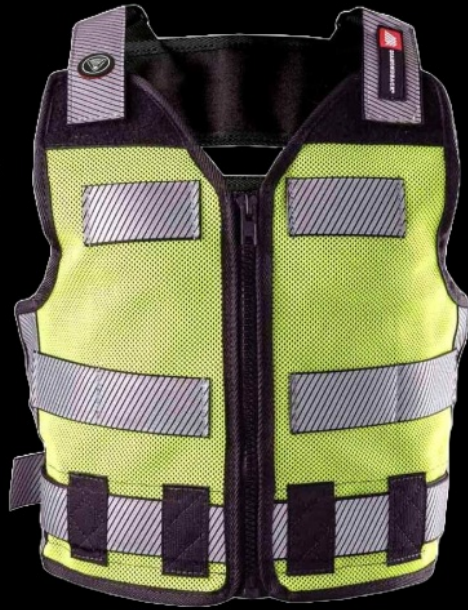
Image 1.1: The Diamondback Hi-Viz 701 Tool Vest, showcasing its high-visibility design.