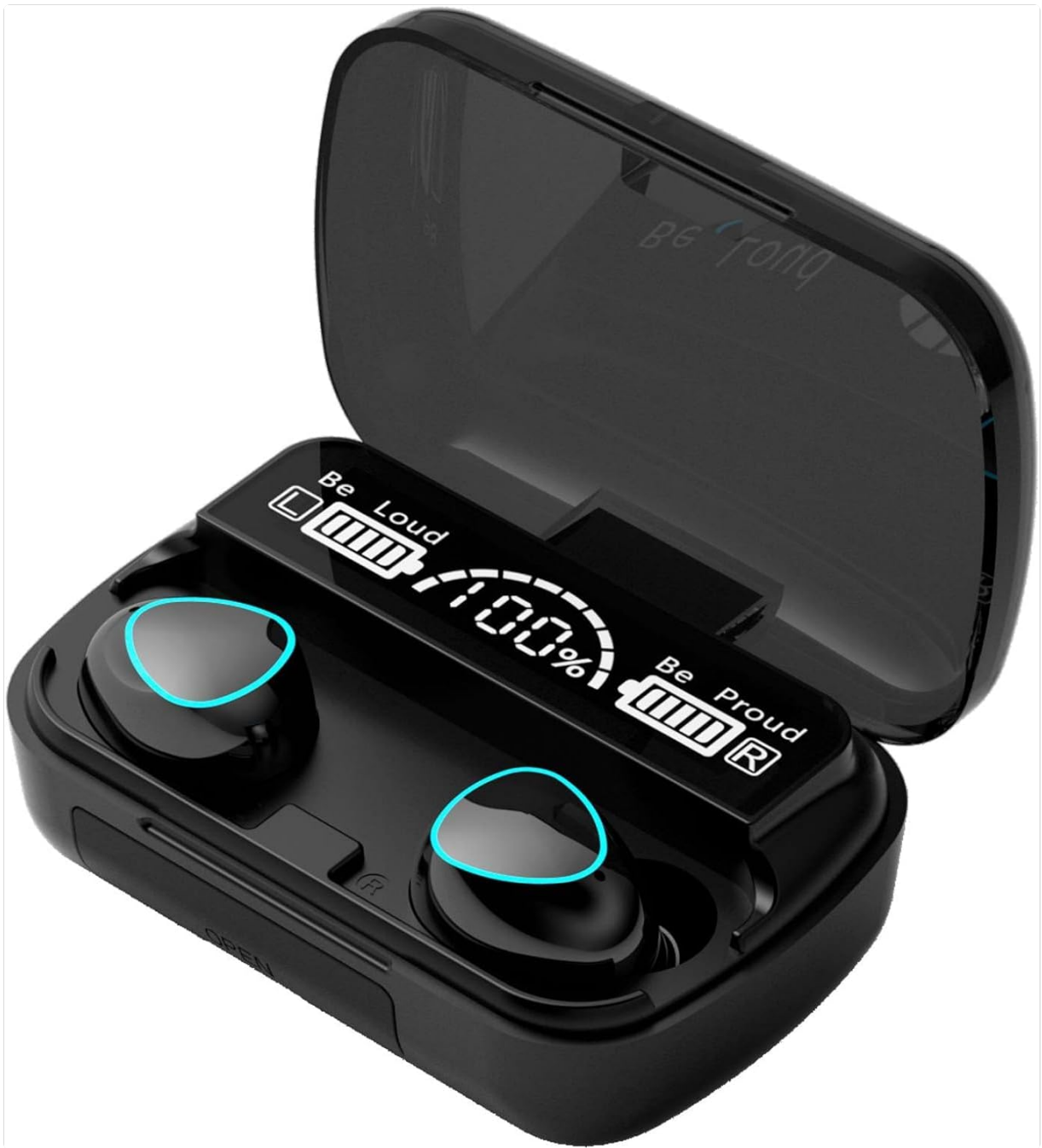
Image 3.1: M10 TWS Earbuds and Charging Case. The case features a digital display indicating battery levels for both earbuds and the case itself.