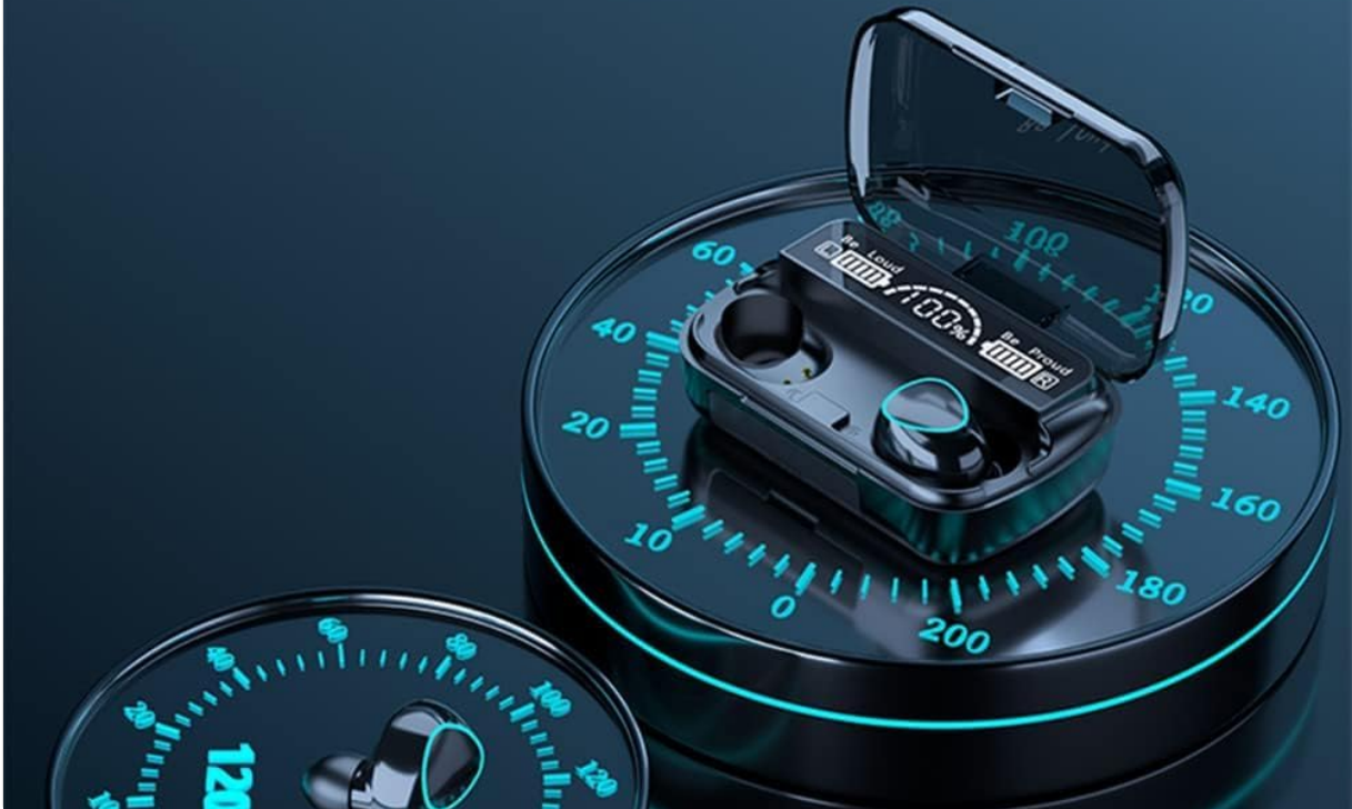
Image 4.2: The large capacity charging cabin ensures extended battery life for the earbuds and can serve as a backup power source.

Built-in large-capacity lithium battery, which can be charged immediately and fully charged, is suitable for a variety of scenarios, so that you can travel without worry