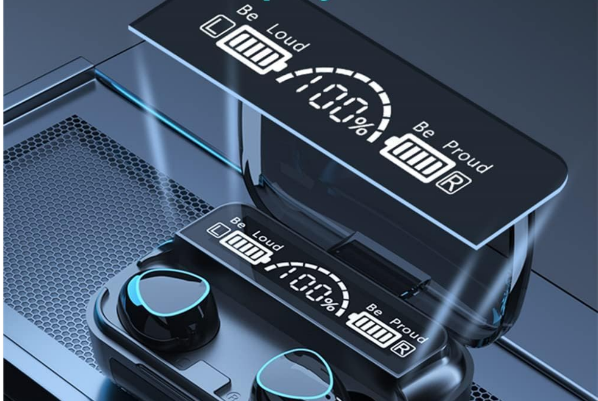
Image 3.3: Close-up of the HD LED display on the charging case, showing individual earbud battery indicators and the case's charge percentage.