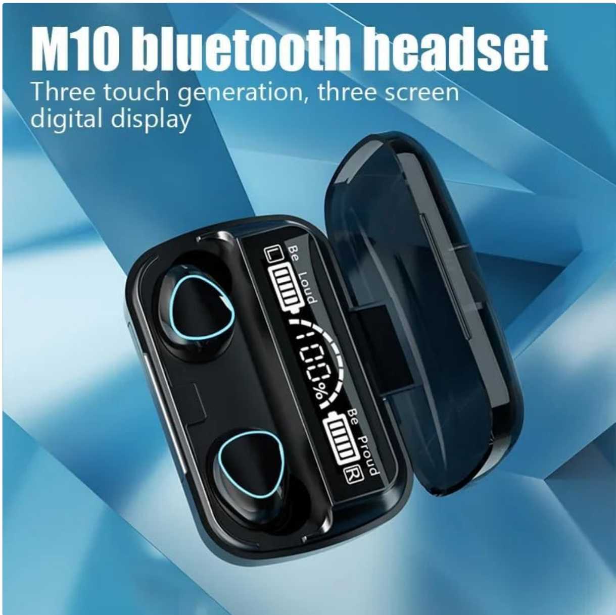
Image 3.2: M10 Bluetooth Headset highlighting the three-screen digital display for battery information.

Three touch generation, three screen digital display