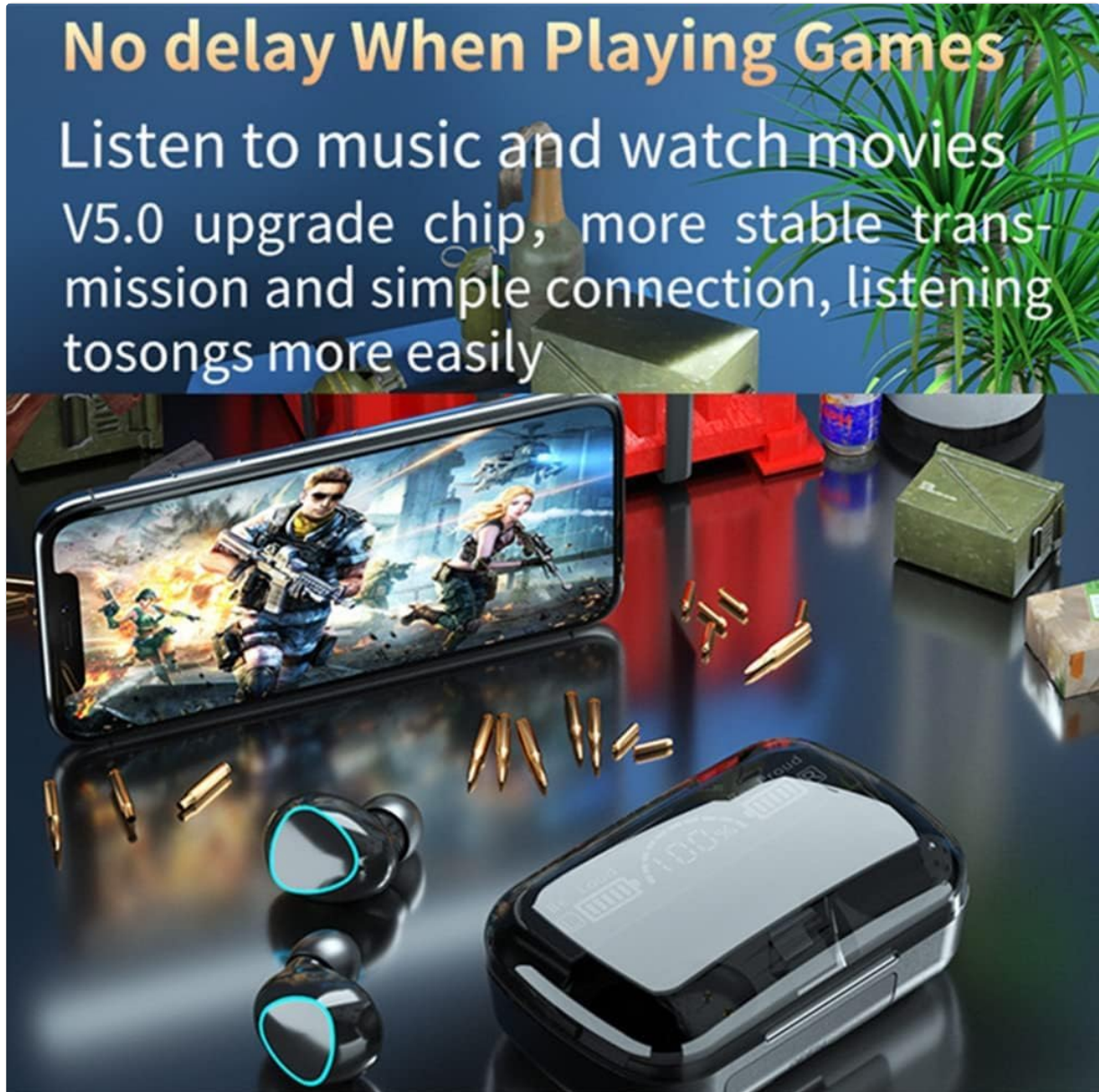
Image 5.1: The M10 earbuds are designed to provide a stable and low-latency audio experience for gaming and media consumption.

The earbuds feature an upgraded V5.0 chip for stable transmission, which can provide a low-latency experience suitable for gaming and video playback.