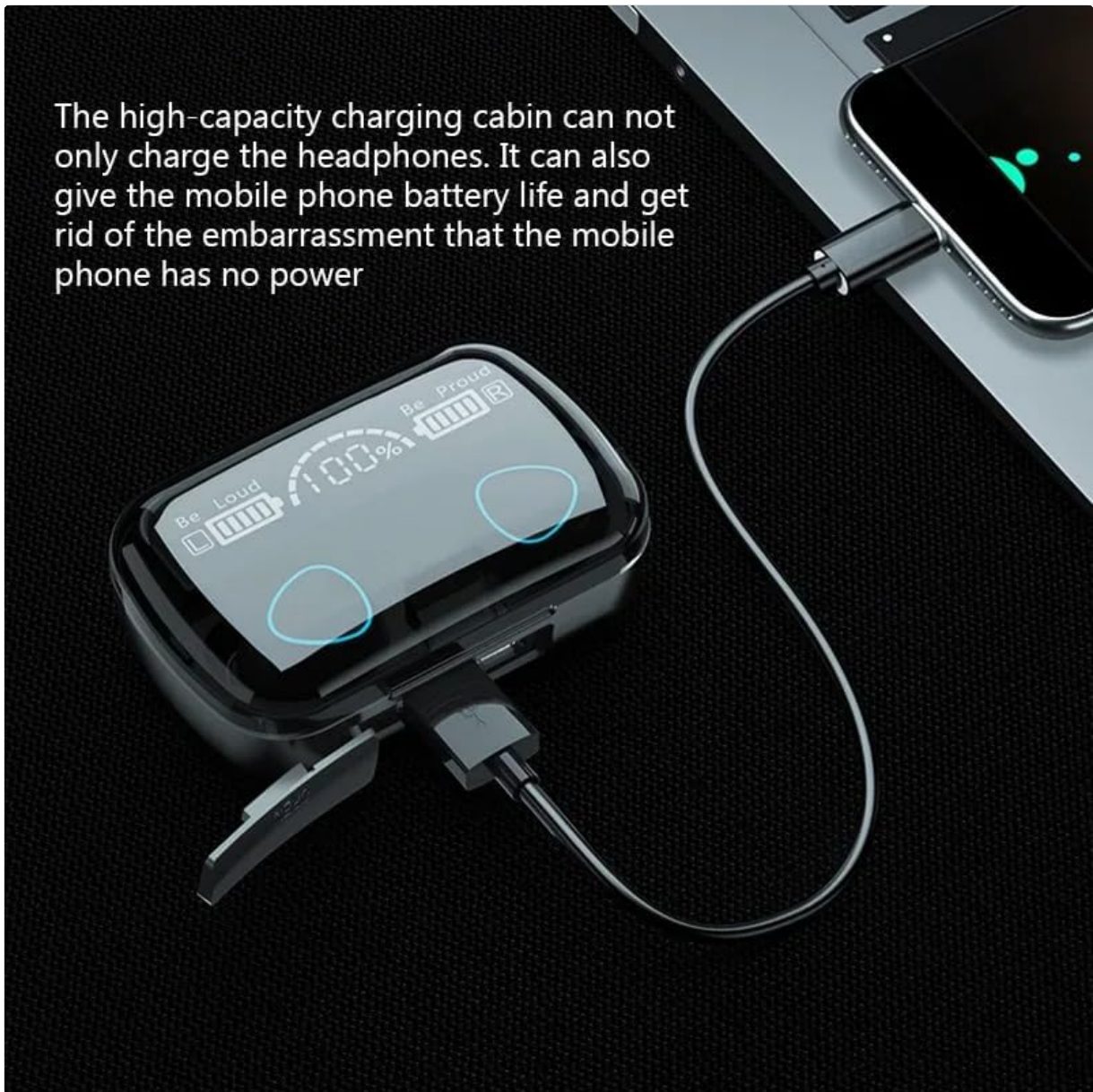
Image 4.1: The charging case can also be used to charge other devices, functioning as a portable power bank.

The high-capacity charging cabin can not only charge the headphones. It can also give the mobile phone battery life and get rid of the embarrassment that the mobile phone has no power