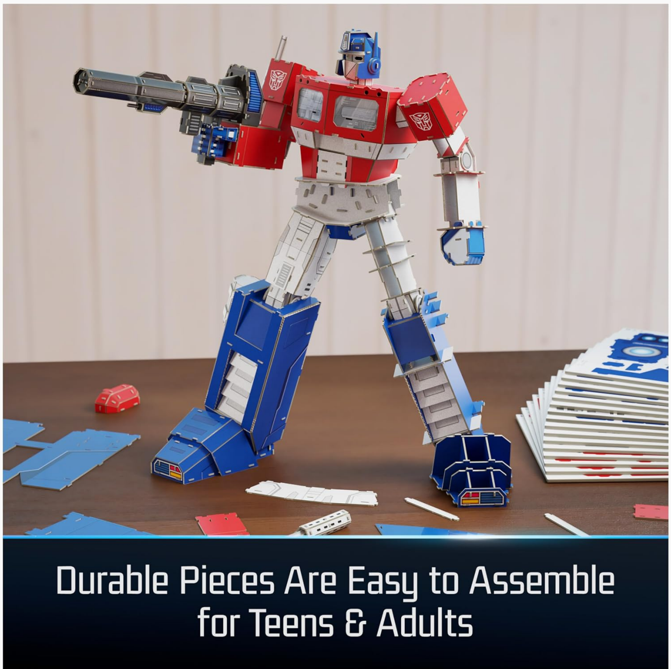
Figure 3: Assembly in progress, showing durable pieces.