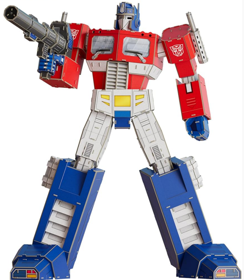
Figure 1: Assembled 4D Build Optimus Prime Model Kit with packaging.