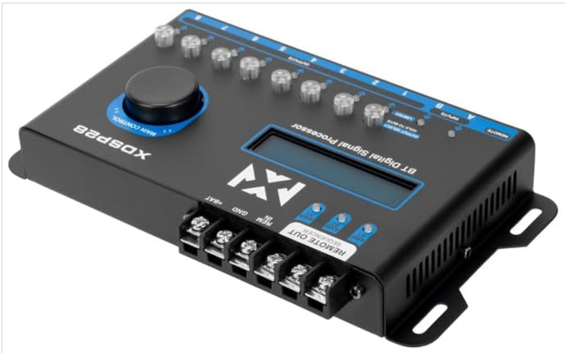
Figure 4.3: Rear view of the NVX XDSP28, highlighting the power and remote connections.