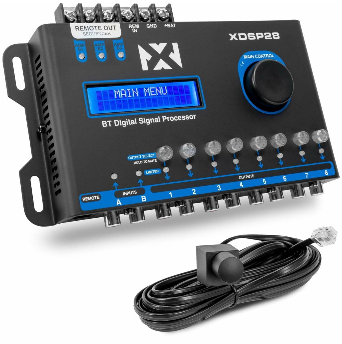
Figure 4.2: Top view of the NVX XDSP28 unit, showing the main control knob, LCD display, and input/output connections.