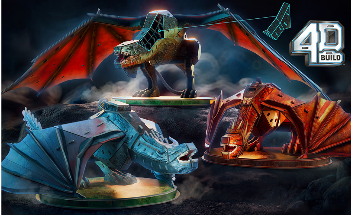
Image: Detailed dimensions for Vhagar, Seasmoke, and Meleys are provided for reference.