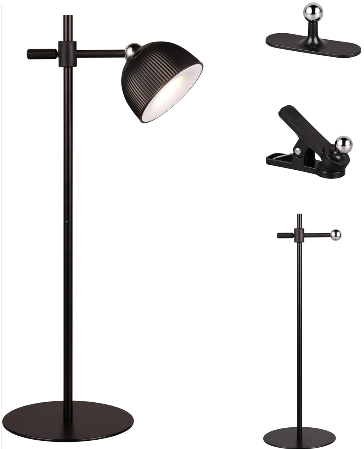
Image: The Maxima LED Lamp shown with its complete set of accessories, including the main lamp unit, the circular table stand, the flat wall mount, and the spring-loaded clamping device.