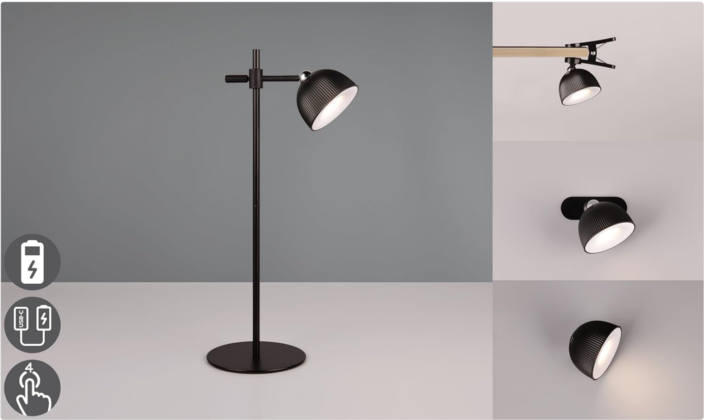
Image: The Maxima LED Lamp displayed alongside graphical icons representing its key features: battery power, USB-C charging capability, and touch-sensitive operation.