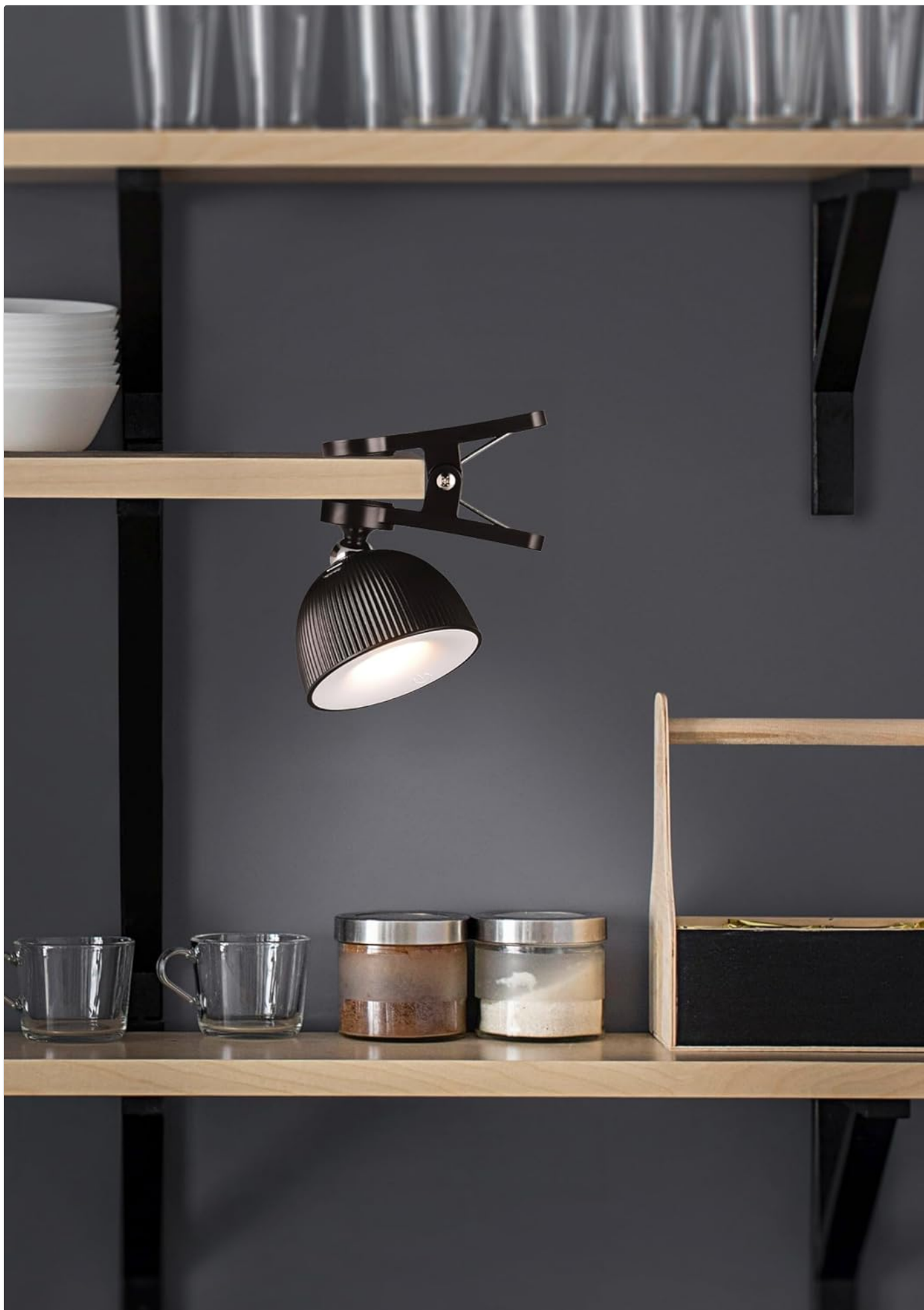
Image: The Maxima LED Lamp clamped onto a wooden shelf, demonstrating its use with the versatile clamping device.