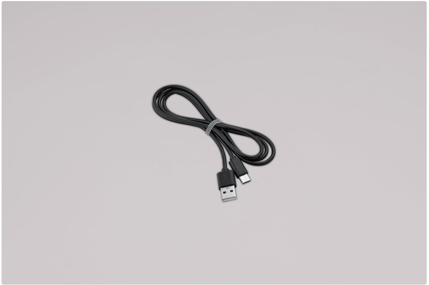
Image: The black USB-C charging cable included with the lamp, used for recharging the internal battery.

approximately 3 hours of light duration.