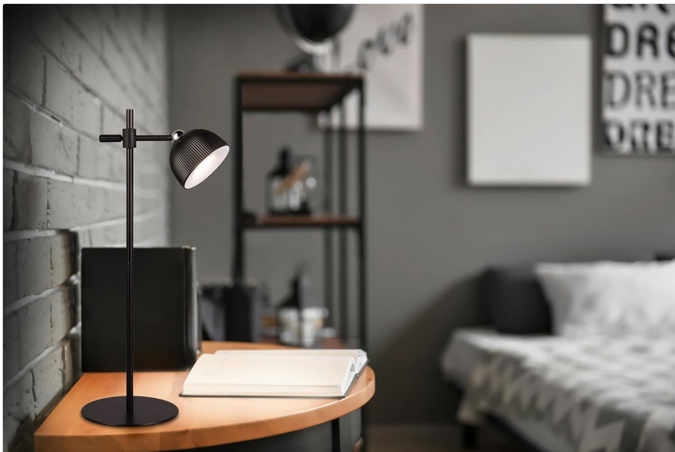
Image: The Maxima LED Lamp positioned on a wooden desk, utilizing its included table stand for stable placement.