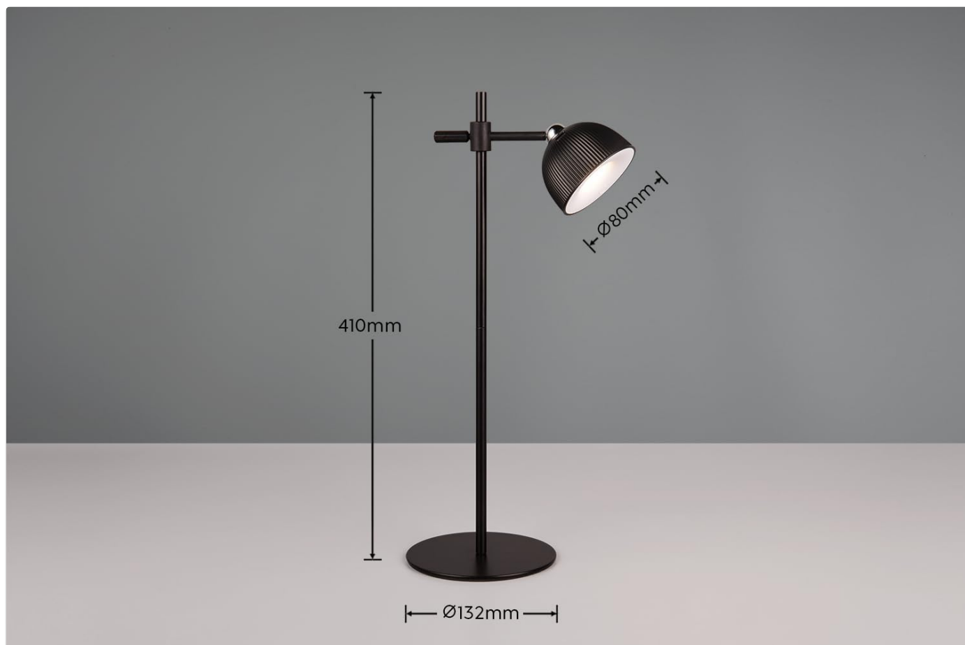
Image: A diagram illustrating the key dimensions of the Maxima LED Lamp when assembled with its table stand, showing height and base diameter.