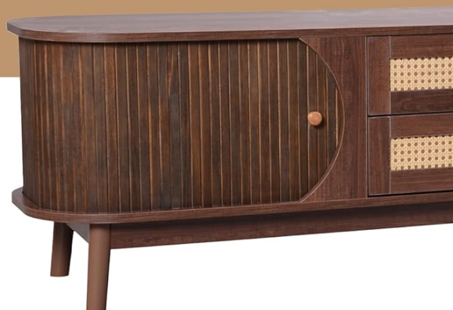
Image: Details of the TV stand's construction, including handles, rattan drawers, and solid wood elements.