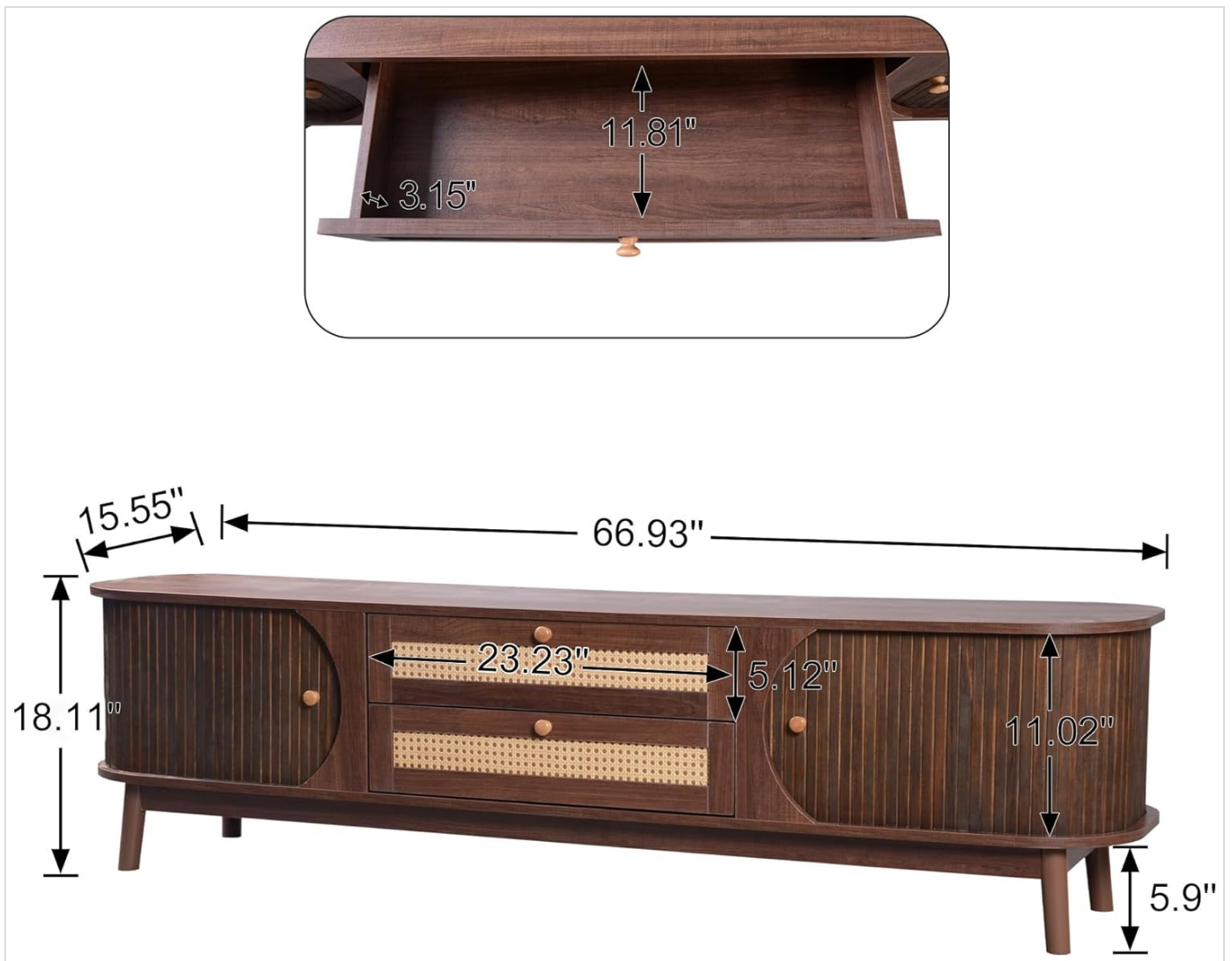
Image: Dimensional overview of the TV stand, including measurements for overall size and internal compartments.