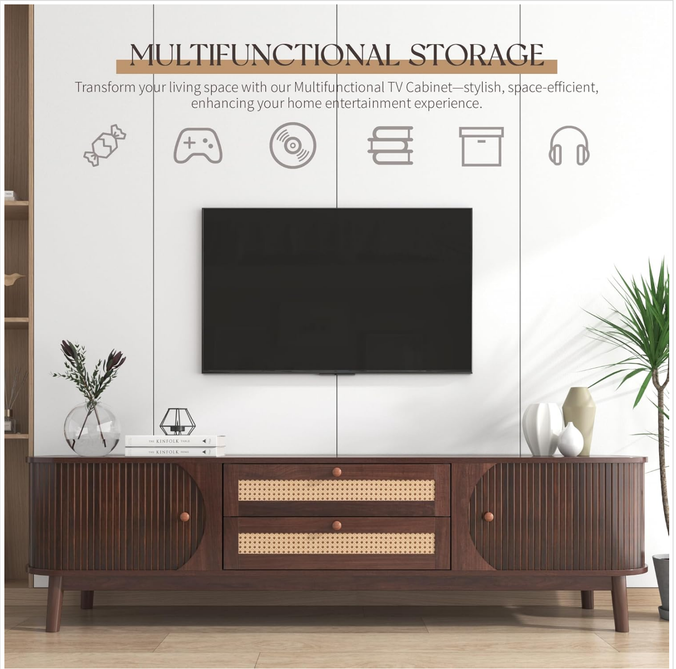
Image: The TV stand used for multifunctional storage, holding a TV, game console, records, and other items.