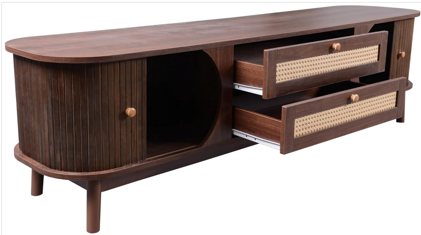
Image: View of the TV stand with drawers pulled out and sliding doors open, illustrating storage capacity.