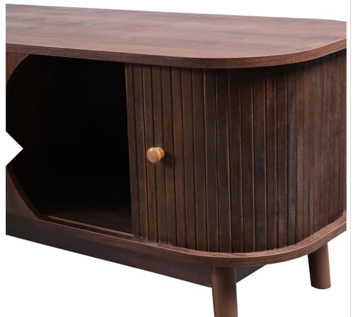
Image: Features of the TV stand, highlighting the smooth tabletop and sliding door functionality.

Conveniently retrieve items with easy-to-open sliding doors.