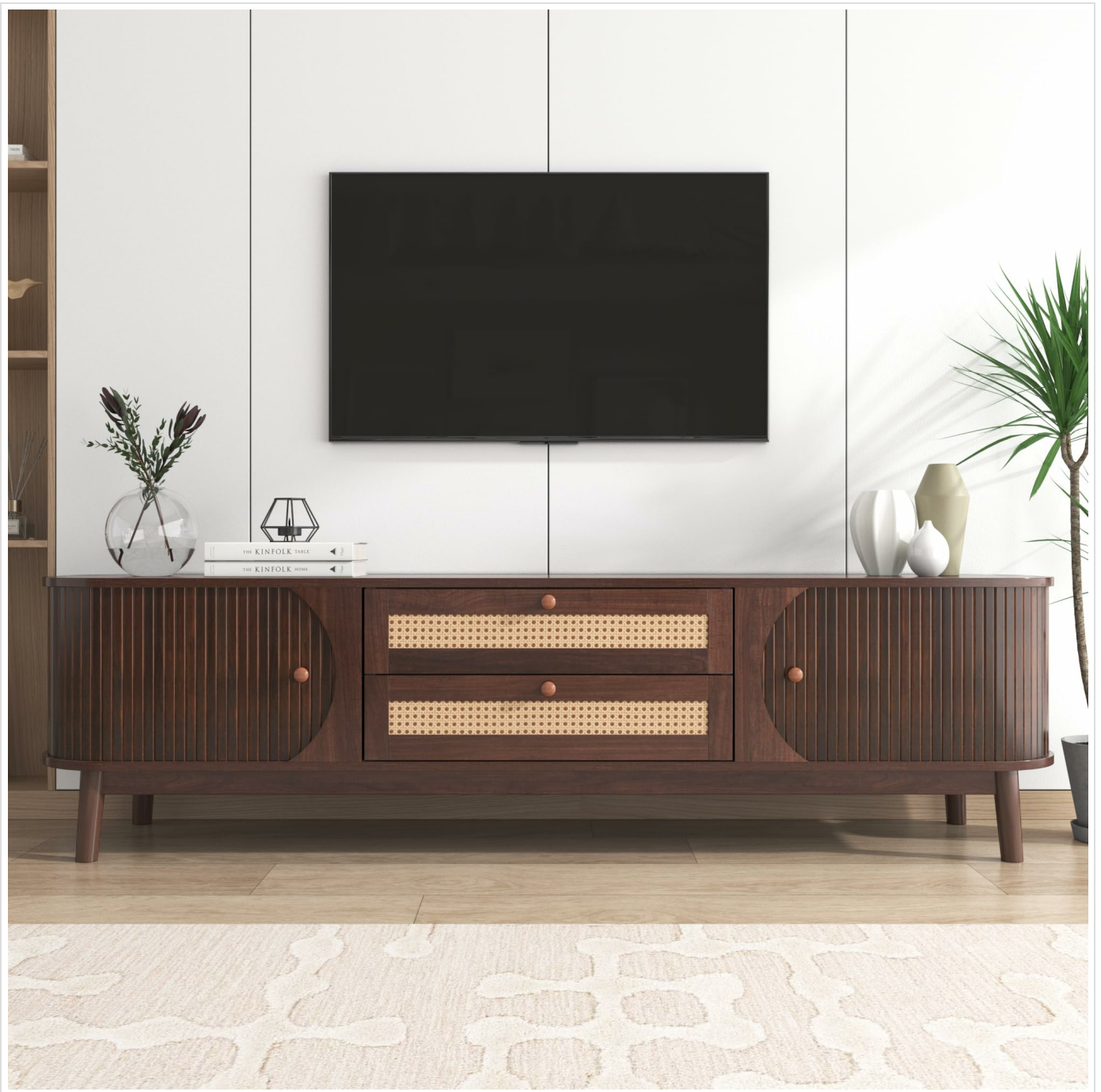
Image: The JIVOIT Rattan TV Stand in a living room, showcasing its design and capacity for a television.