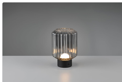
Figure 6: Lamp illuminated at low brightness.