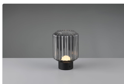
Figure 7: Lamp illuminated at medium brightness.