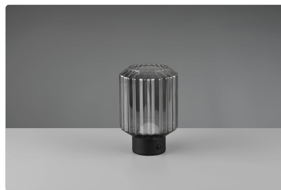
Figure 5: Lamp in the off state.