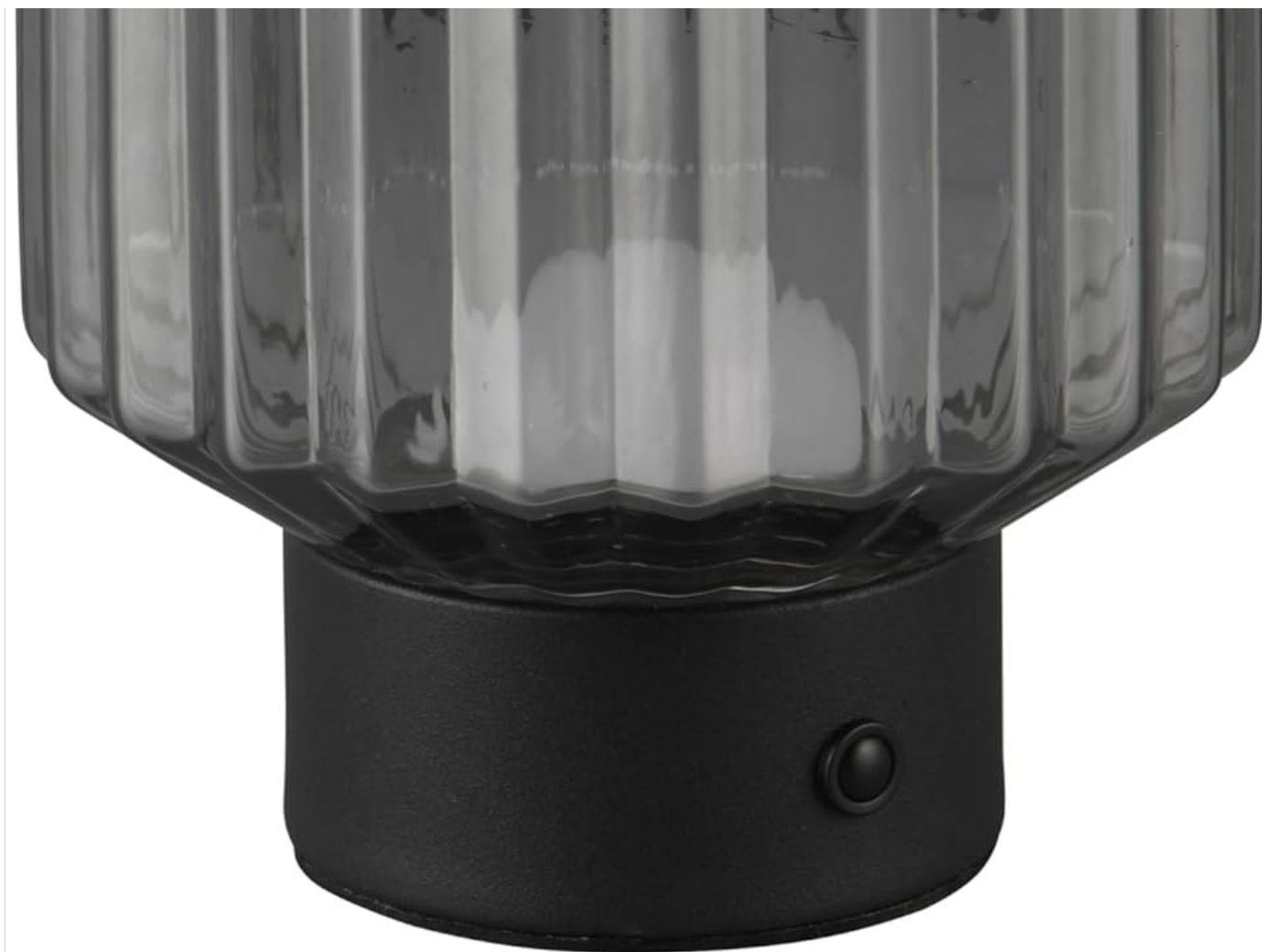
Figure 1: The Lord R57761154 Table Lamp, showcasing its matte black base and smoked glass shade.