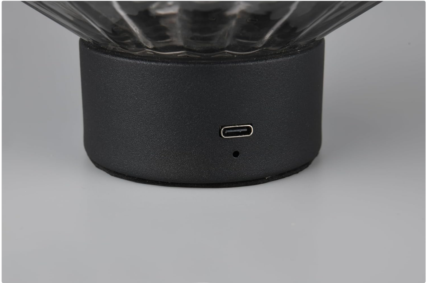
Figure 2: Detail of the USB-C charging port located on the lamp's base.