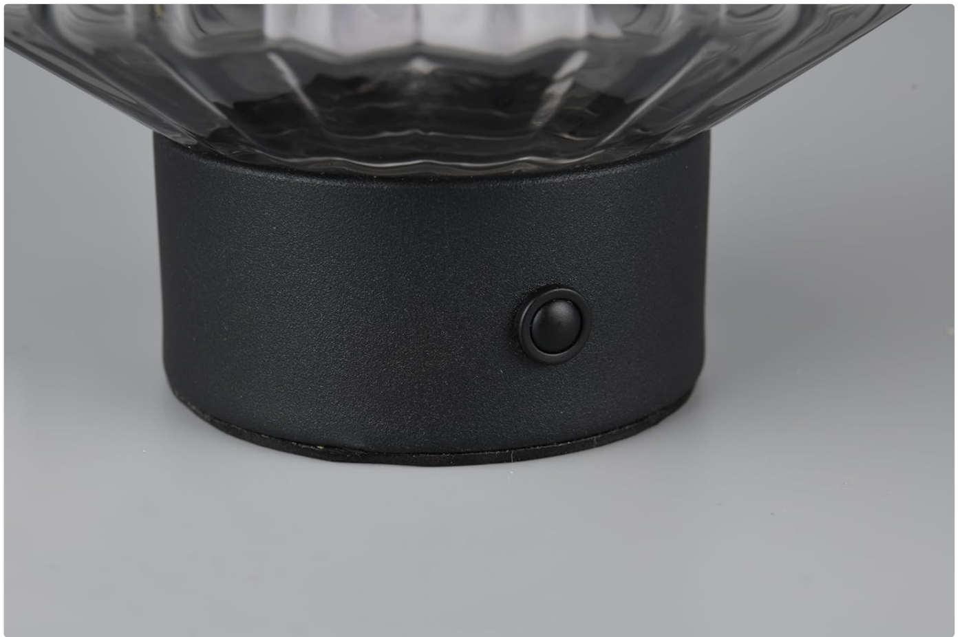
Figure 4: The touch sensor button on the lamp's base for power and dimming control.