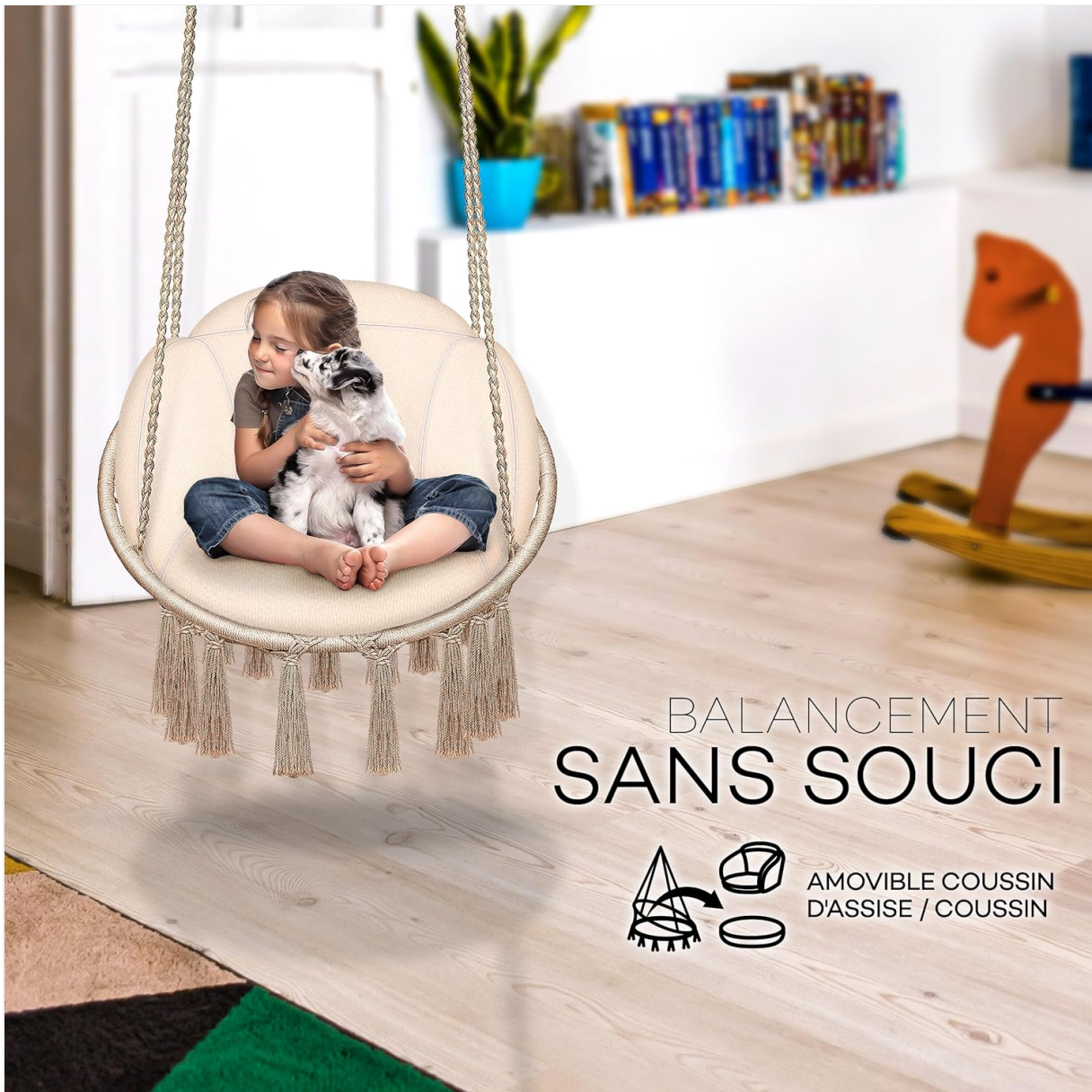
Image: The removable seat cushion allows for easy cleaning and maintenance.