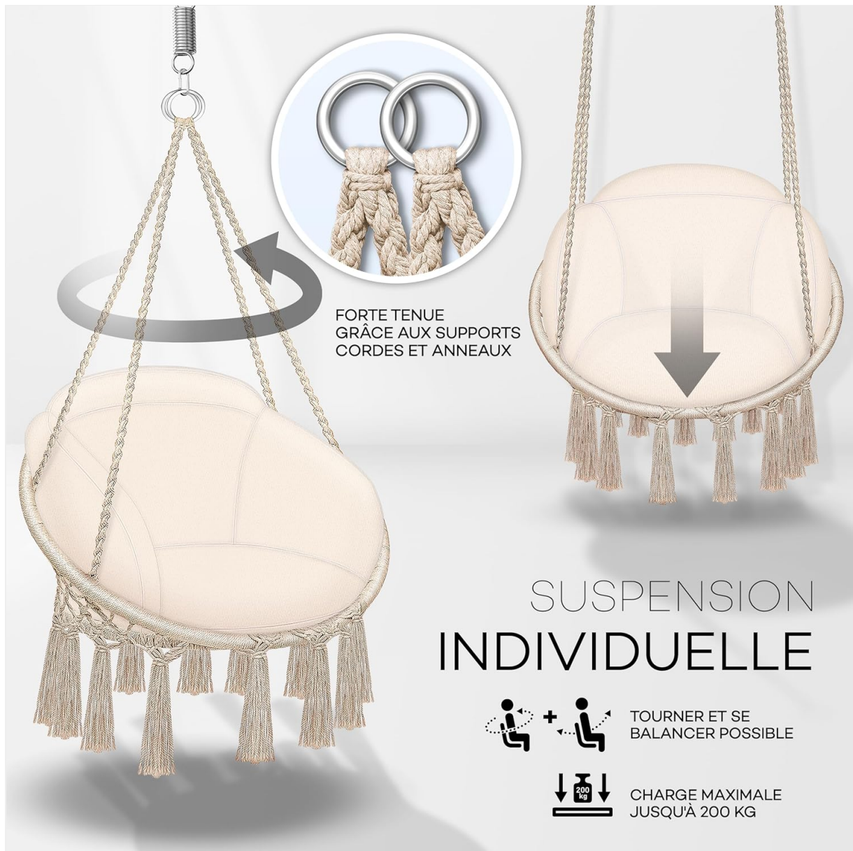
Image: Detail of the strong suspension ropes and steel rings, illustrating the individual suspension system.