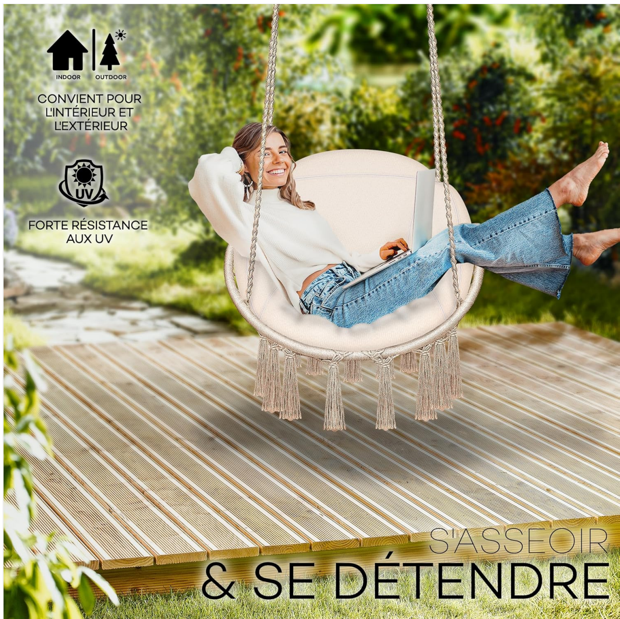
Image: The hammock chair is suitable for both indoor and outdoor areas, featuring strong UV resistance for outdoor durability.