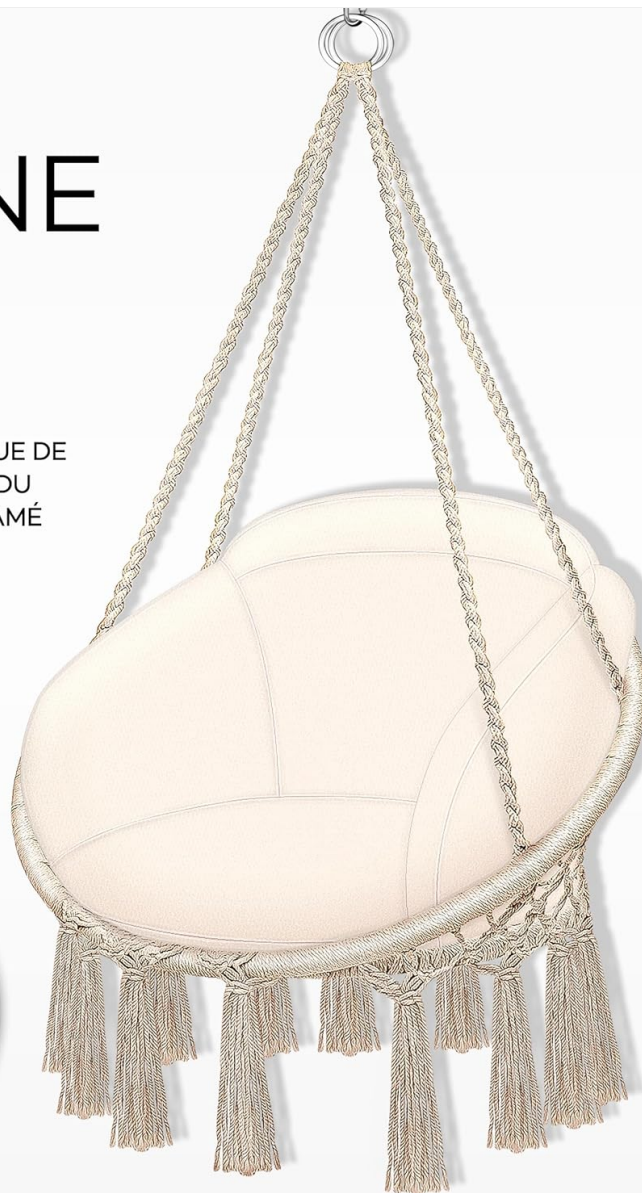
Image: Overview of the tillvex Hanging Hammock Chair, showing the macramé basket, seat cushion, and suspension rings.