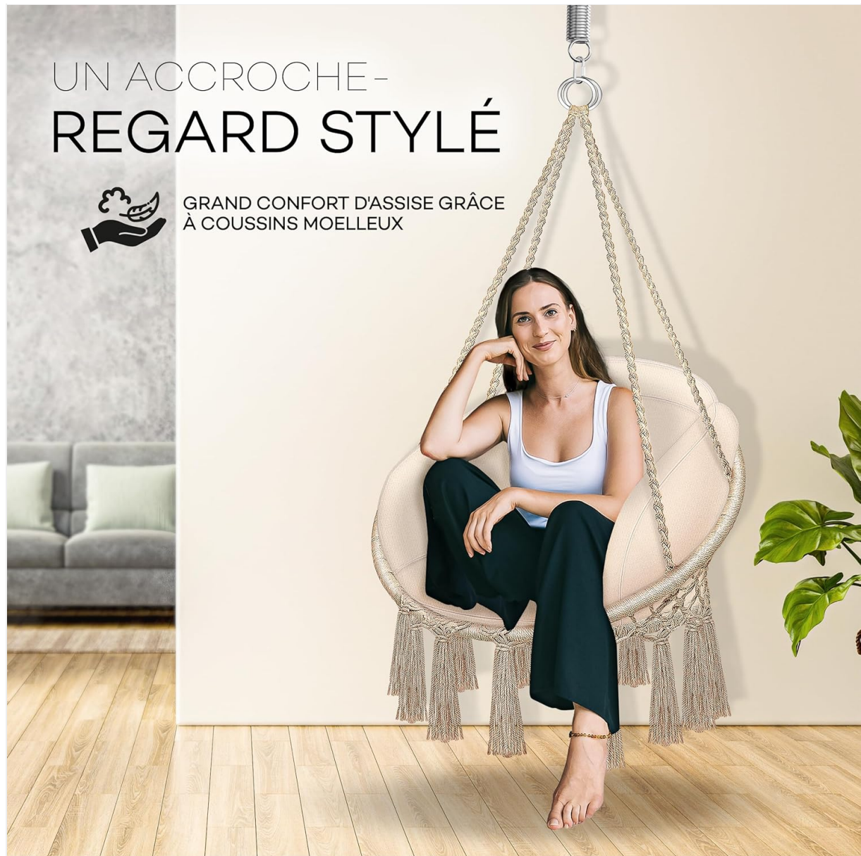
Image: A person enjoying the high level of comfort provided by the soft cushions in the hammock chair.