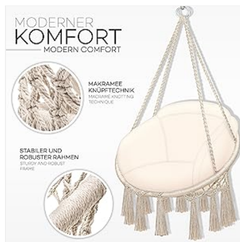
Image: Close-up showing the macrame knotting technique and the robust frame construction of the chair.