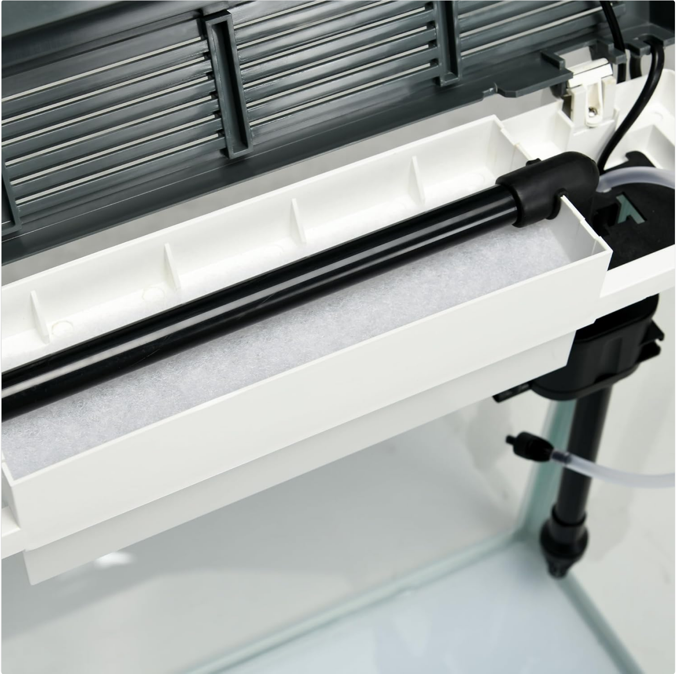
Image 6: Detailed view of the filter system within the lid, showing the placement of the filter cotton and the water circulation pipe.