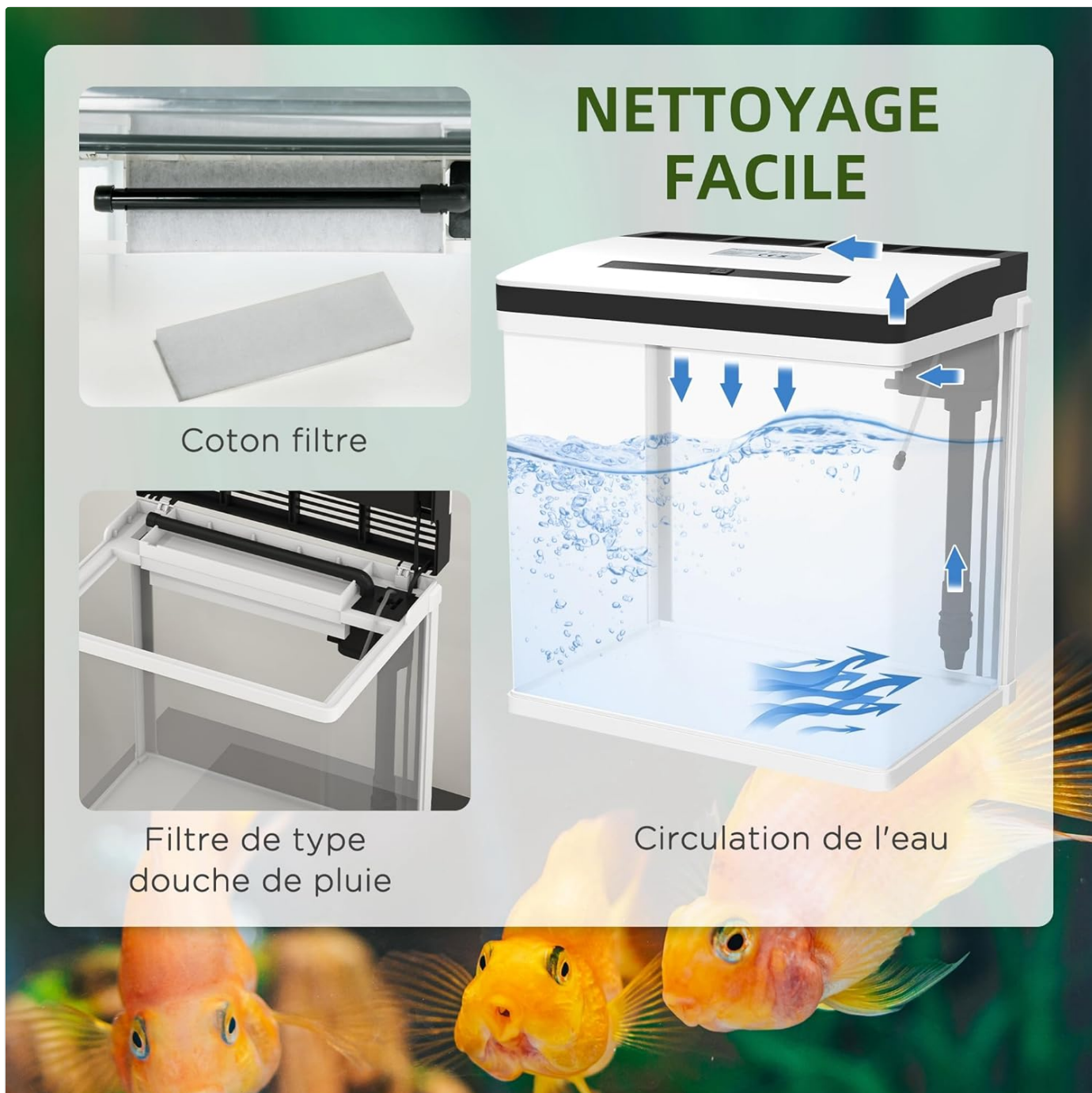
Image 7: Diagram showing the water flow within the aquarium, highlighting the filtration process with filter cotton and the "rain shower" type filter for effective water cleaning.

The water pump and filtration system operate continuously when plugged in. This ensures constant water circulation and filtration, maintaining water quality and oxygenation for your aquatic inhabitants.