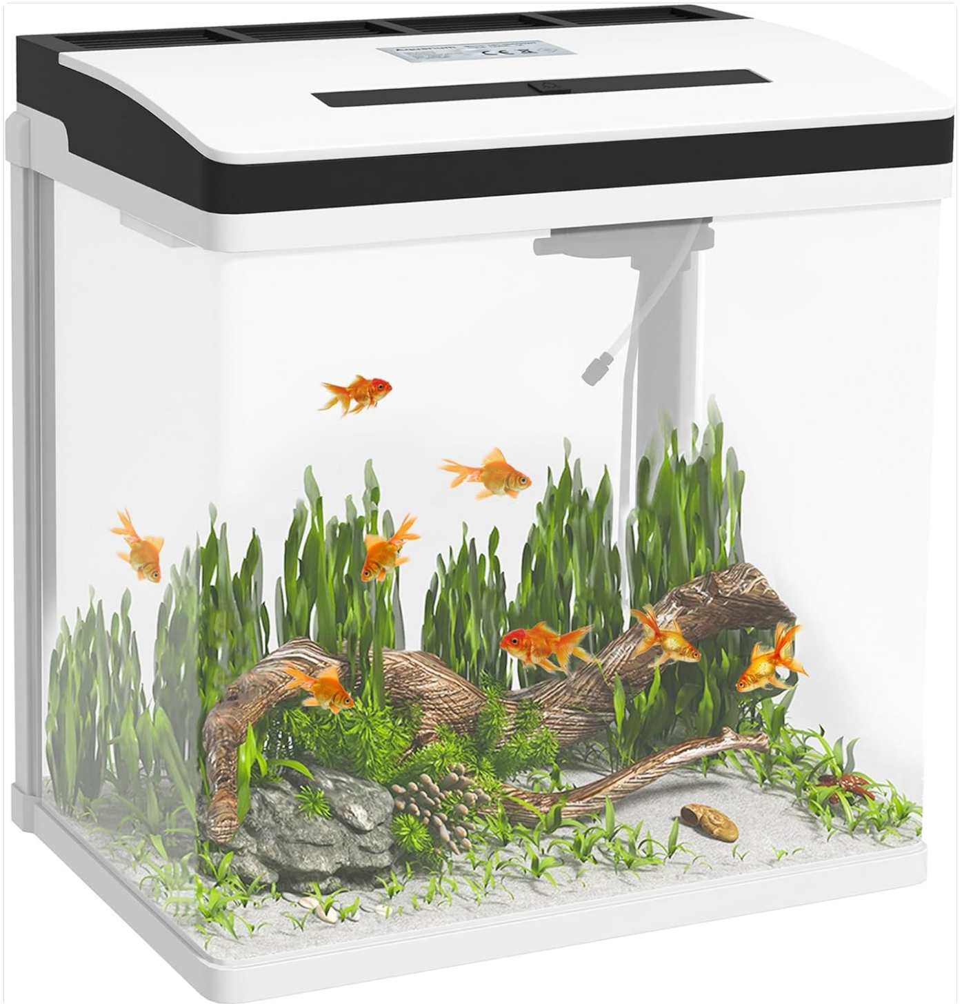
Image 1: The PawHut 28L Glass Aquarium, showcasing its compact design with integrated filter and LED lighting.