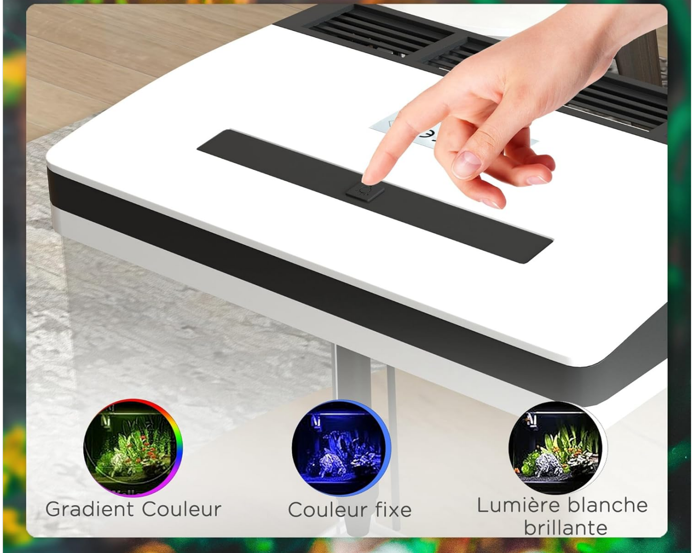
Image 3: Close-up of the aquarium lid, demonstrating the button for adjusting the LED light through its three modes: gradient color, fixed color, and bright white.