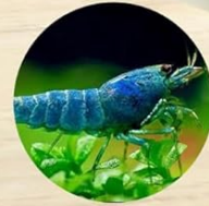
Image 2: Illustration of various small fish species, such as Betta, Guppy, and shrimp, suitable for this 28L aquarium.