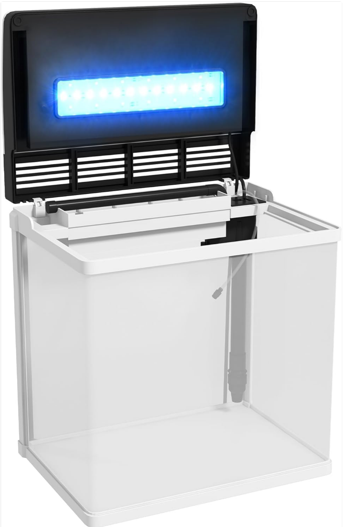
Image 5: Top-down view of the aquarium with the lid open, revealing the integrated LED light bar and the filter compartment.