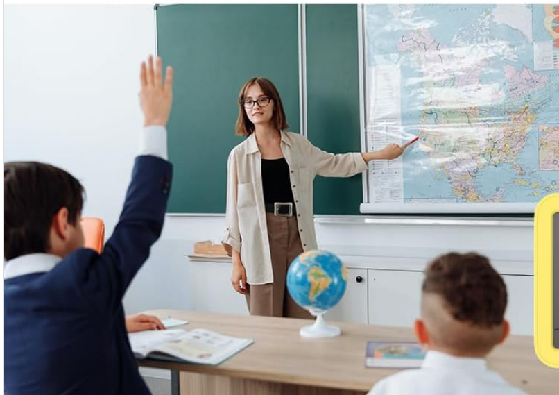
Image: A split image showing the VOCOO Digital Kitchen Timer in countdown mode. The top half shows the timer displaying "99H 59M" in a gym setting, while the bottom half shows "59.59" in a classroom setting. This highlights the timer's versatility and large display for different environments.