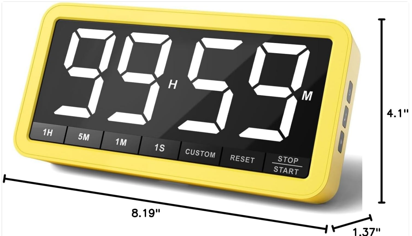
Image: The VOCOO Digital Kitchen Timer shown with its dimensions: 8.19 inches in width, 4.1 inches in height, and 1.37 inches in depth. The display shows "99H 59M".