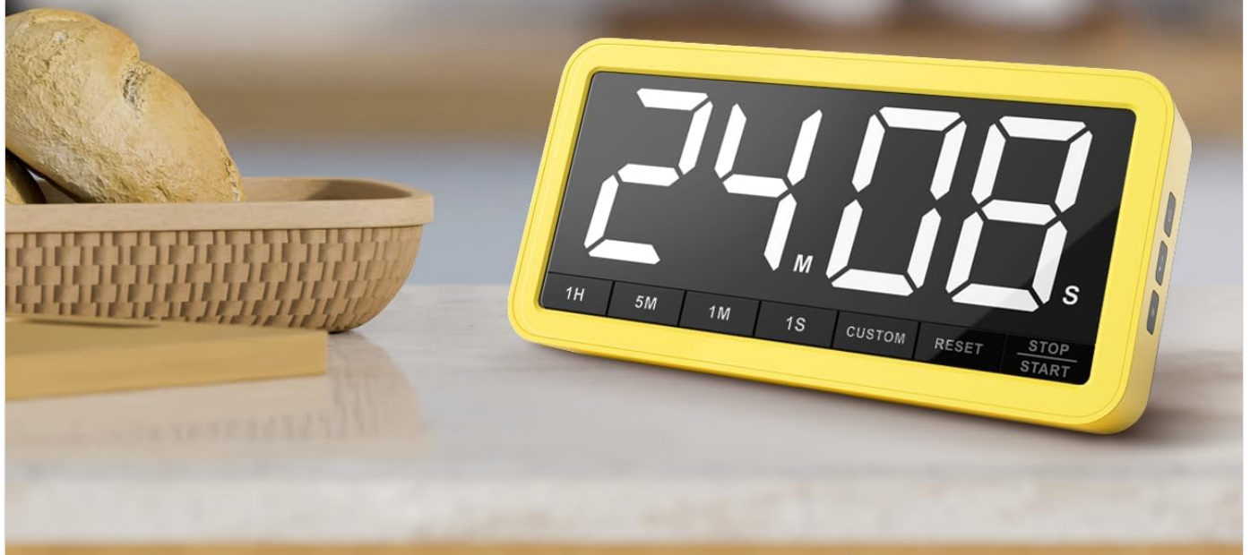
Image: A detailed view of the VOCOO Digital Kitchen Timer's features, including a large LED display, longer count range (99 hours, 59 minutes, 59 seconds), 1-minute countdown reminder (numbers turn red), and custom function. It also shows the various alarm melodies and volume levels.

Set a regular countdown time for quick access to it