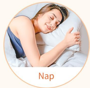
Image: A collage showcasing the VOCOO Digital Kitchen Timer in various application settings: cooking, classroom, fitness, skincare, and nap time. The timer displays "24.08" in the center, emphasizing its broad utility.