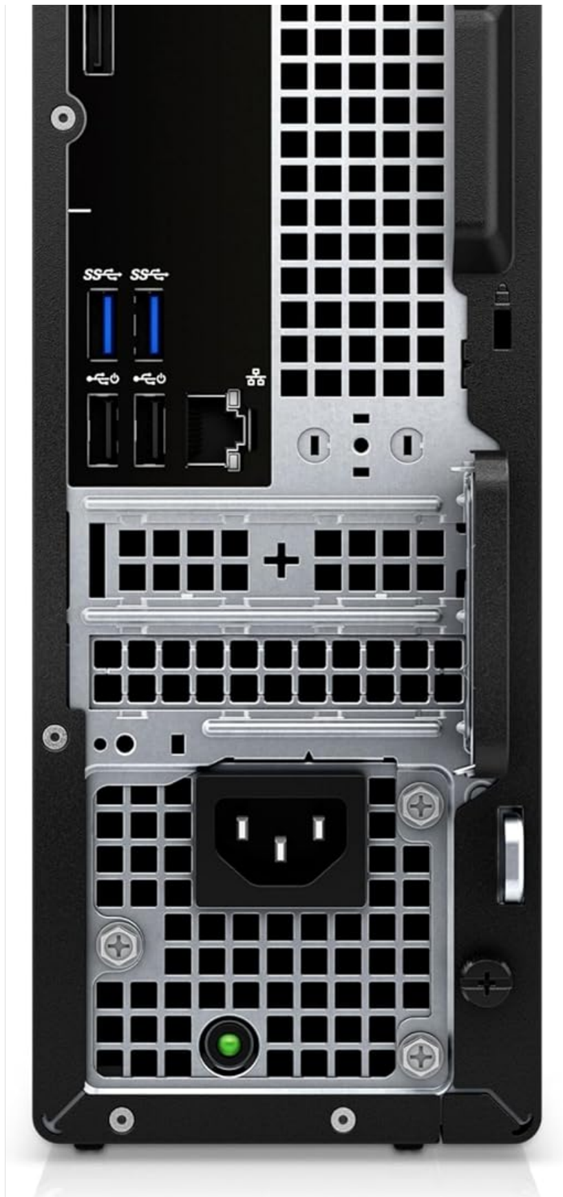
Image: Rear view of the Dell Vostro 3710 SFF Desktop Computer, displaying the arrangement of its various connectivity ports including USB, HDMI, Ethernet, and audio jacks.