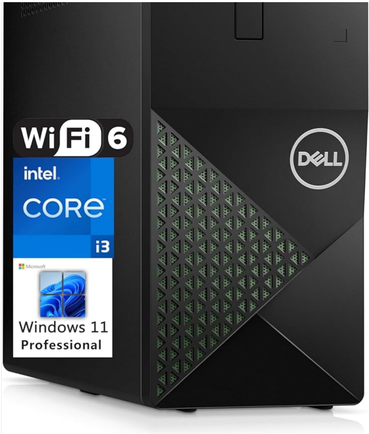
Image: Front view of the Dell Vostro 3710 SFF Desktop Computer, highlighting its compact design and key features like Wi-Fi 6 and Intel Core i3 processor, running Windows 11 Professional.