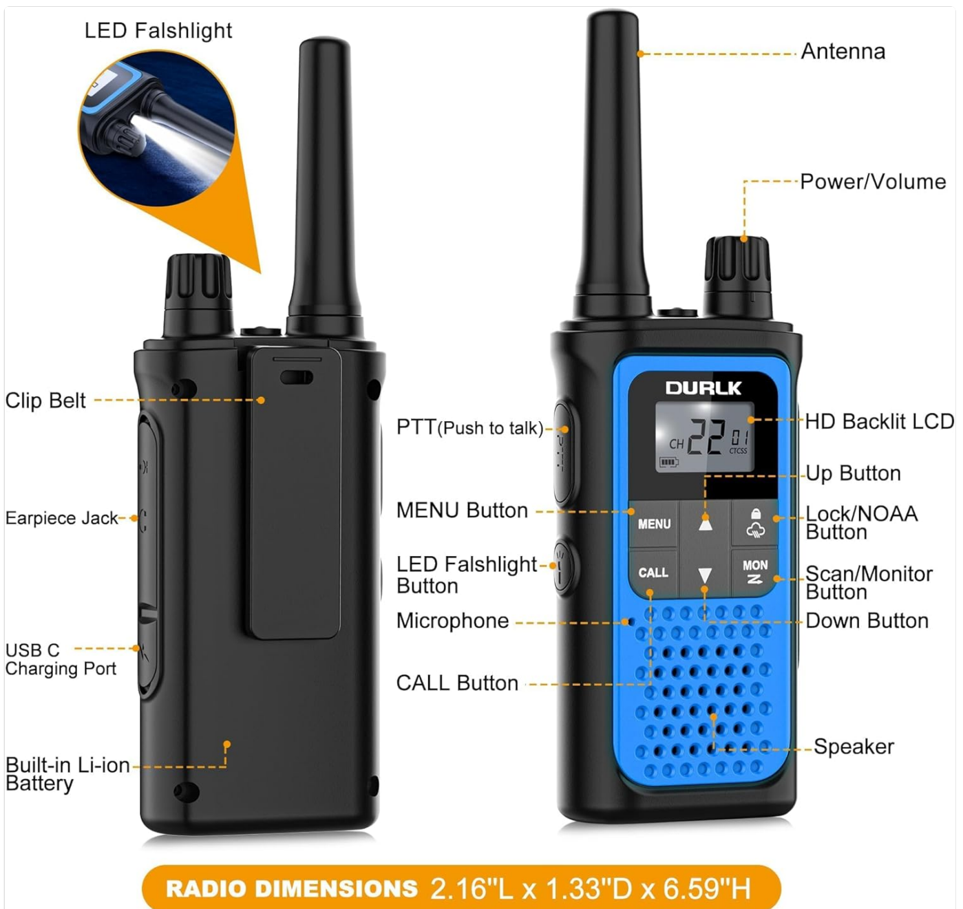
Image: Detailed diagram of DURLK Walkie Talkie components.