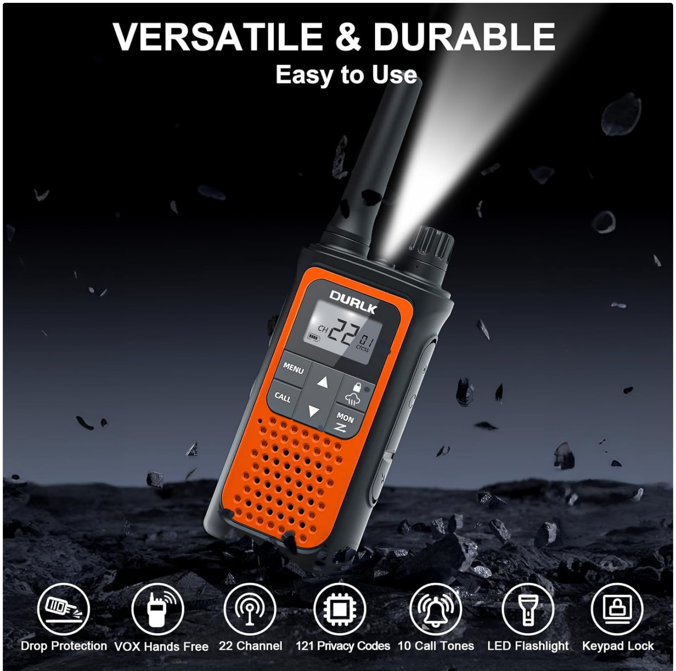
Image: Key features of the DURLK Walkie Talkie, including flashlight and various functions.