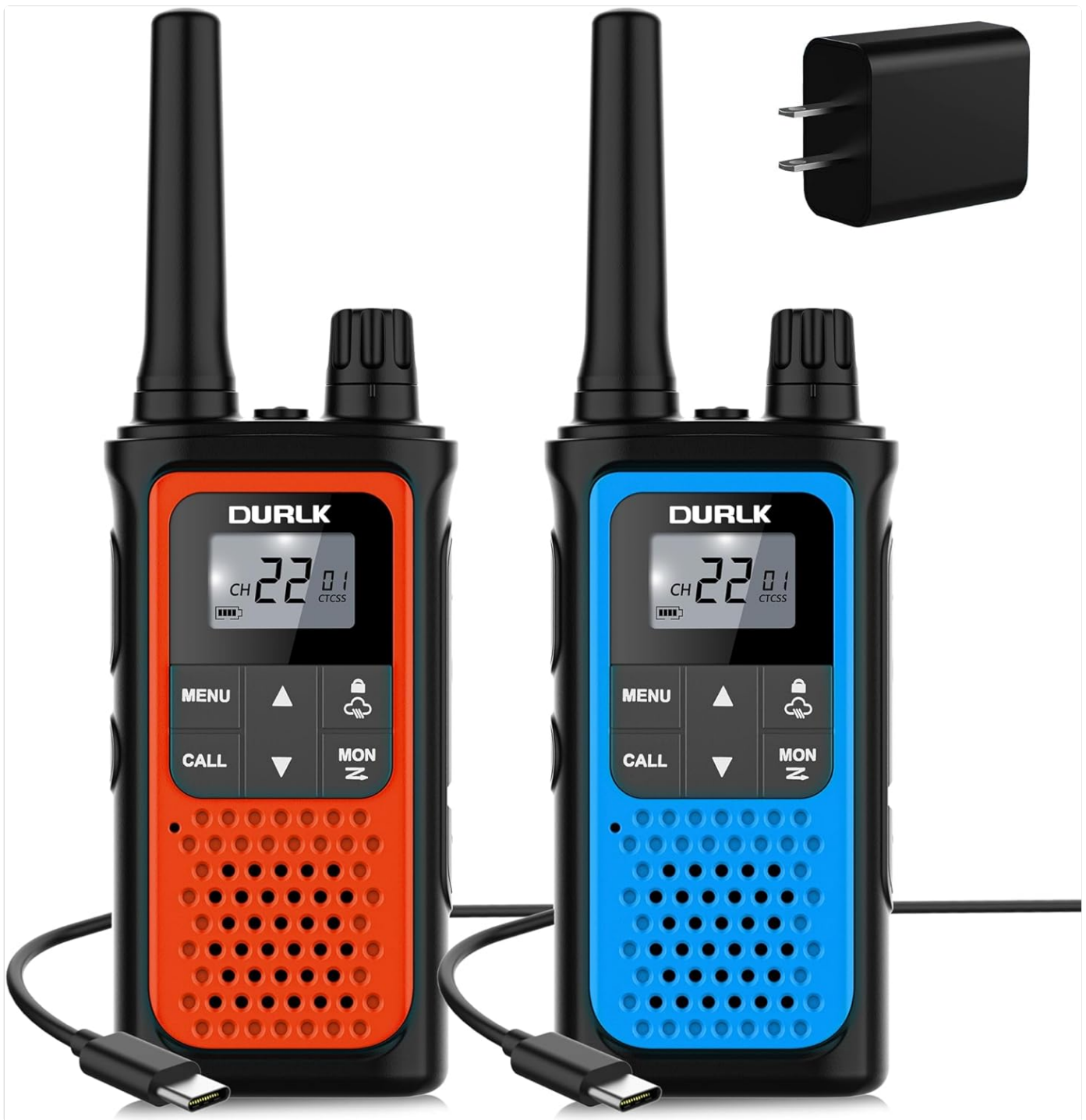
Image: DURLK ZX-808 Walkie Talkies (Orange & Blue) with charging accessories.