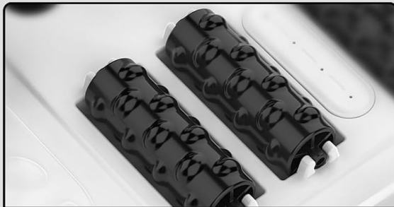
8 Sets of Massage Rollers

Image: A top-down view of the foot spa's interior, highlighting the arrangement of 8 groups of non-automatic massage rollers and 4 sets of shiatsu massage points designed for targeted foot relief.