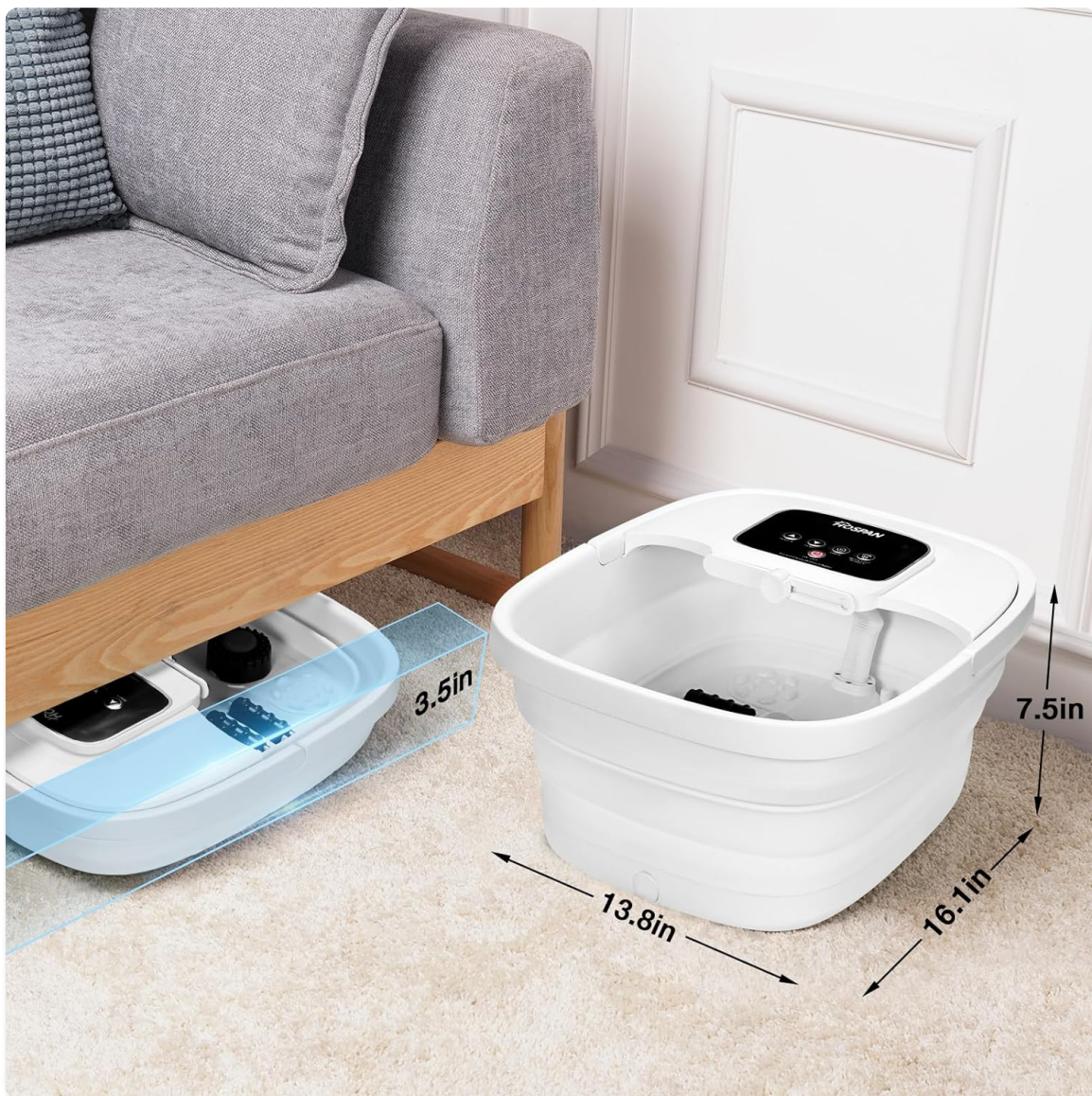
Image: The foot spa demonstrating its collapsible design, showing its compact size when folded (3.5 inches) and expanded (7.5 inches high, 13.8 inches wide, 16.1 inches long).