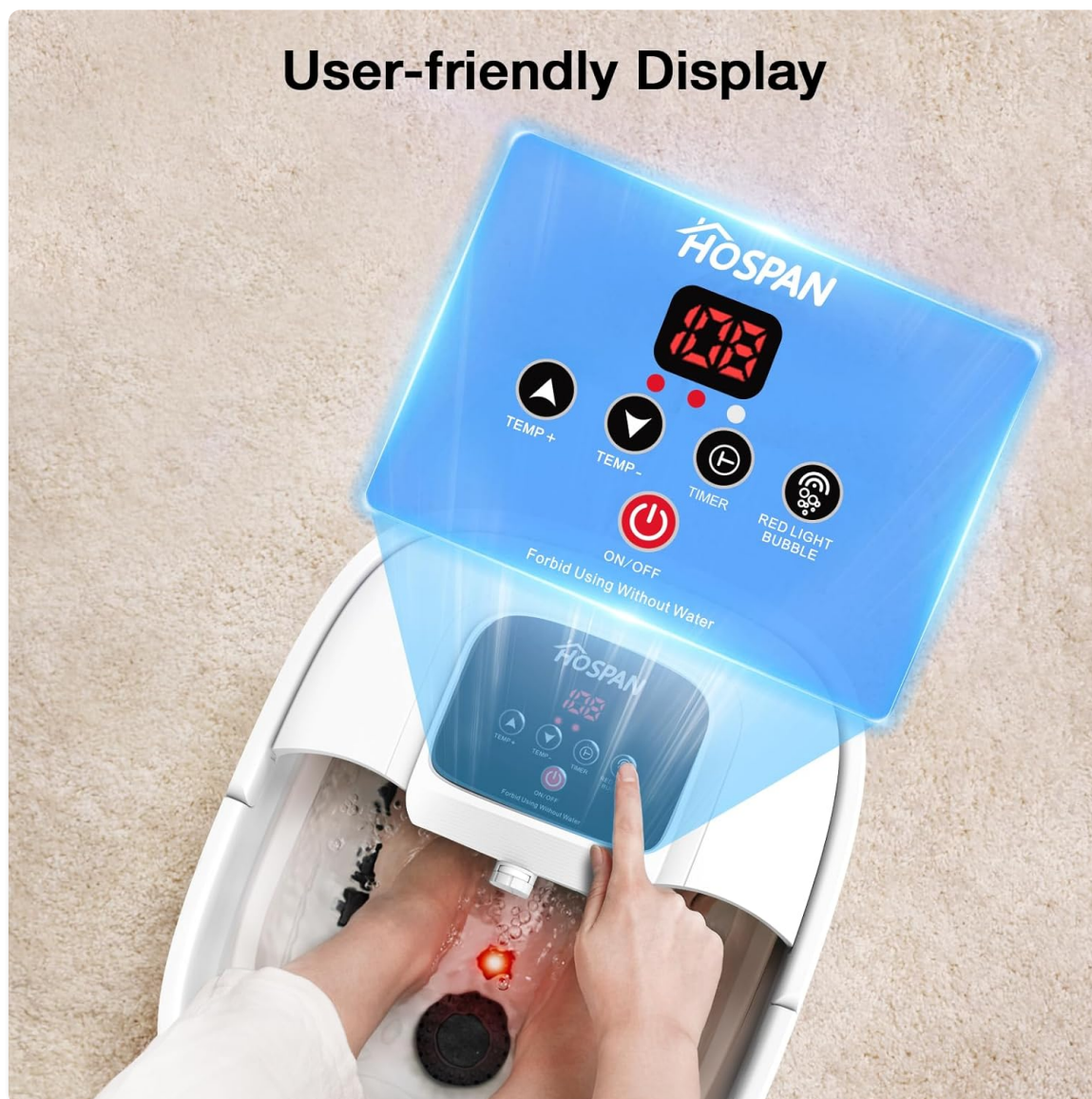
Image: A detailed view of the foot spa's user-friendly control panel, showing the digital temperature display and buttons for temperature adjustment, timer, and red light/bubble activation.

7. Power Off: Once your session is complete, press the ON/OFF button to turn off the unit.