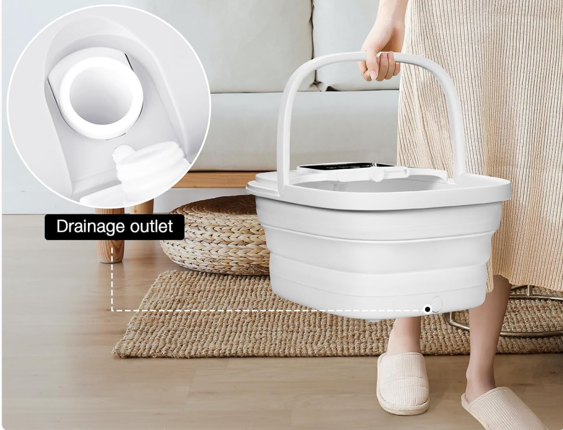
Image: A woman carrying the foot spa by its integrated handle, highlighting its lightweight and portable nature. An inset shows a close-up of the drainage outlet.