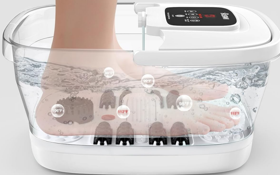
Image: An illustration demonstrating the foot spa's ability to quickly heat water and maintain a consistent temperature between 95°F and 118°F for up to 60 minutes.