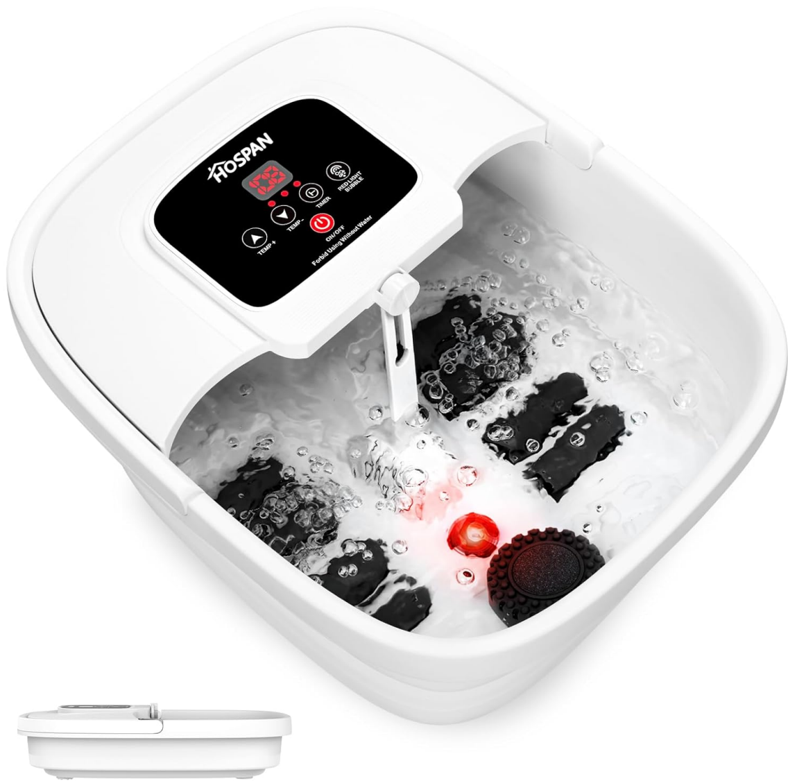
Image: The HOSPAN Collapsible Foot Spa in use, showing water, bubbles, and the red light feature. The control panel is visible at the top.