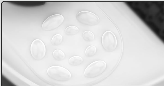
4 Sets of Shiatsu Massages