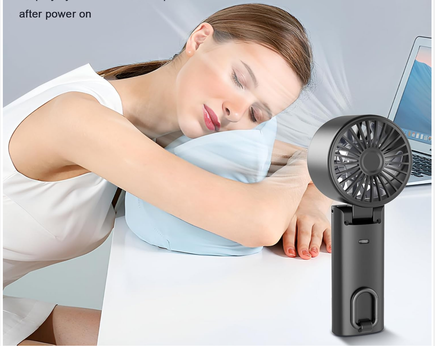
Image: Three different usage scenarios for the GOCKERA Portable Fan: handheld, worn as a neck fan, and placed on a desk.

Displays your favorite wind speed after power on