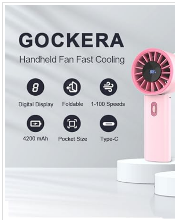
Image: Close-up of the GOCKERA Portable Fan's roller switch, illustrating the 1-100 speed adjustment capability.