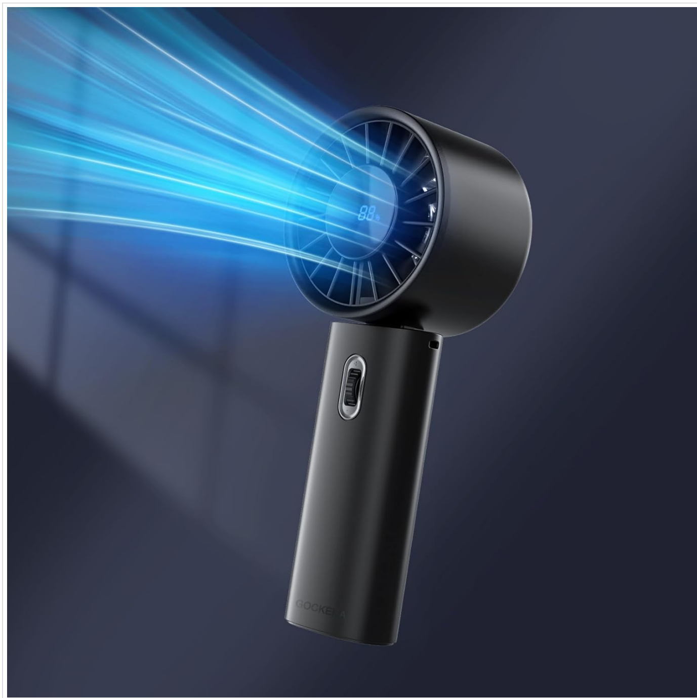
Image: The GOCKERA Portable Fan in black, demonstrating its powerful airflow with a blue stream of air.