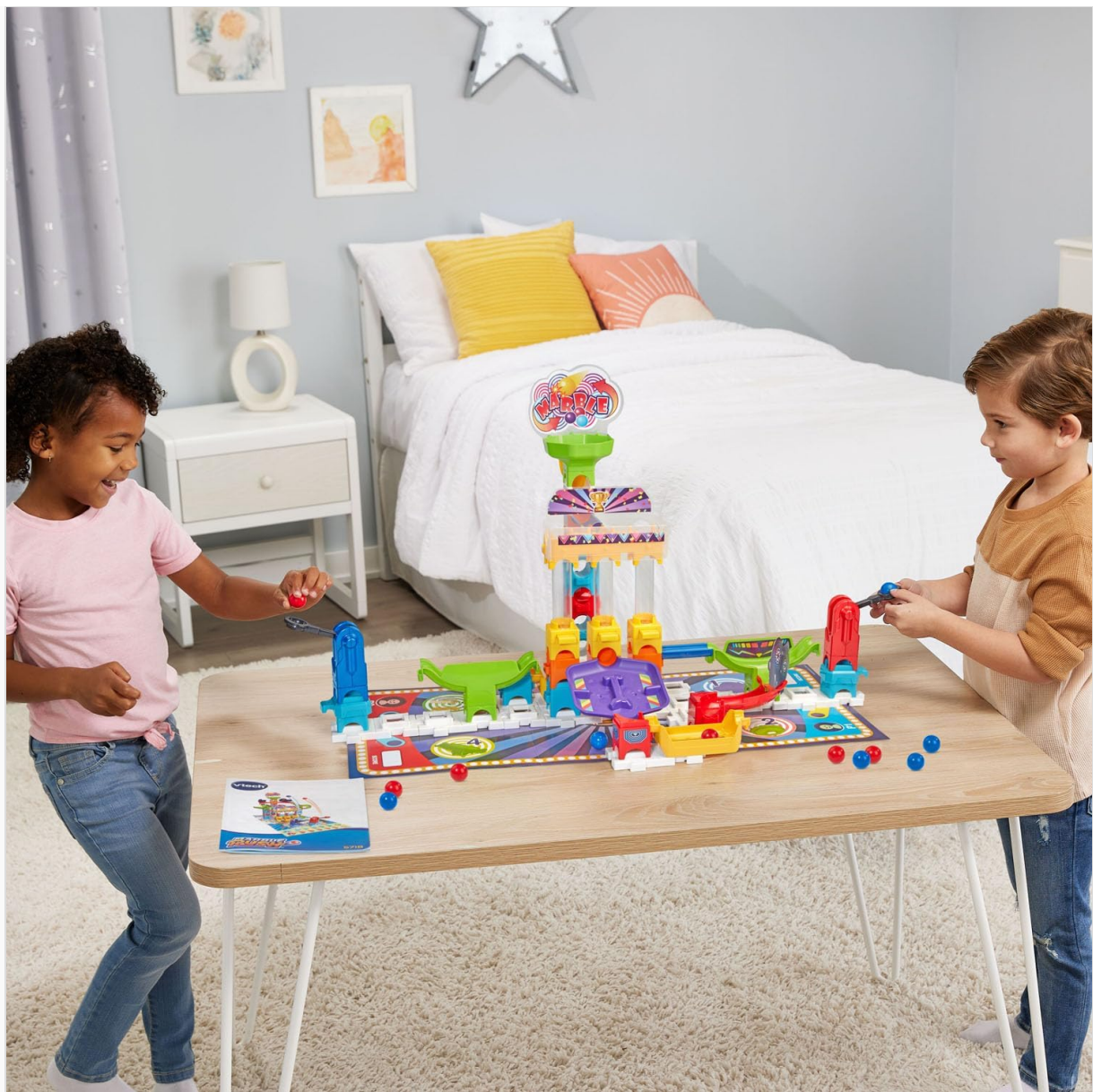
Image: Two children playing with the Marble Rush set.