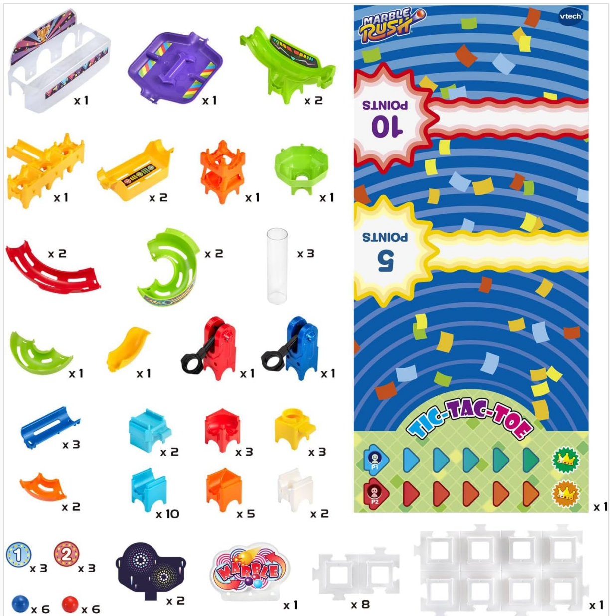
Image: All included components of the Marble Rush Carnival Challenge Game Set.