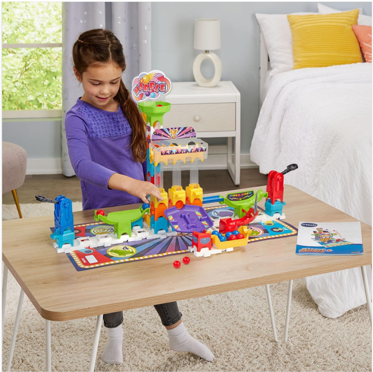
Image: A child engaging with the Marble Rush set.