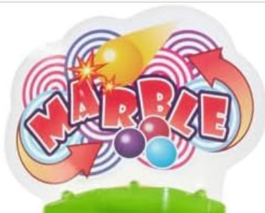
Image: Front cover of the instruction manual, illustrating the assembled set.