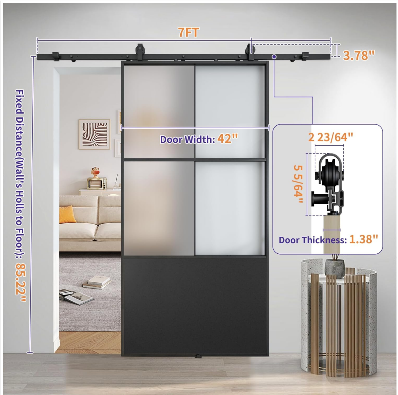
Image: Detailed dimensions of the JUBEST Sliding Barn Door, showing overall width, height, and door thickness.