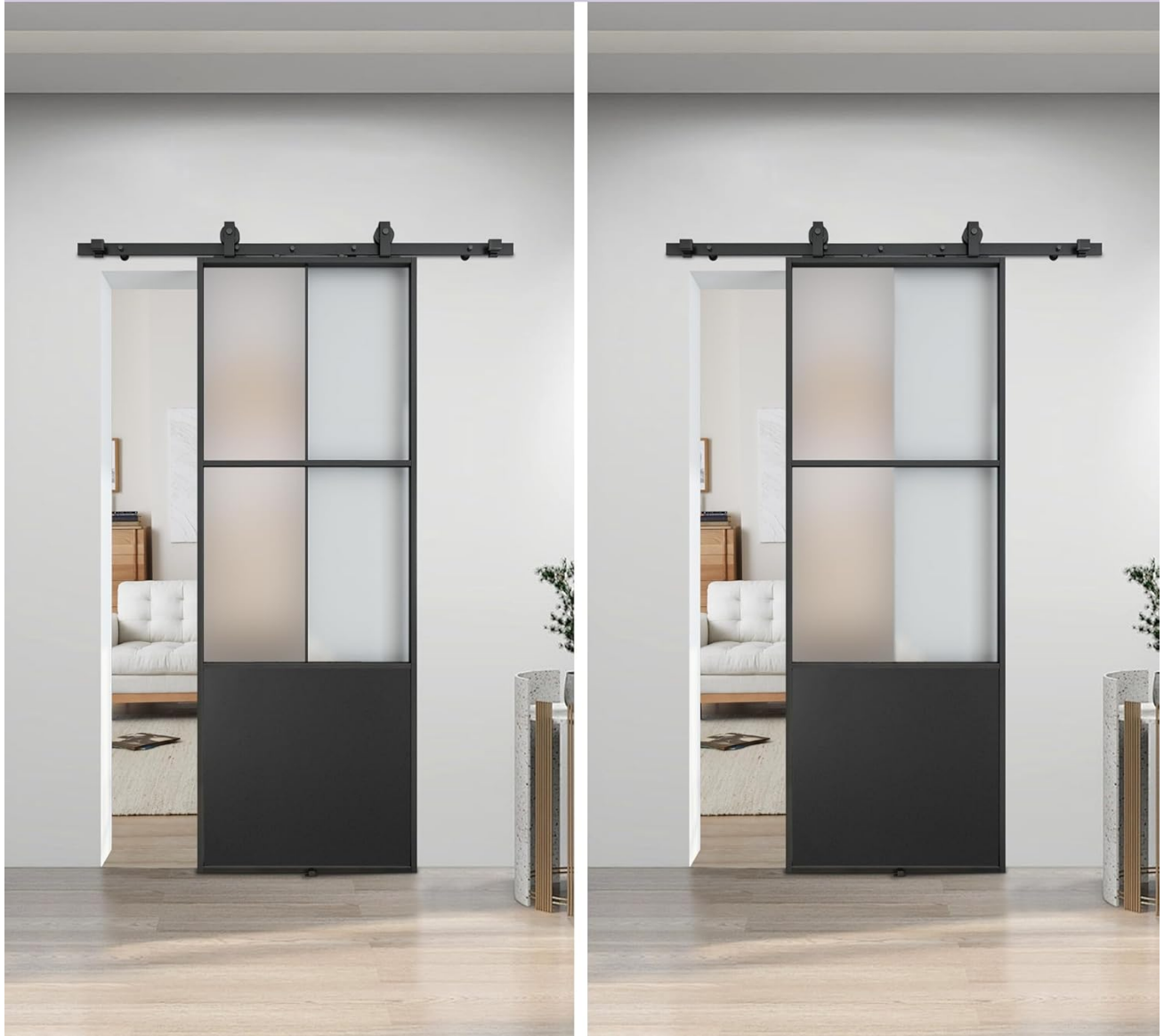
Image: Two versions of the JUBEST Sliding Barn Door, one with decorative horizontal and vertical stripes on the glass panels, and one without, demonstrating style options.

With or without stripes, you can decide the style you like