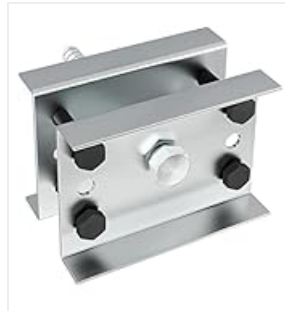
Image: Close-up view of the premium anti-jump pad, designed to keep the door securely on the track.