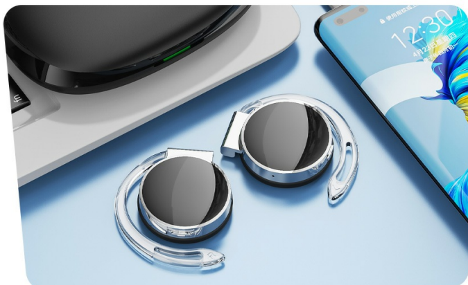
Image: Micool BT-X headphones demonstrating compatibility with various devices including laptops and smartphones via

BT-X supports Bluetooth enabled computer connections and supports all phone models.