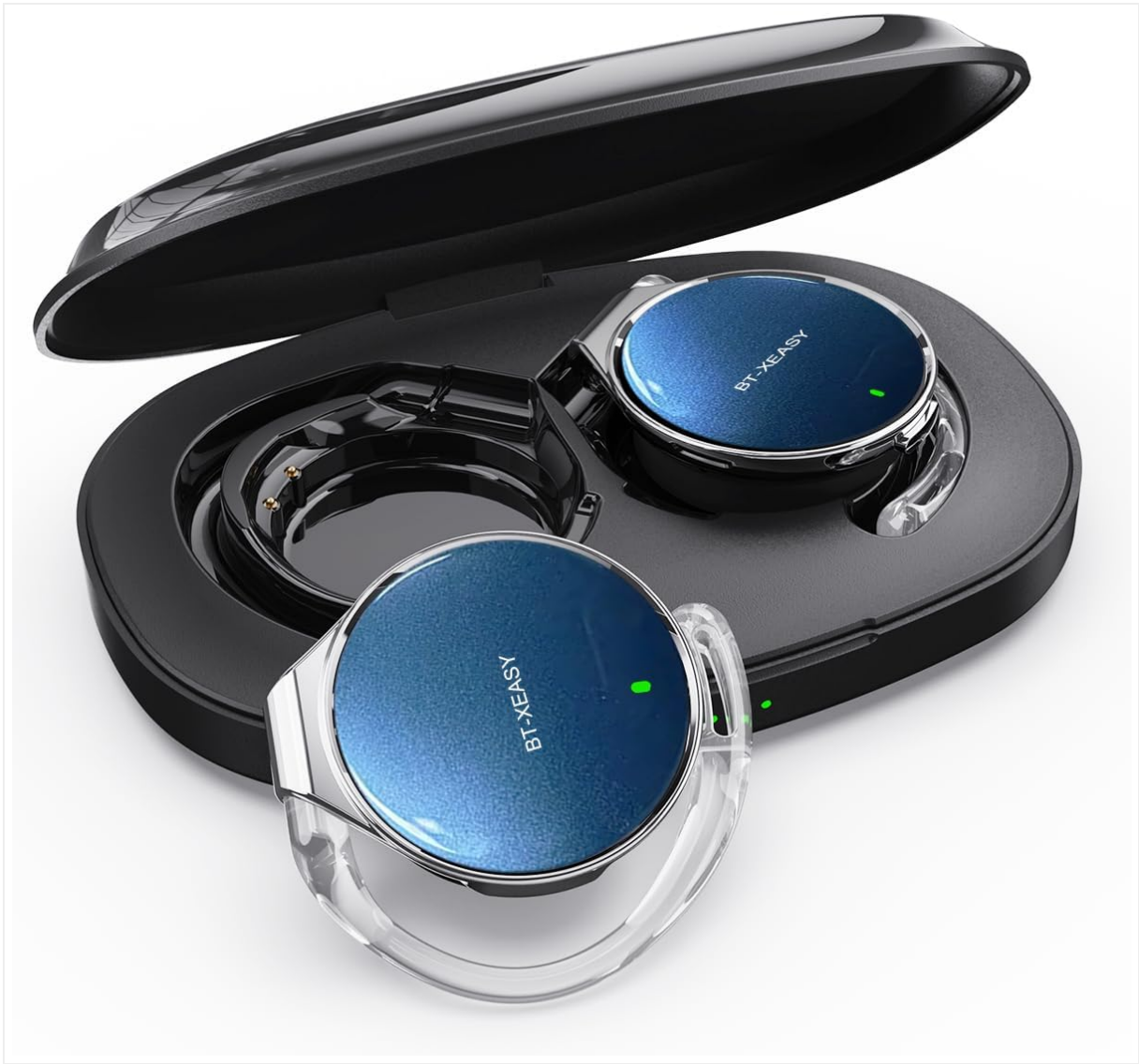
Image: Micool BT-X Headphones and Charging Case