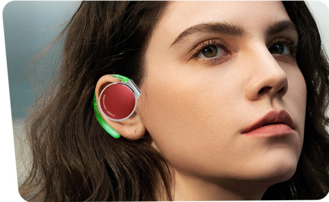
Image: User demonstrating clear call functionality with Micool BT-X headphones, featuring 4 microphones for noise cancellation.

The BT-X has 4 microphones and is equipped with call noise reduction, allowing the other party to hear your voice clearly in noisy environments.