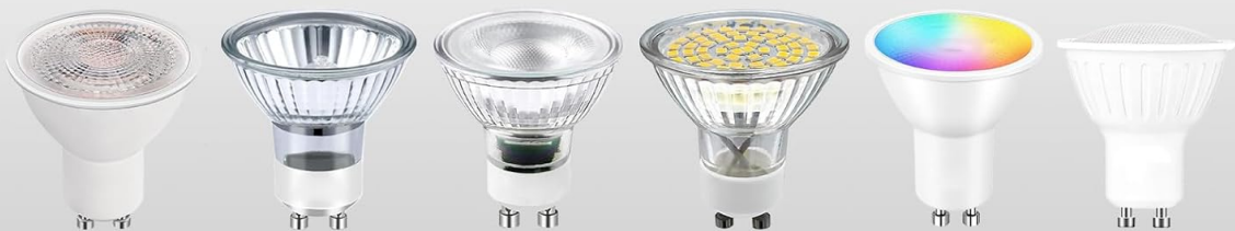
Image: Examples of various GU10 bulb types that are compatible with the BoostArea track lighting kit, indicating a maximum wattage of 35W.

Recommended GU10 Bulbs ( Bulb not included )