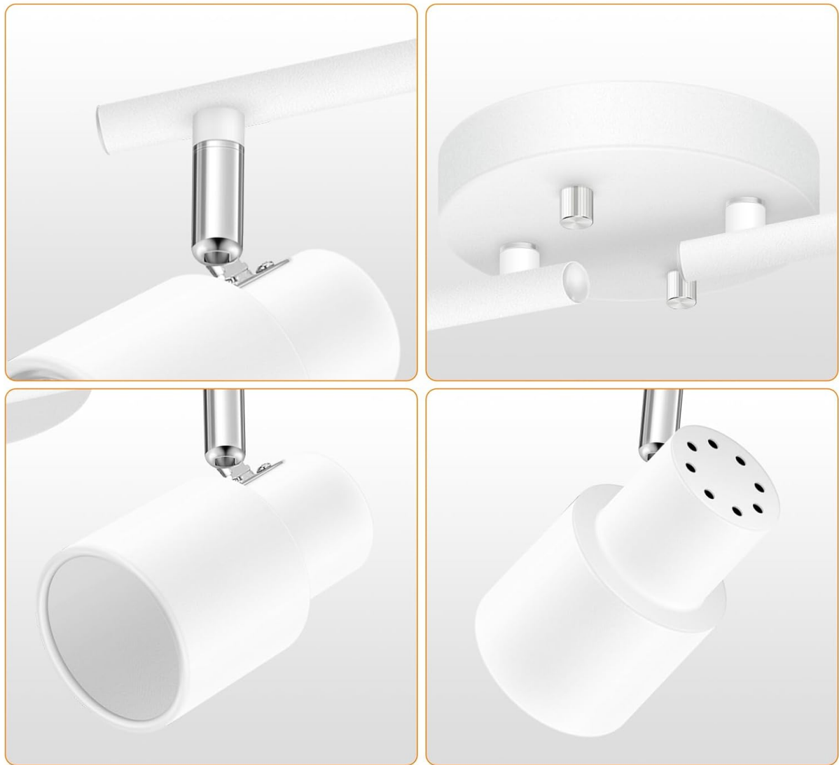
Image: Illustration demonstrating the 270° rotatable and 90° adjustable features of the track light heads.