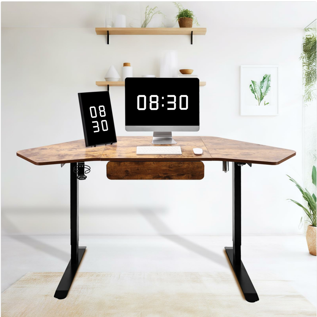
Image: The Frommann L-shaped standing desk illustrating its height adjustment range (27.5" to 47") and 180 lbs weight capacity.