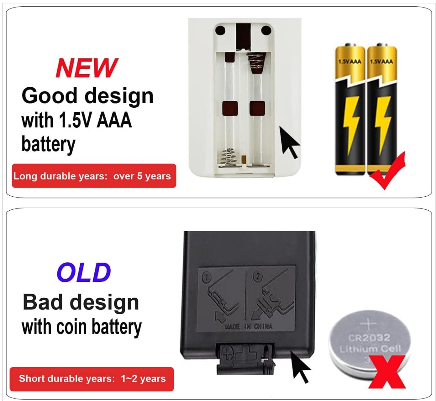
Figure 2: This remote uses AAA 1.5V batteries for longer life and easier replacement.