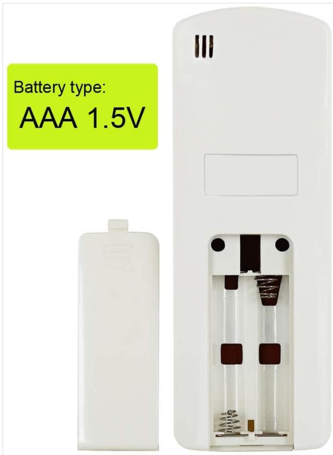
Figure 1: Battery compartment showing insertion of AAA 1.5V batteries.