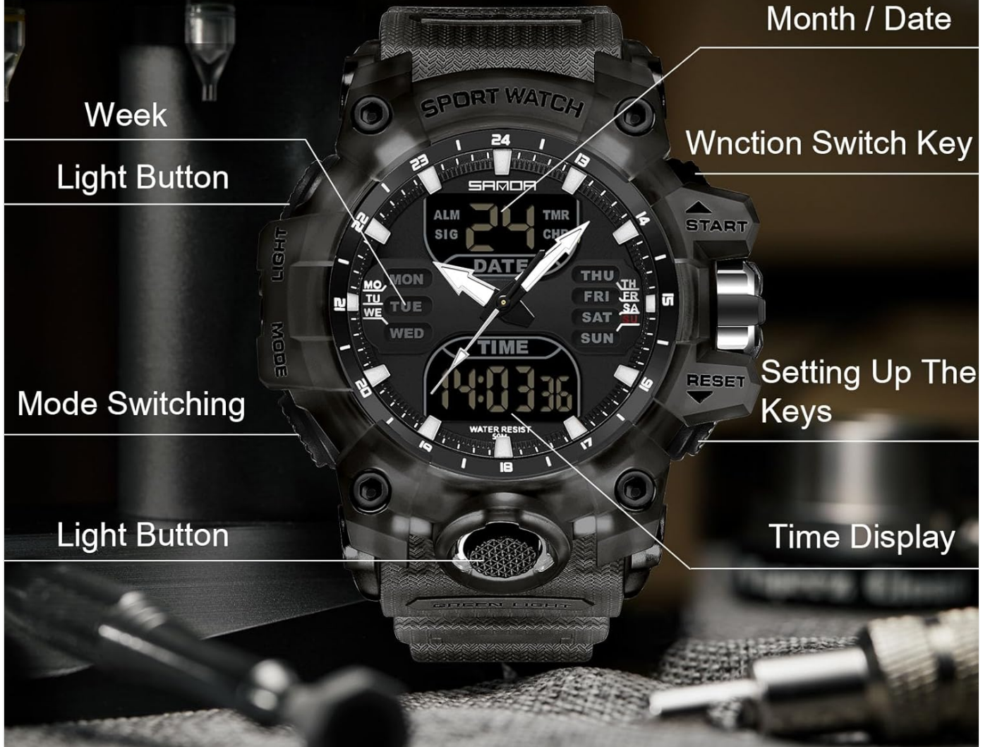
Figure 1: Watch Face and Button Layout. This image shows the watch face with labels indicating the 'Light Button', 'Mode Switching', 'Month/Date', 'Function Switch Key', 'Setting Up The Keys', and 'Time Display'.