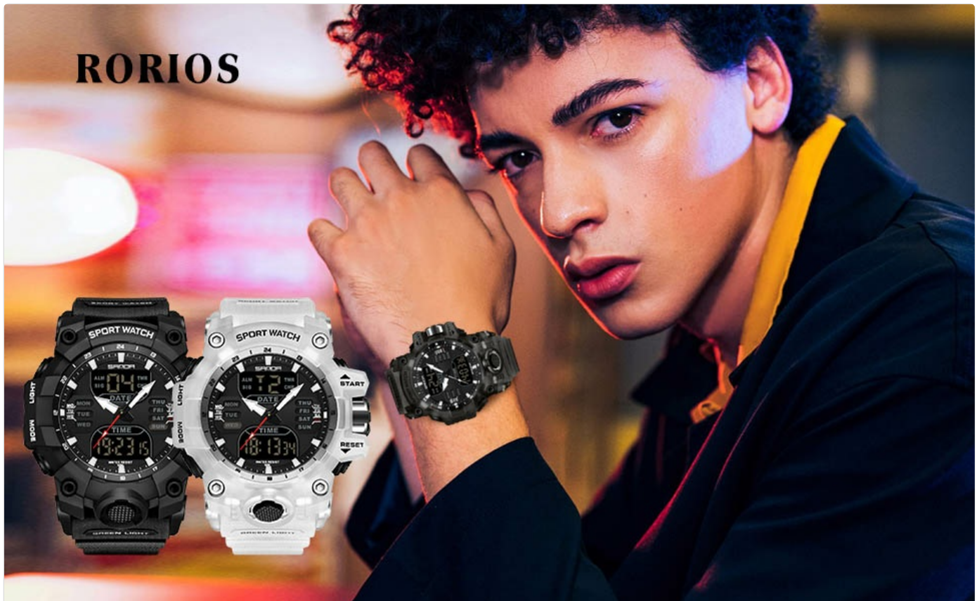
Figure 3: Water Resistance Feature. The watch is designed for daily life waterproof activities.

This watch is rated for 50 meters (5 ATM) water resistance. This means it is suitable for daily use, hand washing, rain exposure, and short periods of immersion in water. Important: Do not operate any buttons while the watch is submerged in water, as this can compromise the water seal and cause damage. Avoid hot water, steam, or extreme temperature changes.