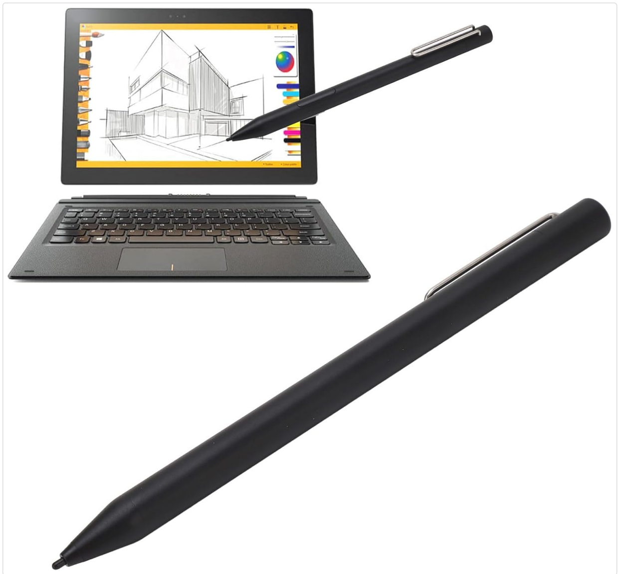
Image: The stylus positioned next to a laptop, illustrating its use with various compatible devices.