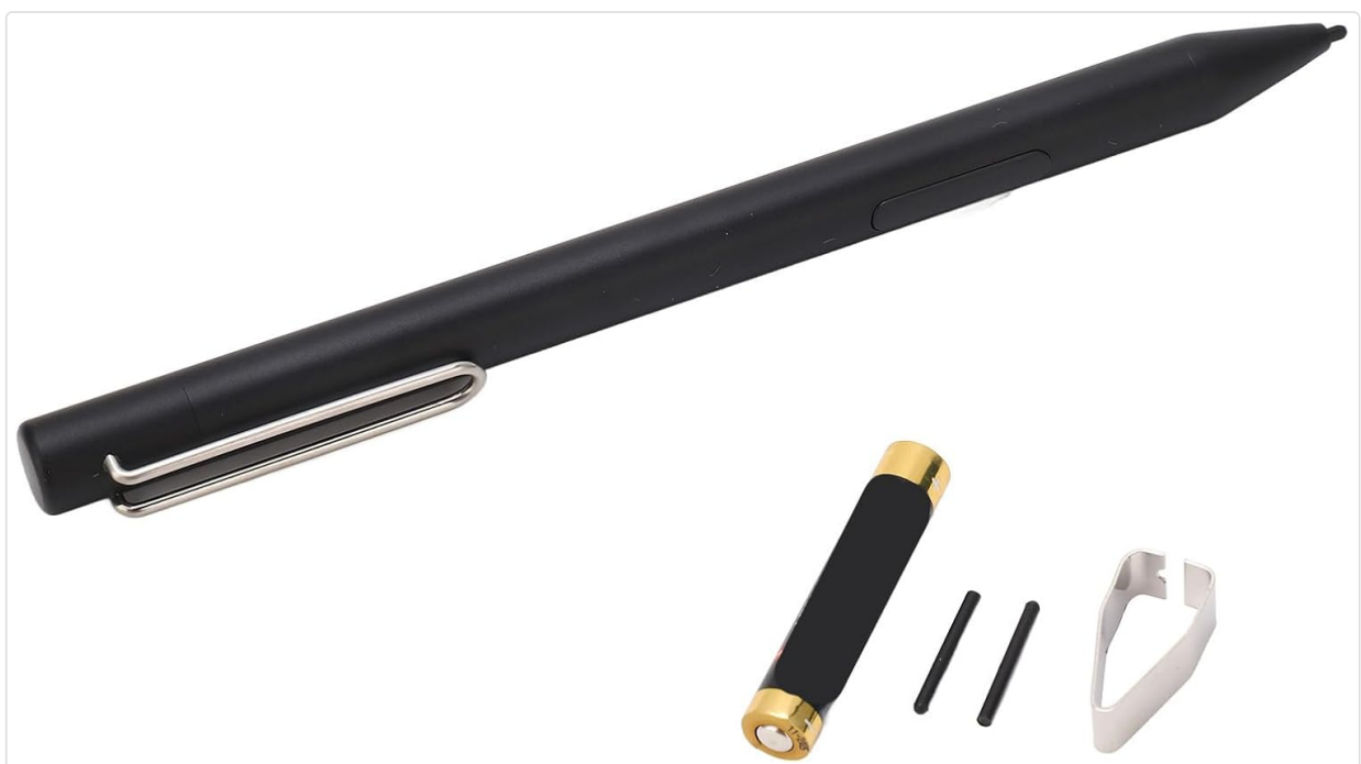
Image: The GOWENIC ME-MPP303 Stylus Pen shown alongside its replacement tips and the battery compartment cap.