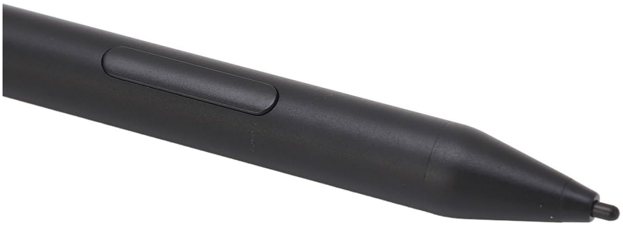
Image: A detailed view of the stylus tip and its two side buttons, illustrating their placement for easy access.