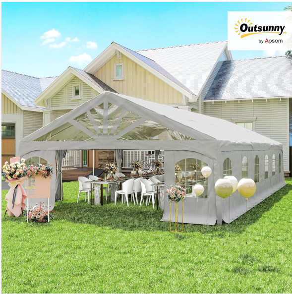
A view of the Outsunny party tent, highlighting the brand's logo on the side, indicating its quality and origin.