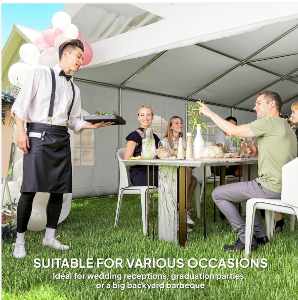
Guests seated at tables inside the tent, demonstrating its suitability for various occasions like wedding receptions or backyard barbecues.