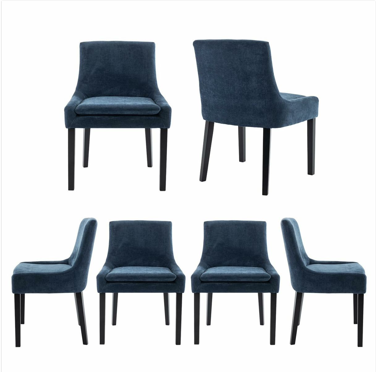
Figure 4: COLAMY Modern Dining Chairs in a living room setting.