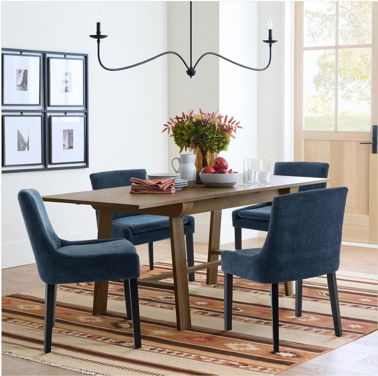
Figure 5: COLAMY Modern Dining Chairs arranged around a dining table.