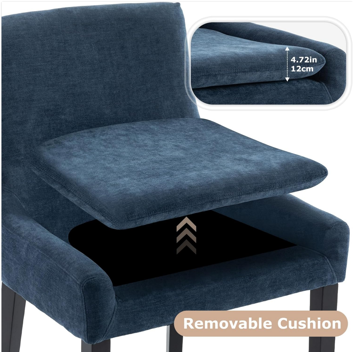
Figure 7: The removable seat cushion facilitates easy cleaning.