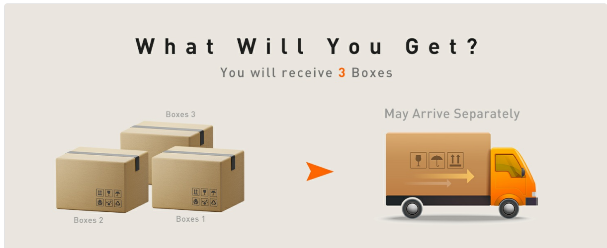
Figure 1: Your order may arrive in multiple boxes.