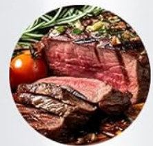
Beef Chicken steak