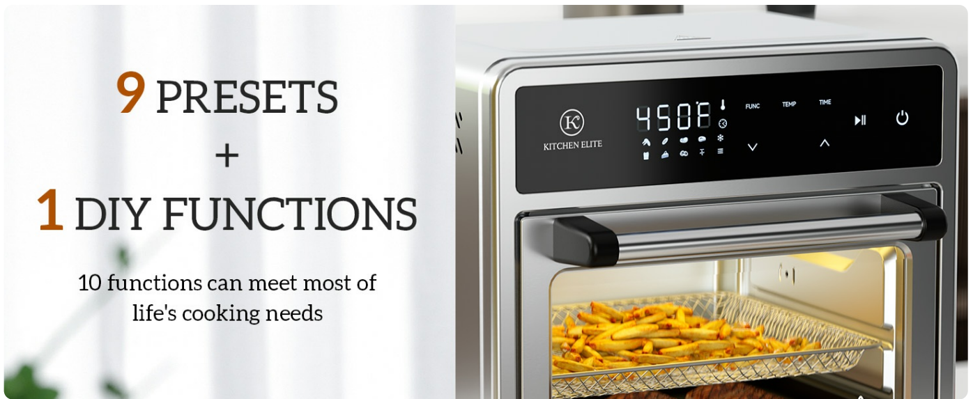
Figure 6: Efficient Multi-Layer Cooking

For specific cooking times and temperatures for various foods, refer to the detailed cooking chart provided in your physical user manual or experiment with the presets and DIY function.