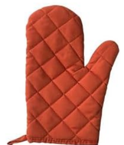
Figure 2: Main Unit and Included Accessories

Before first use, remove all packaging materials, stickers, and any protective film. Wash all accessories (baking tray, fryer basket, crumb tray) with warm, soapy water, rinse thoroughly, and dry completely. Place the crumb tray at the very bottom of the oven cavity. Ensure the unit is placed on a flat, stable, and heat-resistant surface with sufficient clearance from walls and other appliances.