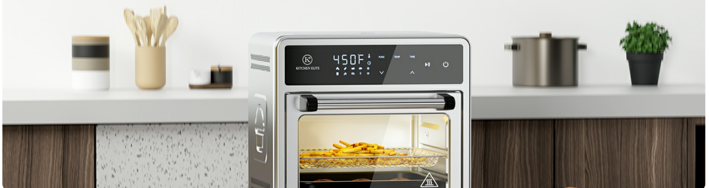
Figure 1: 10-in-1 Multi-functional Digital Air Fryer Oven

Kitchen Elite is committed to providing the most convenient cooking