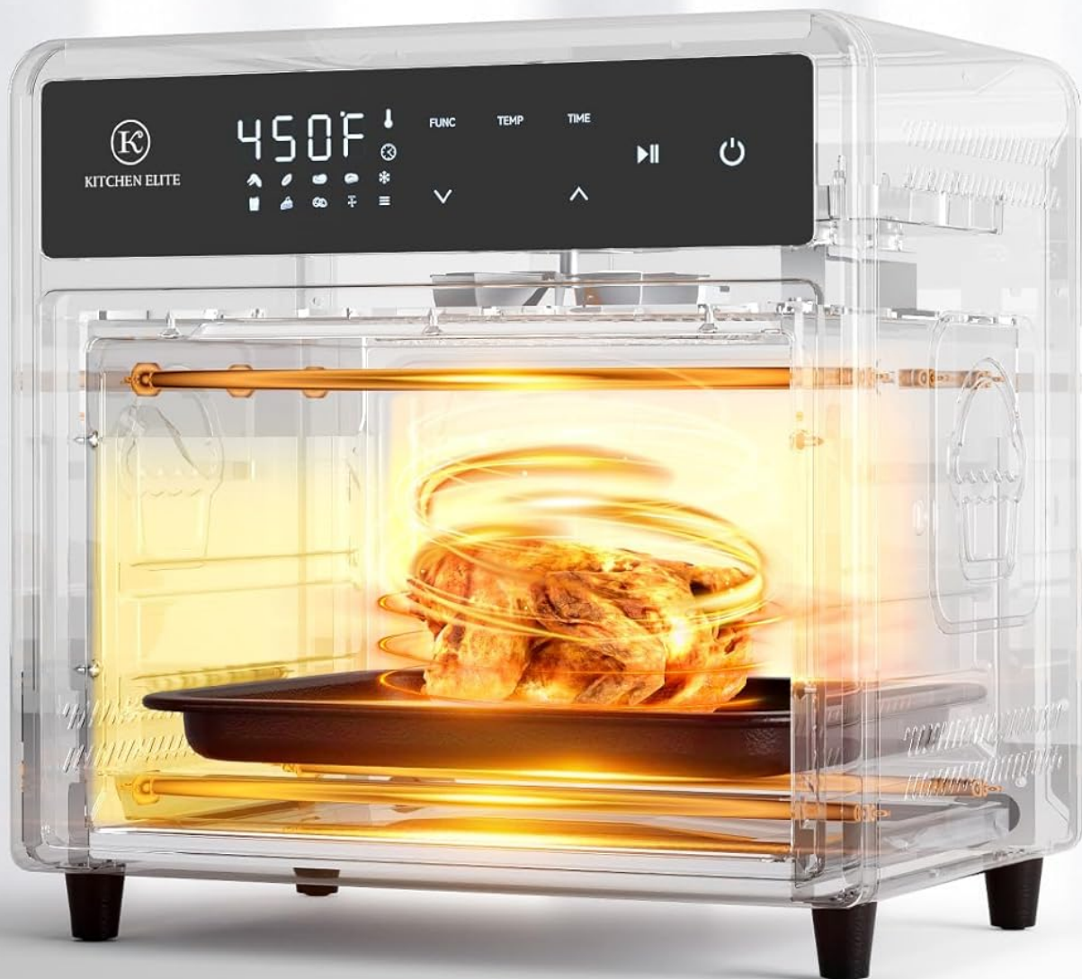
Figure 5: 360° Turbo Airflow Technology

The multi-layer design allows for cooking different foods simultaneously, maximizing efficiency for healthy meals in minutes.