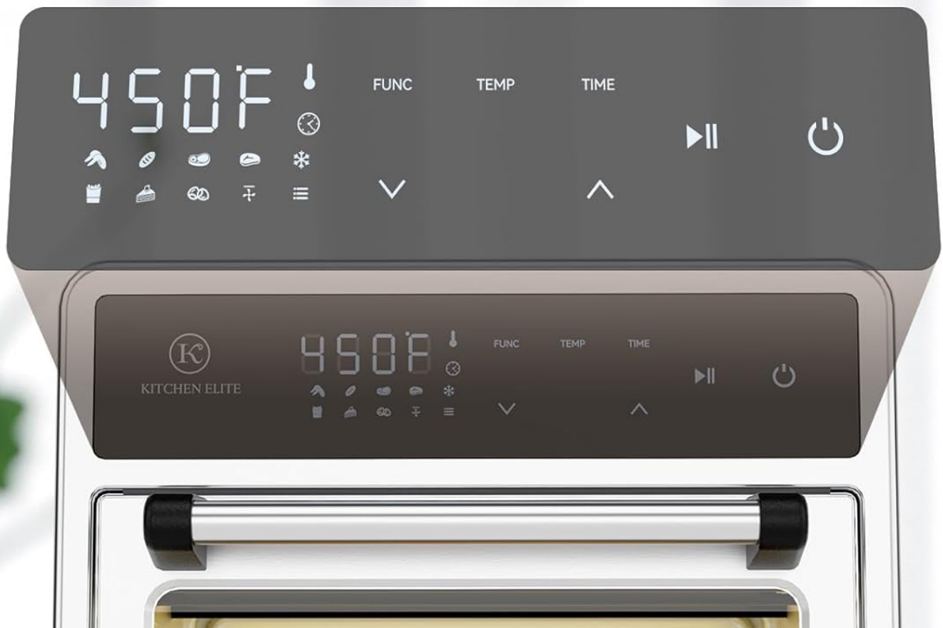
Figure 4: 9 Smart Presets & 1 DIY Function