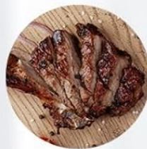
Lamb/Pork chops Chicken legs