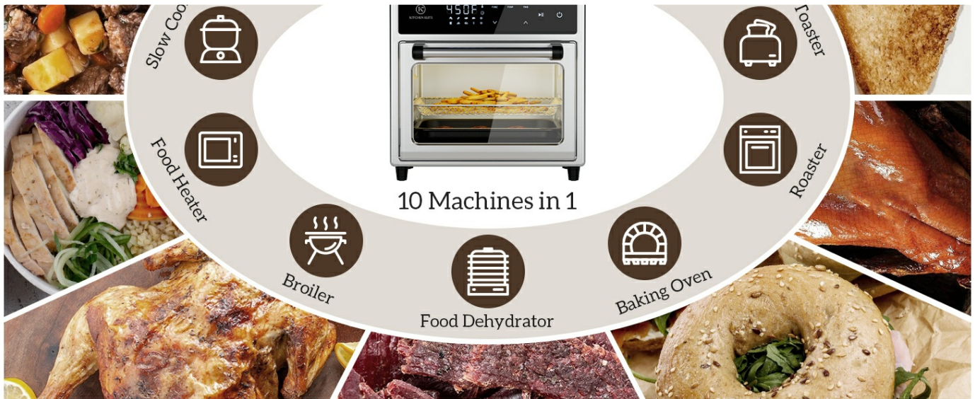
Figure 3: Digital Touch Screen Control Panel