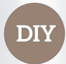
DIY: Toast, Pizza Vegetables Peanuts, Egg tarts , Corn