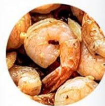
Grilled fish shrimp/seafood