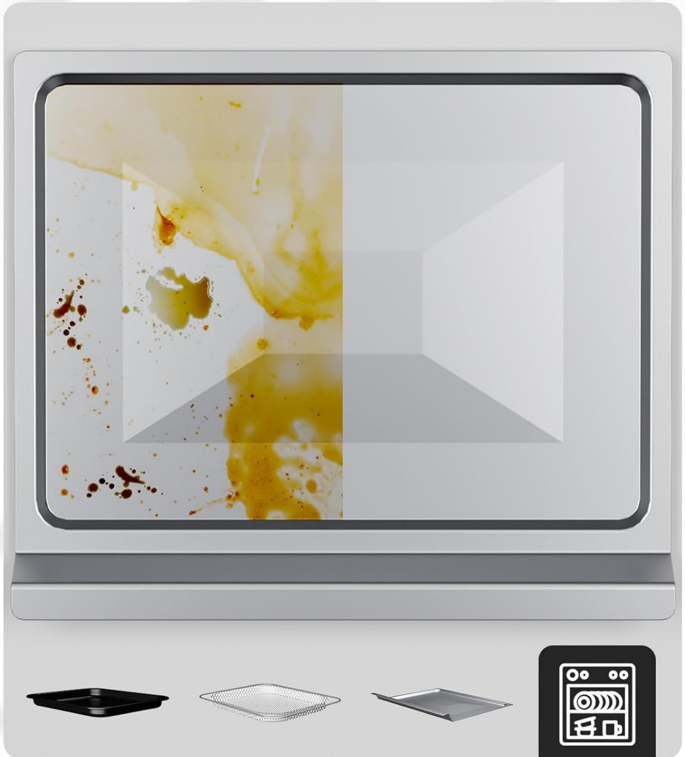
Figure 7: Easy to Clean Accessories